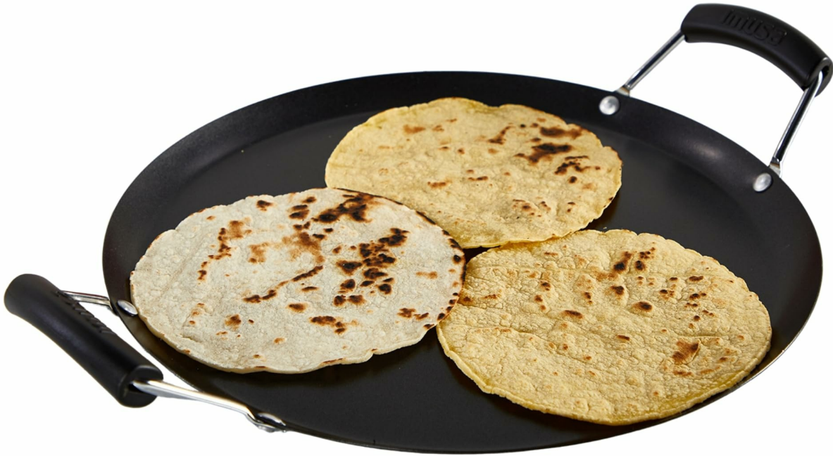
Image: The IMUSA 11-inch Carbon Steel Nonstick Round Comal, showcasing its round shape and cool-touch handles.