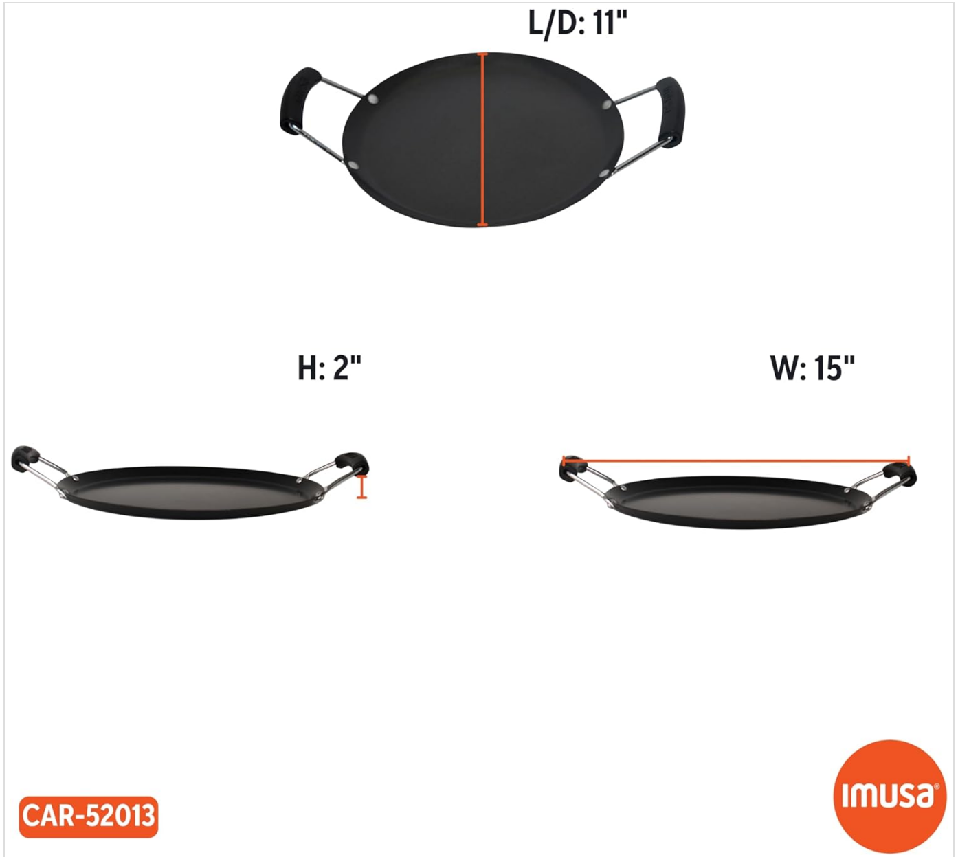
Image: Diagram showing the dimensions of the IMUSA Comal (L/D: 11", H: 2", W: 15").