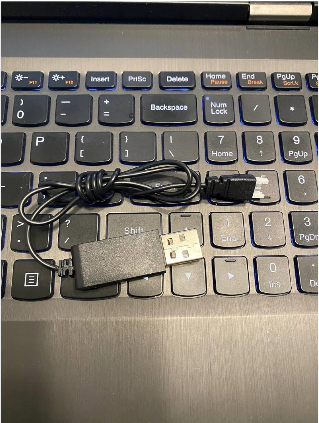
Figure 2.2: Close-up view of the charger, illustrating the USB-A input connector and the drone battery output connector.