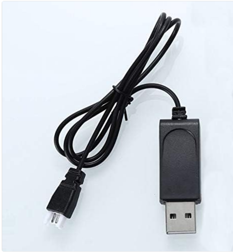
Figure 2.1: The Sharper Image DX-4 Battery Charger (Type 2), showing its compact design and cable.