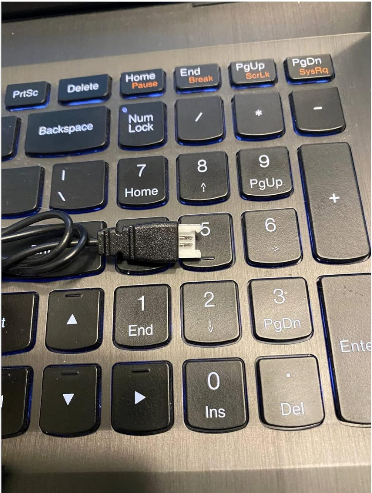
Figure 3.1: The USB-A connector of the charger, ready to be plugged into a compatible USB power port.