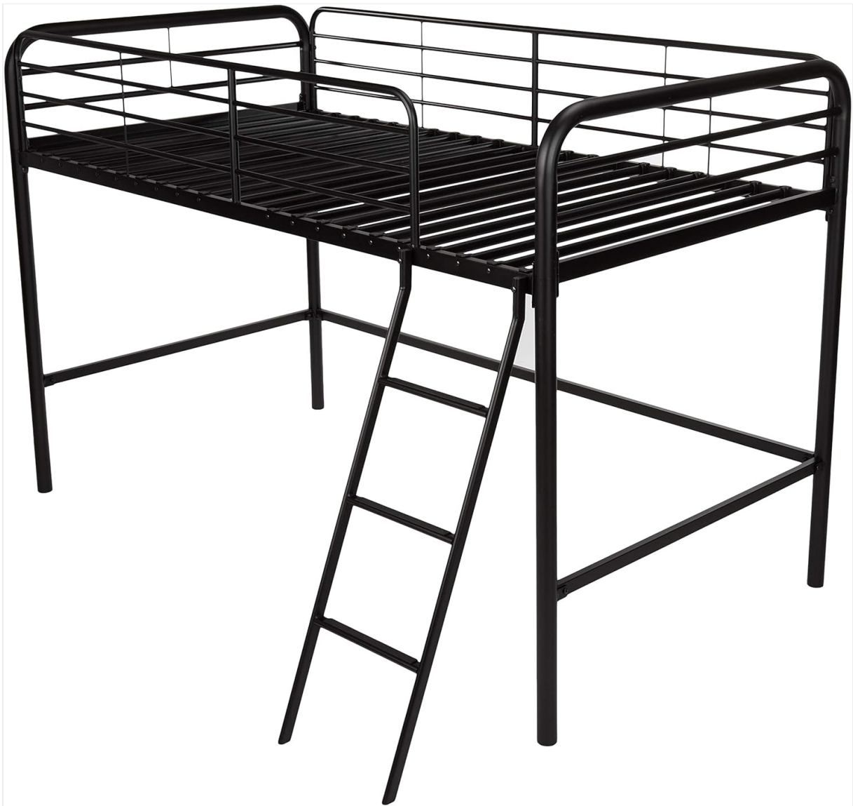
Figure 2: Angled view of the assembled loft bed, showcasing the integrated ladder and guard rails.