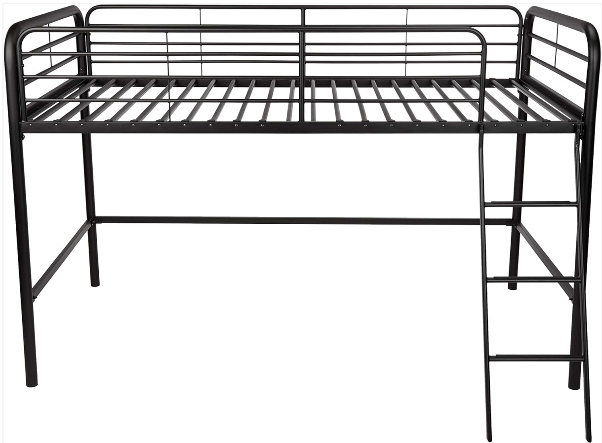
Figure 3: Front view of the assembled loft bed, showing the bed platform and the space underneath.