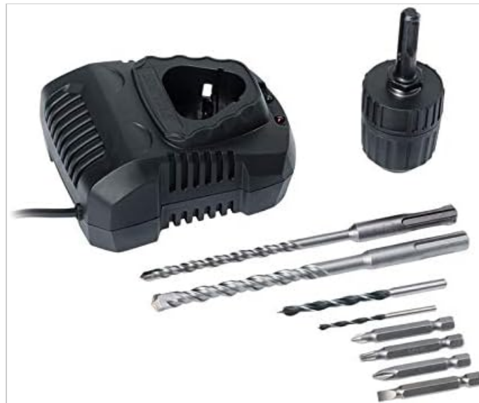
Image: A collection of accessories for the Parkside 12V Cordless Hammer Drill, including the charger, keyless chuck, SDS concrete drill bits, round drill bits, and screw bits.