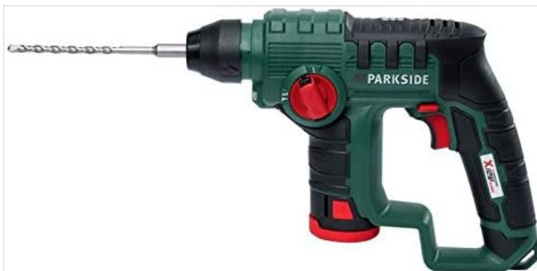
Image: Front view of the Parkside 12V Cordless Hammer Drill PBHA 12 A1 with a drill bit attached, showing the main body, handle, and chuck.

Familiarize yourself with the components of your Parkside Cordless Hammer Drill.