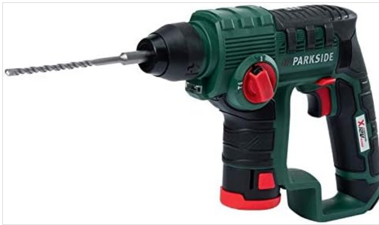
Image: Angled view of the Parkside 12V Cordless Hammer Drill PBHA 12 A1, highlighting the ergonomic handle and control switches.