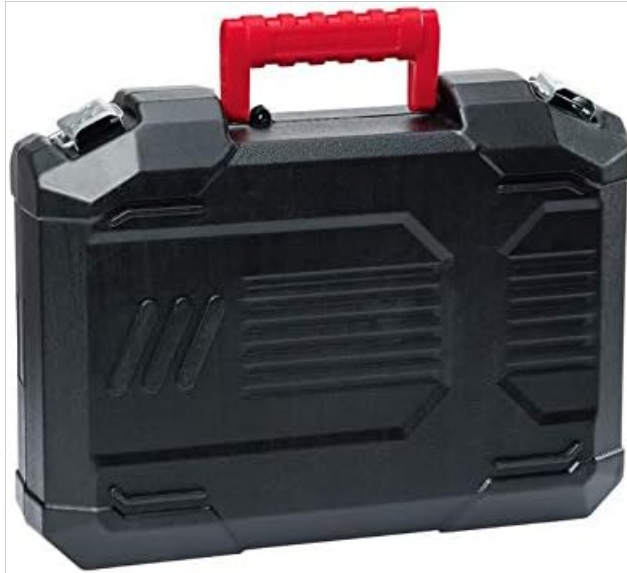
Image: The included storage case for the drill and accessories.