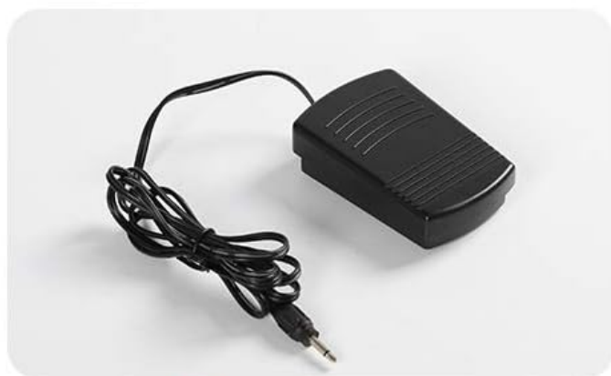
▼ Pedal controller

Image: The BTY N-5 Mini Portable Electric Sewing Machine with the extension table attached, providing a larger work surface.