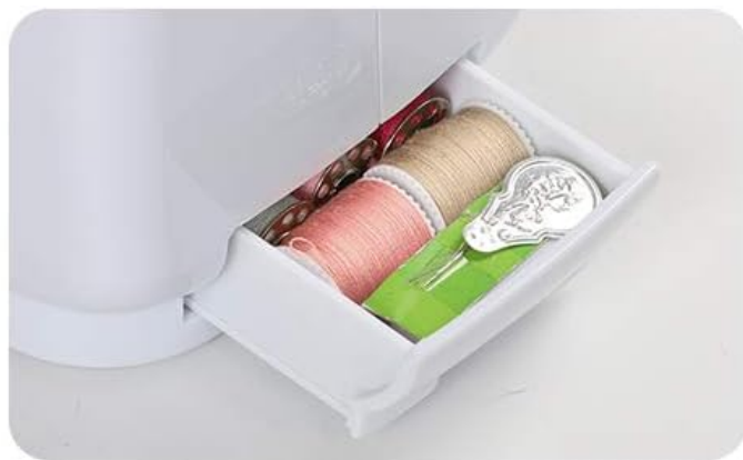
▼ Storage drawer