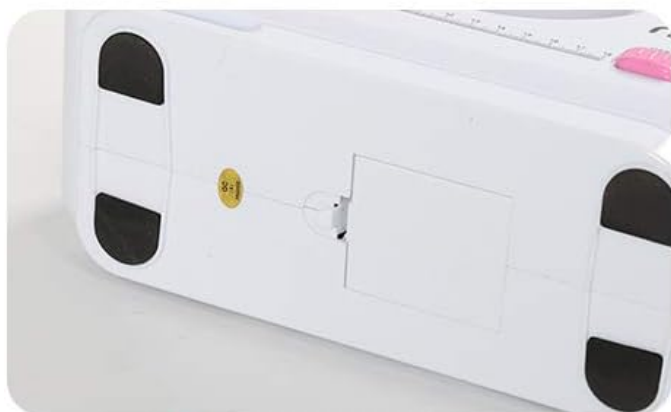
▼ Bottom mat