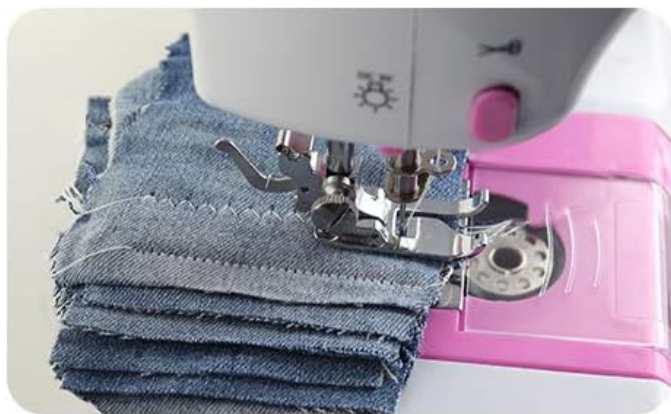
▼ Up to 5 layers of fabric (2.5mm)