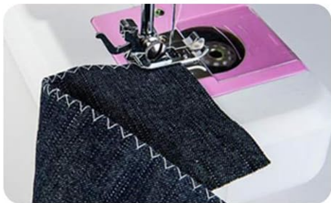
▼ Lock sewing