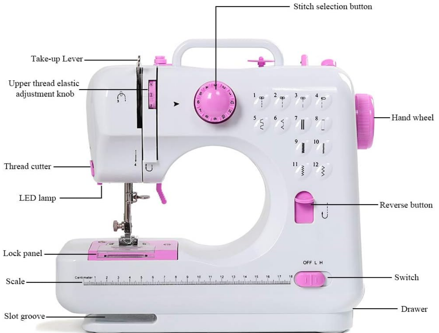
Image: Front view of the BTY N-5 Mini Portable Electric Sewing Machine, highlighting the stitch selection dial and various stitch patterns.

The machine features 12 built-in stitches. To select a stitch, turn the stitch selection button (dial) on the front of the machine to the desired stitch number. Refer to the stitch guide printed on the machine for visual reference.