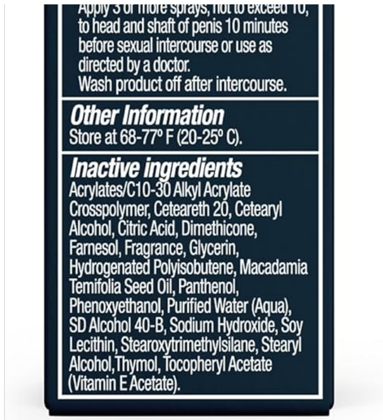
Image: Detailed Drug Facts label from the Promescent packaging, outlining active ingredients, purpose, warnings, and directions.