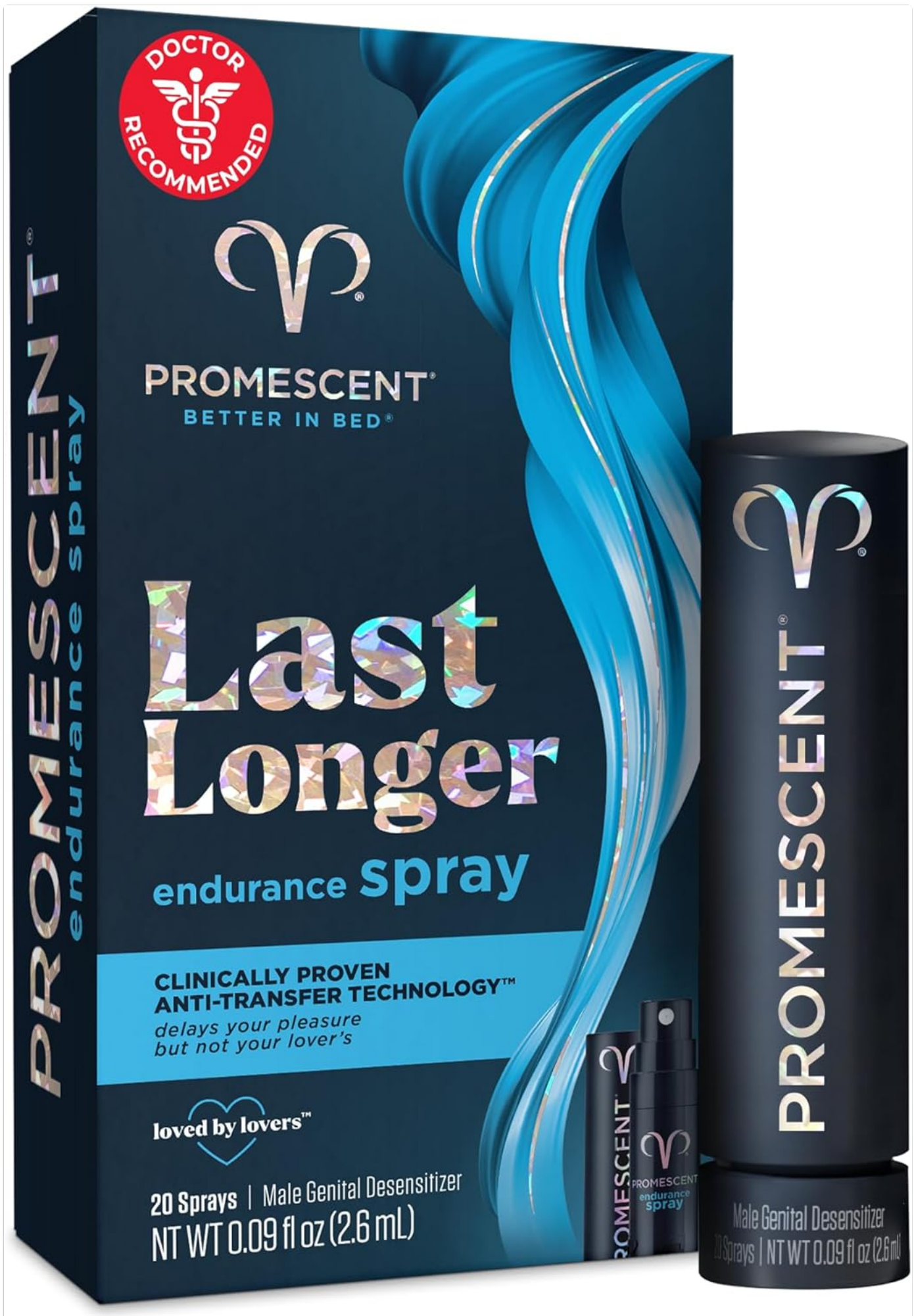
Image: Promescent Desensitizing Delay Spray, showing the product box and spray bottle.