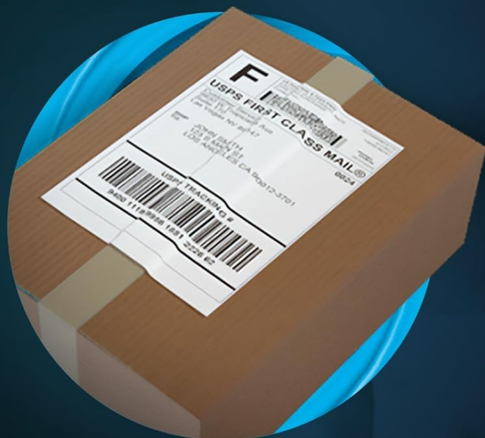
Image: An image depicting discreet packaging, emphasizing privacy for the customer.