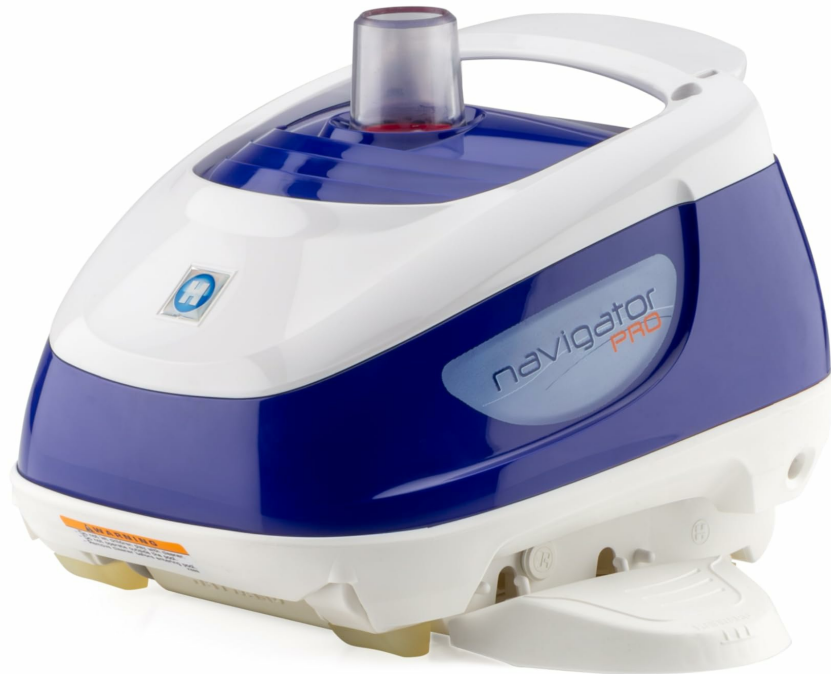
Image: The Hayward Navigator Pro Automatic Pool Vacuum, a blue and white unit designed for efficient pool cleaning.