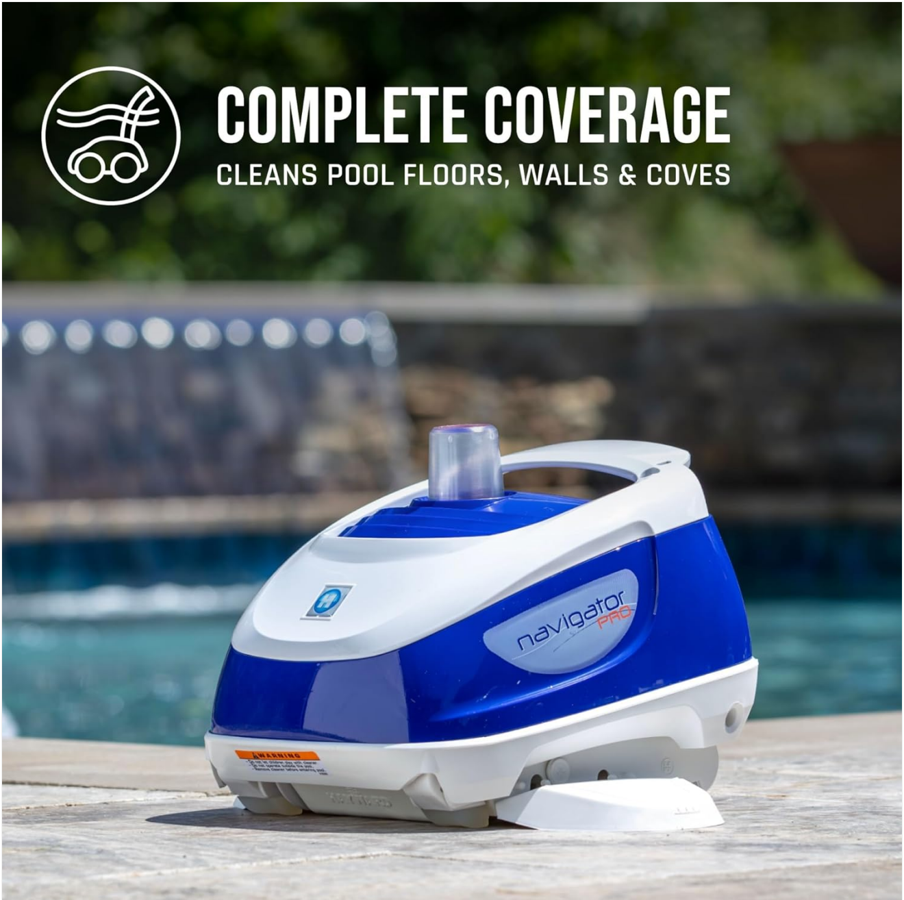
Image: The Hayward Navigator Pro in a pool, illustrating its complete coverage of pool floors, walls, and coves.