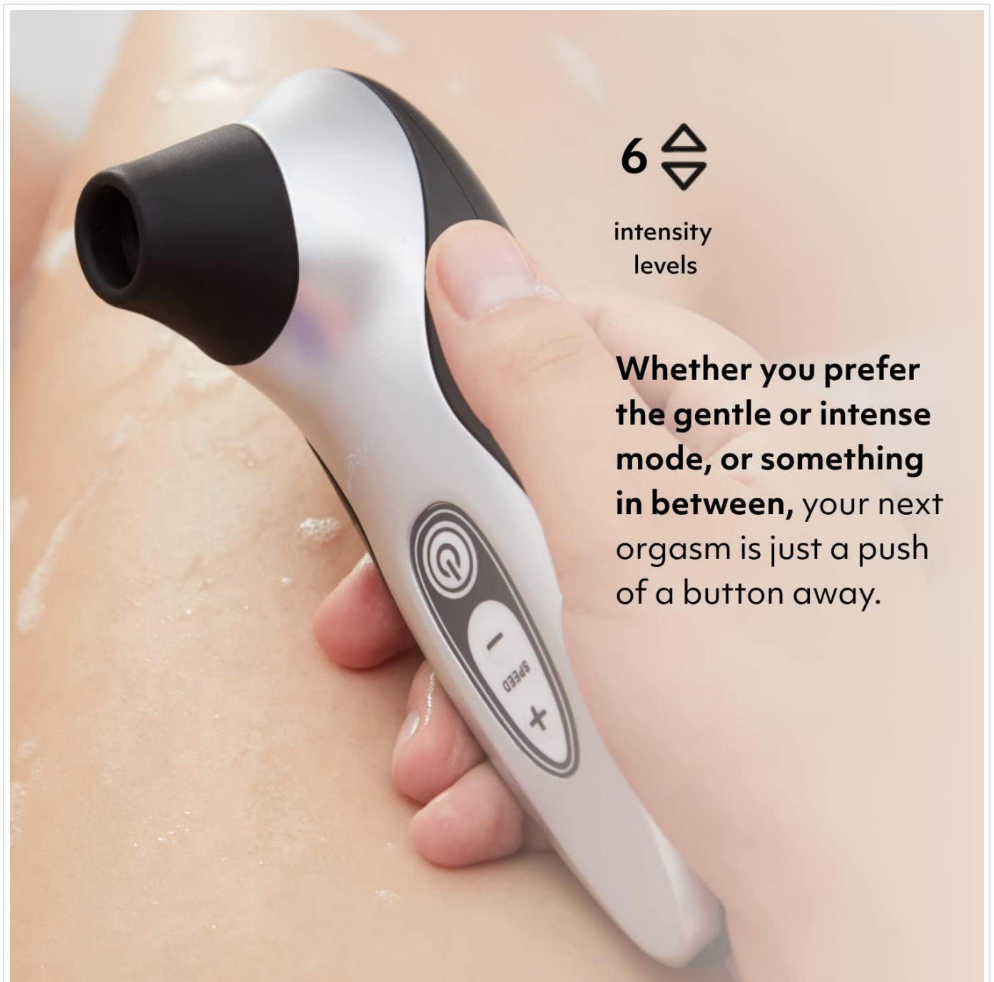
Figure 6.1: The Womanizer Pro40 held in a hand, highlighting the six adjustable intensity levels for personalized use.

Your browser does not support the video tag.