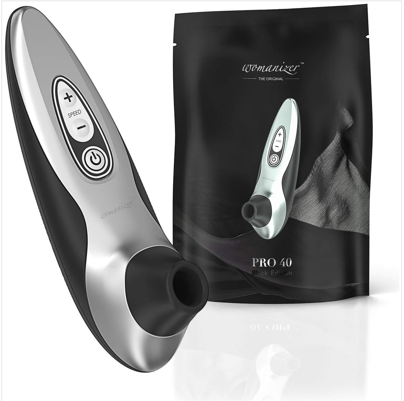
Figure 3.1: The Womanizer Pro40 device displayed alongside its product packaging, which includes branding and model information.