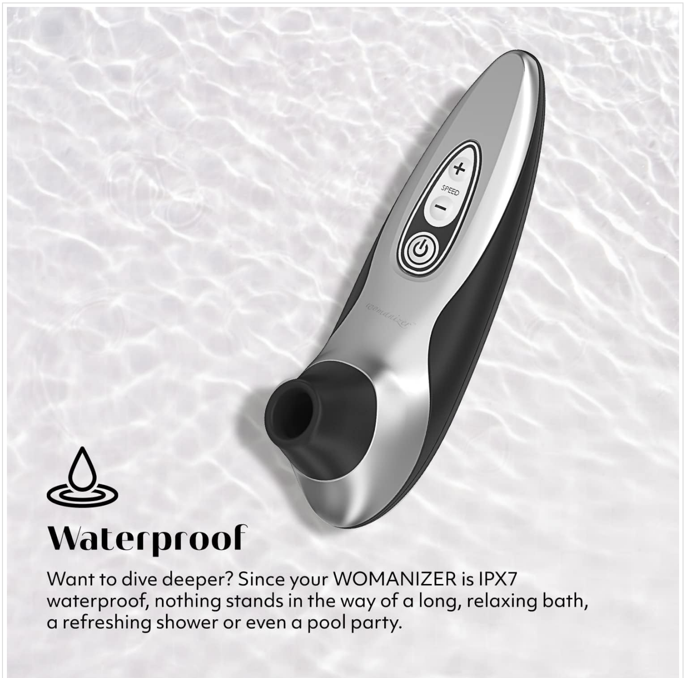
Figure 7.1: The Womanizer Pro40 shown partially submerged in water, illustrating its IPX7 waterproof rating suitable for use in wet environments, which also aids in cleaning.