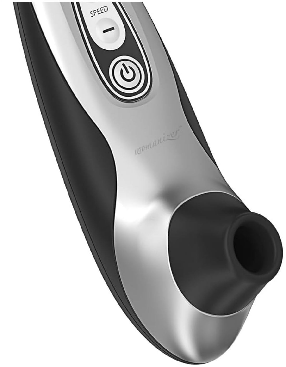
Figure 2.1: The Womanizer Pro40 Clitoral Stimulator, featuring a sleek black and silver design with control buttons for power and intensity.