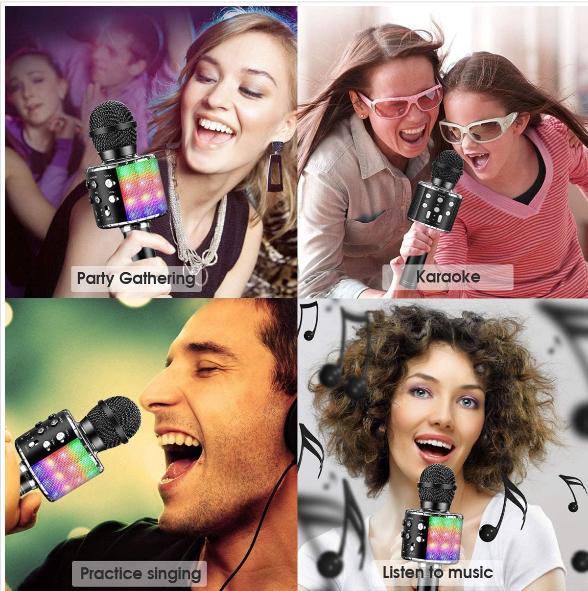
Image: Individuals enjoying the microphone in different scenarios, including karaoke, singing practice, and listening to music.