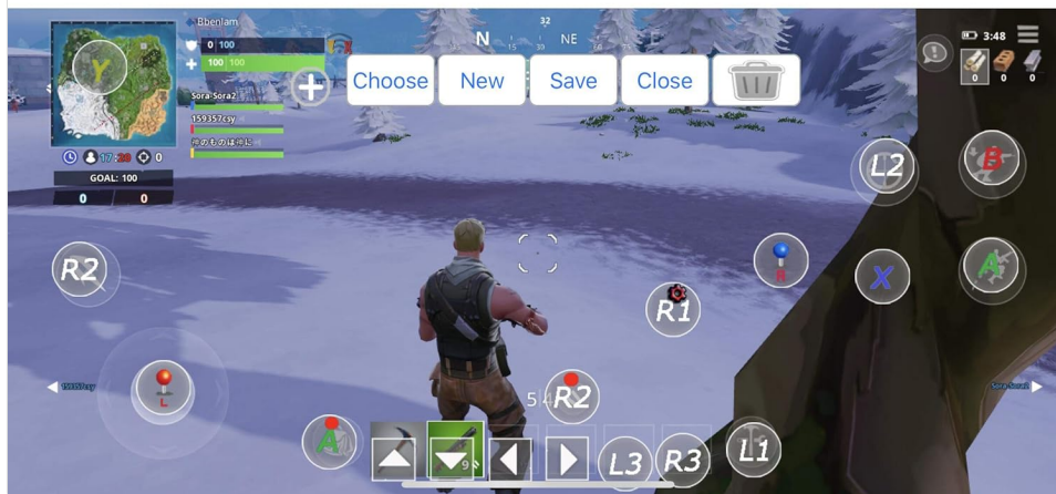
Image 5.1: The controller is compatible with popular mobile games such as PUBG and Fortnite.

key mapping with your preferences on any game