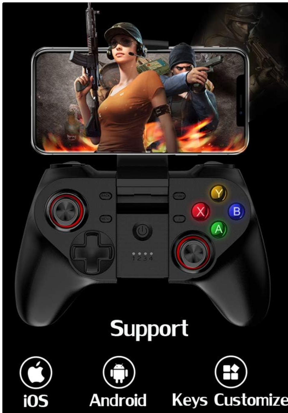
Image 3.2: The controller with a smartphone mounted, illustrating its compatibility with iOS and Android devices, and its key customization feature.