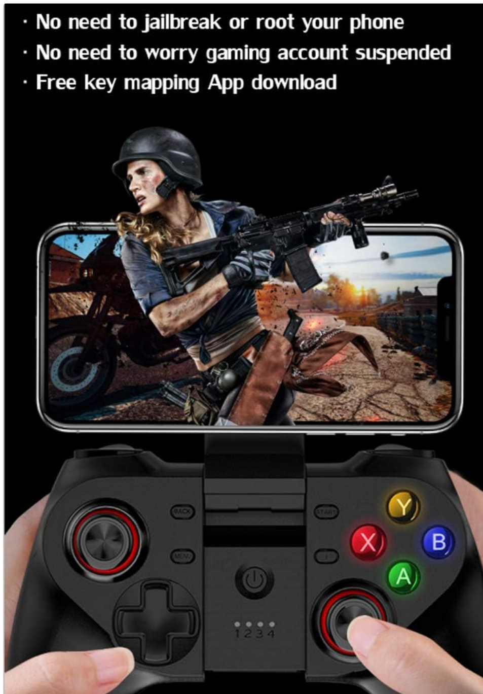
Image 4.1: The controller in use, emphasizing that no jailbreak or root is required, and a free key mapping app is available.

For optimal performance and customizable controls, download the dedicated key mapping application. This application allows you to assign controller buttons to specific touch screen areas in your games. The controller does not require rooting or jailbreaking your device.