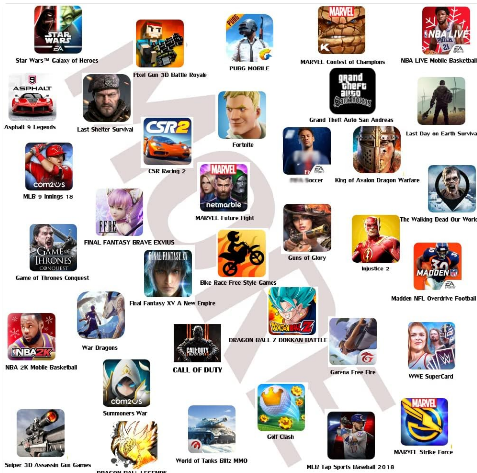
Image 5.2: A selection of mobile games compatible with the Megadream controller.