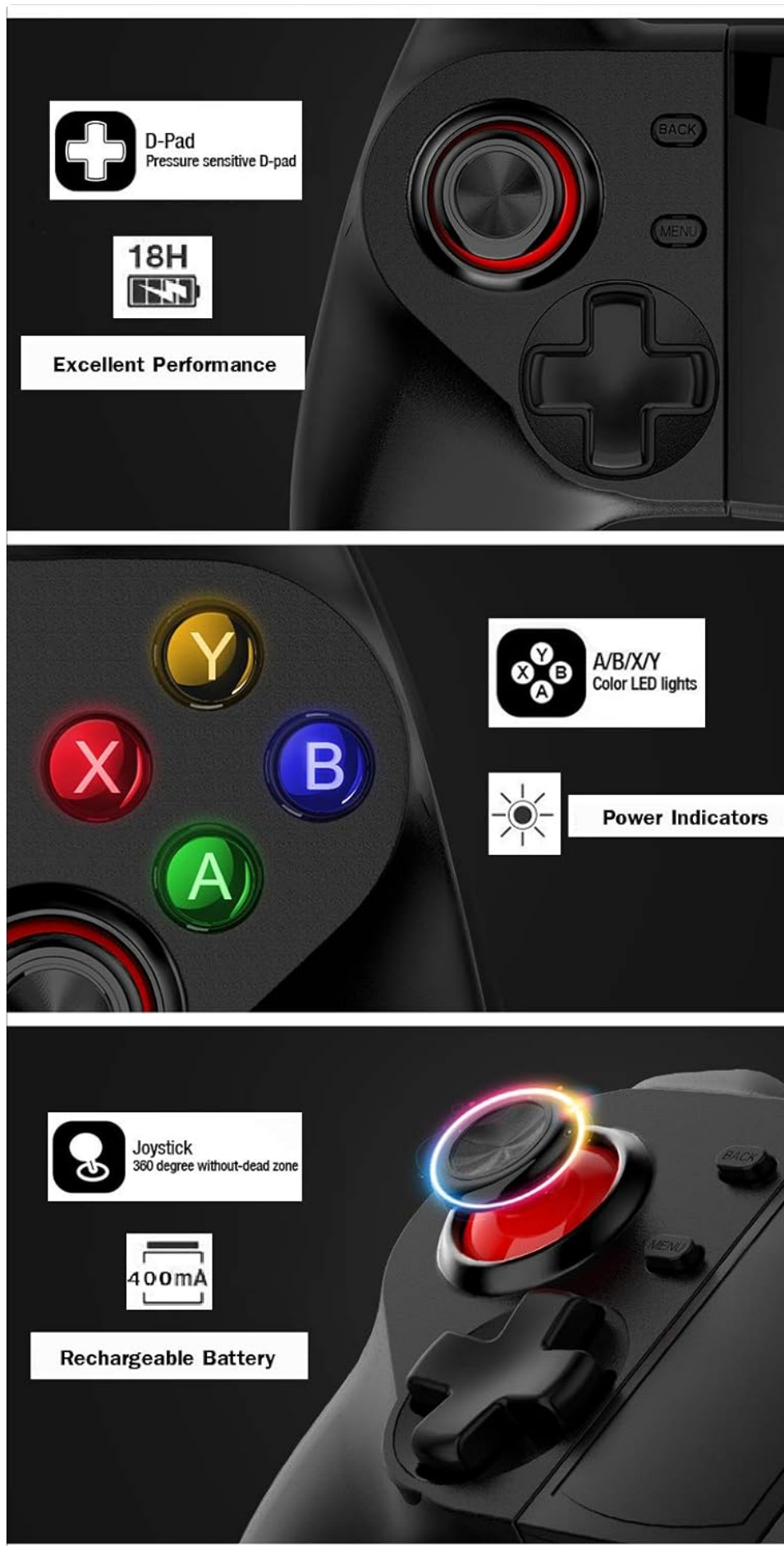
Image 3.1: Front view of the Megadream Mobile Game Controller highlighting its components including the D-Pad, action buttons, joysticks, and power indicators. It also shows an 18-hour battery life and 400mA rechargeable battery.