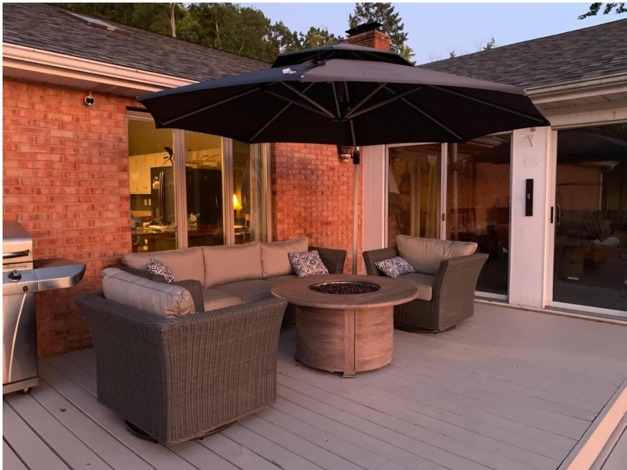
Image 1: The PURPLE LEAF 365 cm Rectangular Cantilever Umbrella providing shade over a patio seating area.