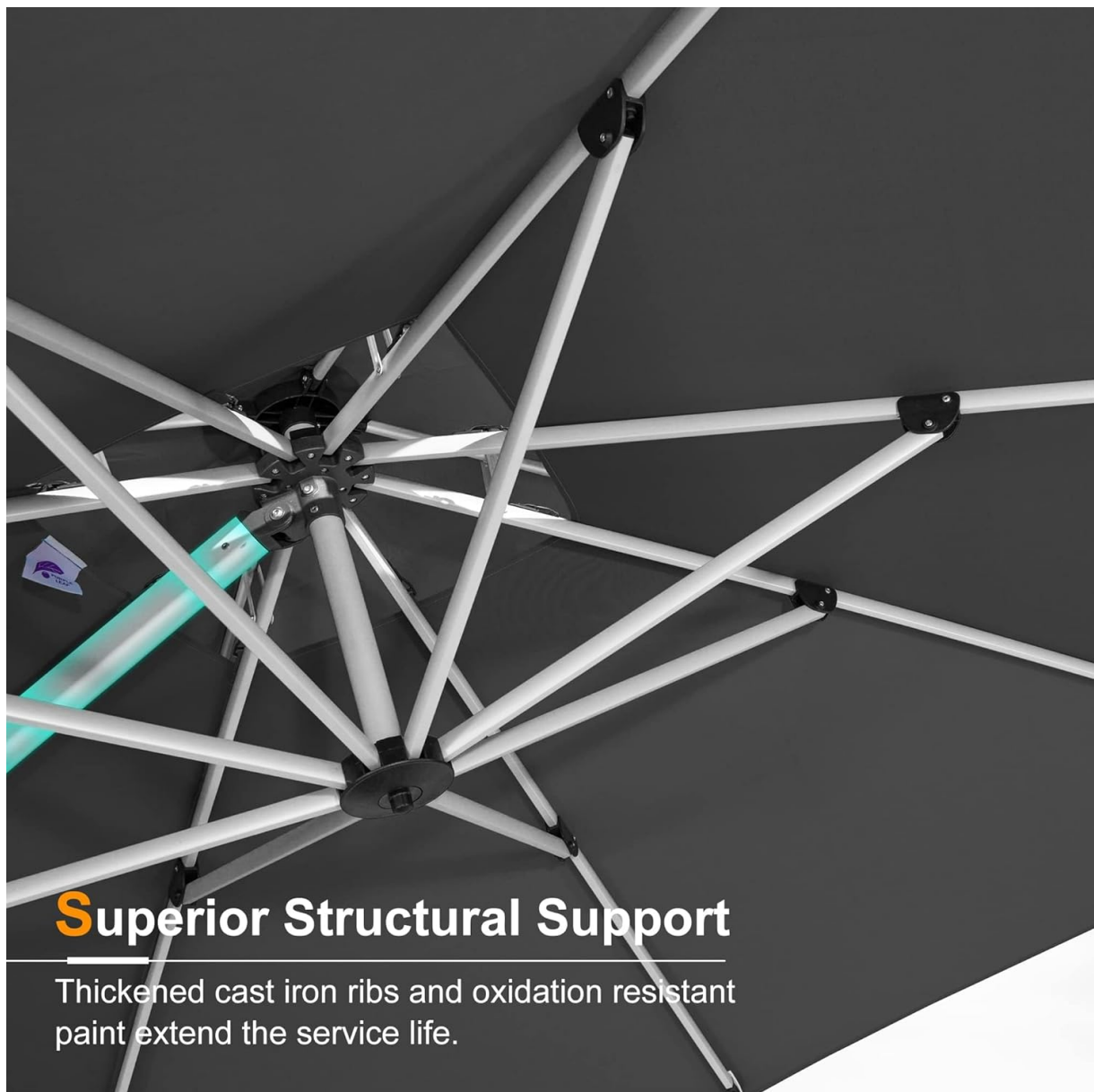
Image 2: Detail of the umbrella's superior structural support, showing thickened ribs for stability.

The umbrella features a robust structural design with thickened cast iron ribs and oxidation-resistant paint for extended service life.