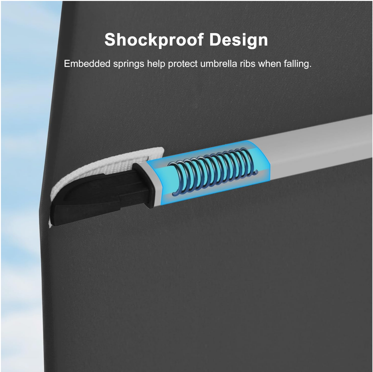
Image 4: Illustration of the shockproof design with embedded springs protecting the umbrella ribs.

Embedded springs help protect umbrella ribs when falling.