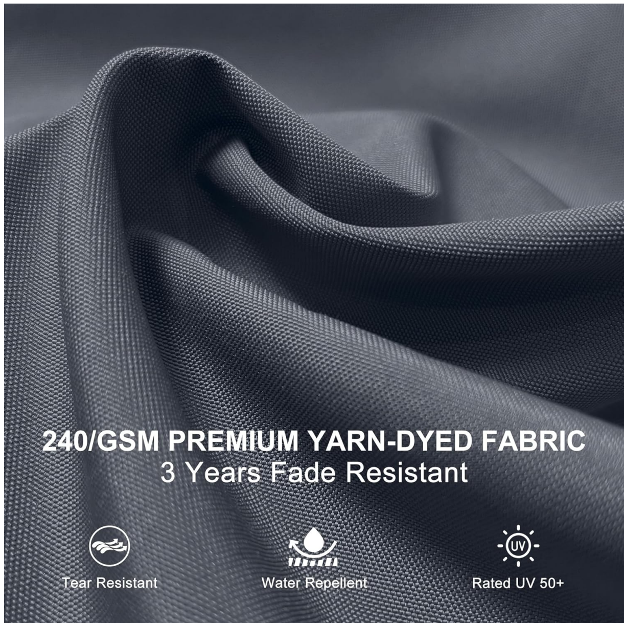
Image 5: Detail of the 240 GSM premium yarn-dyed fabric, showcasing its durability and protective features.