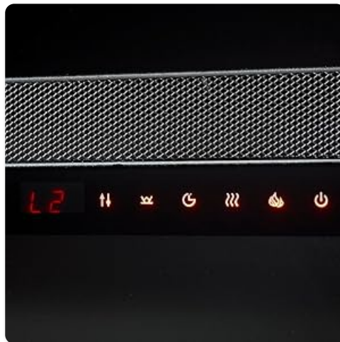
An alternative close-up of the control panel, providing another perspective on the touch-sensitive buttons and digital readouts. The hidden touch controls mirror the remote's functionality, allowing direct interaction with the fireplace settings.