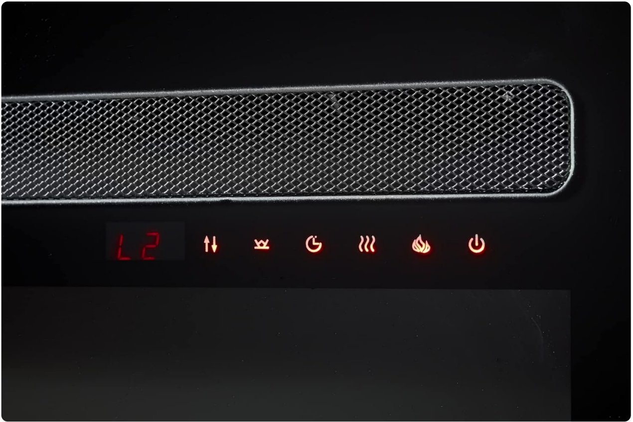
A close-up of the fireplace's hidden touch controls, showing the digital display and various function icons for manual operation.