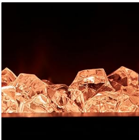
Figure 3: Acrylic Crystal Media