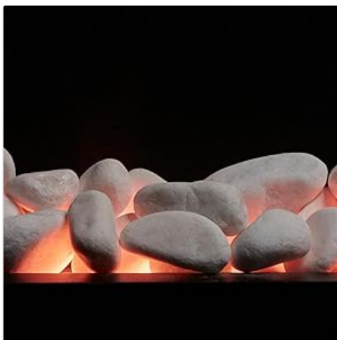
Figure 5: Pebble Media