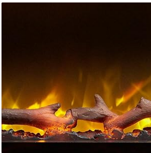
Figure 4: Log Media