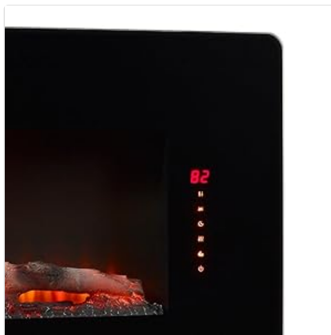
Figure 2: Onboard control panel with digital display and function buttons.

The Dimplex Winslow fireplace can be operated using the multi-function remote control or the onboard controls located on the top right corner of the unit.