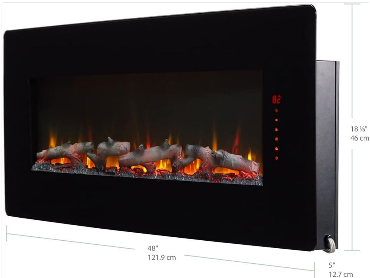
Figure 1: Dimplex Winslow 48-inch Electric Fireplace with key dimensions. The unit measures 48 inches wide, 18.1 inches high, and 5 inches deep. This image displays the fireplace with the log media option installed.