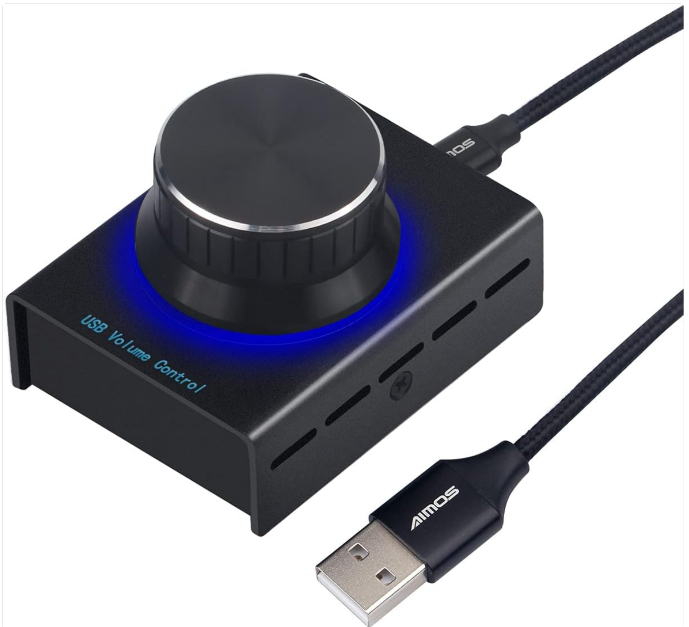
Image: The AIMOS USB Volume Controller Knob, showcasing its compact design and included USB cable.