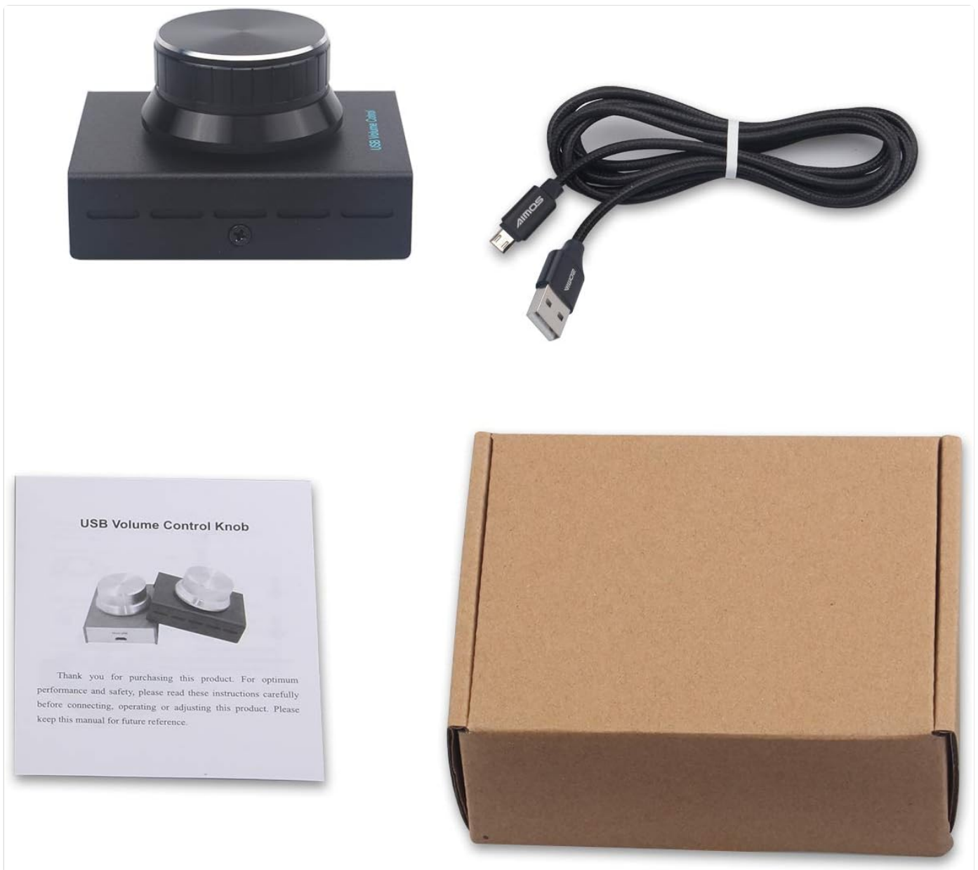
Image: Contents of the product package, showing the volume controller, USB cable, and user manual.