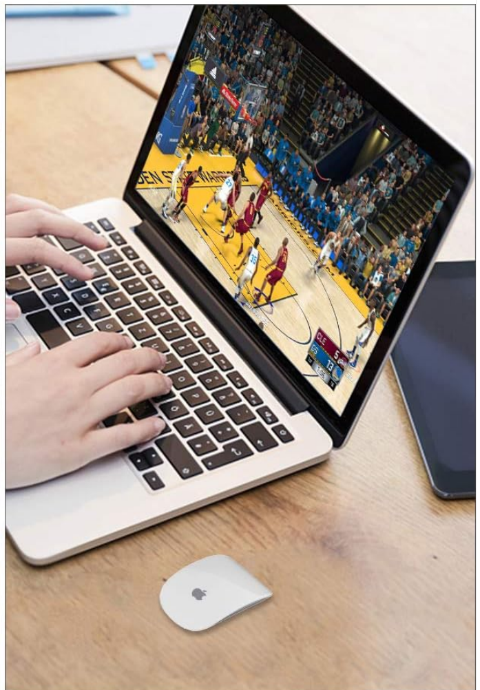
Image: The USB volume controller connected to a laptop, demonstrating its use for adjusting system volume, even in full-screen applications.