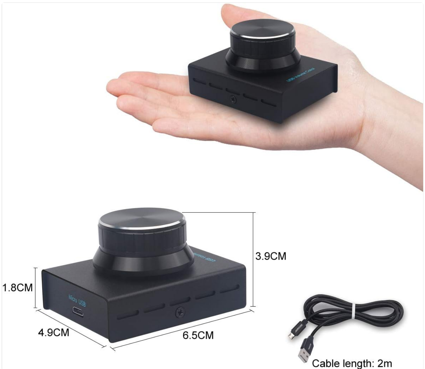
Image: Detailed dimensions of the AIMOS USB Volume Controller Knob (Length: 65mm, Width: 49mm, Height: 39mm) and its 2-meter USB cable.