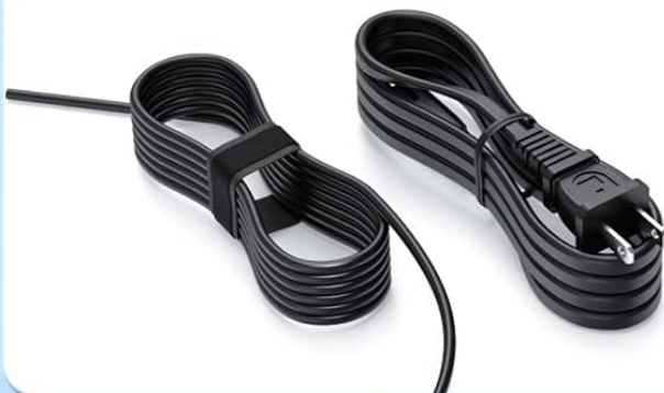
Image: The Superer 19V AC power adapter and its accompanying power cord.