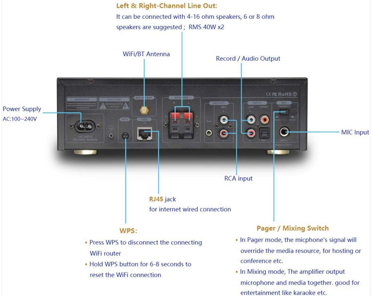
Figure 4.2: Rear Panel Connections

This image illustrates the rear panel of the KEiiD KD-240WF amplifier, detailing the power input, speaker terminals, RCA audio input and output, microphone input, RJ45 LAN port, WPS button, and the WiFi/Bluetooth antenna connector.