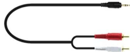
5 ft Audio Cord