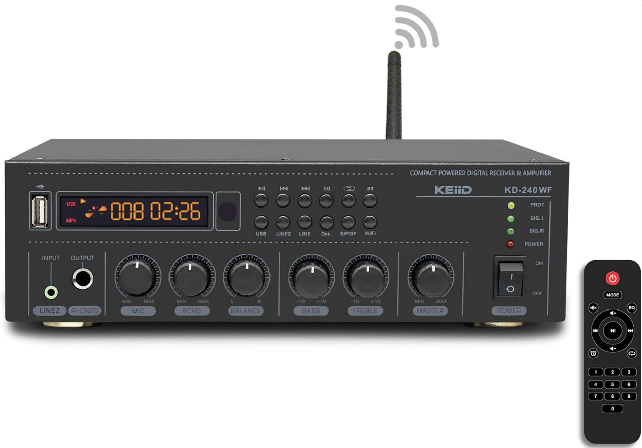
Figure 4.1: Front Panel Overview

This image shows the front panel of the KEiiD KD-240WF amplifier, highlighting the display screen, input selection buttons, playback controls, and rotary knobs for microphone, echo, balance, bass, treble, and master volume, along with the power switch.