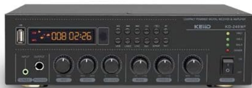
Receiver & Amplifier