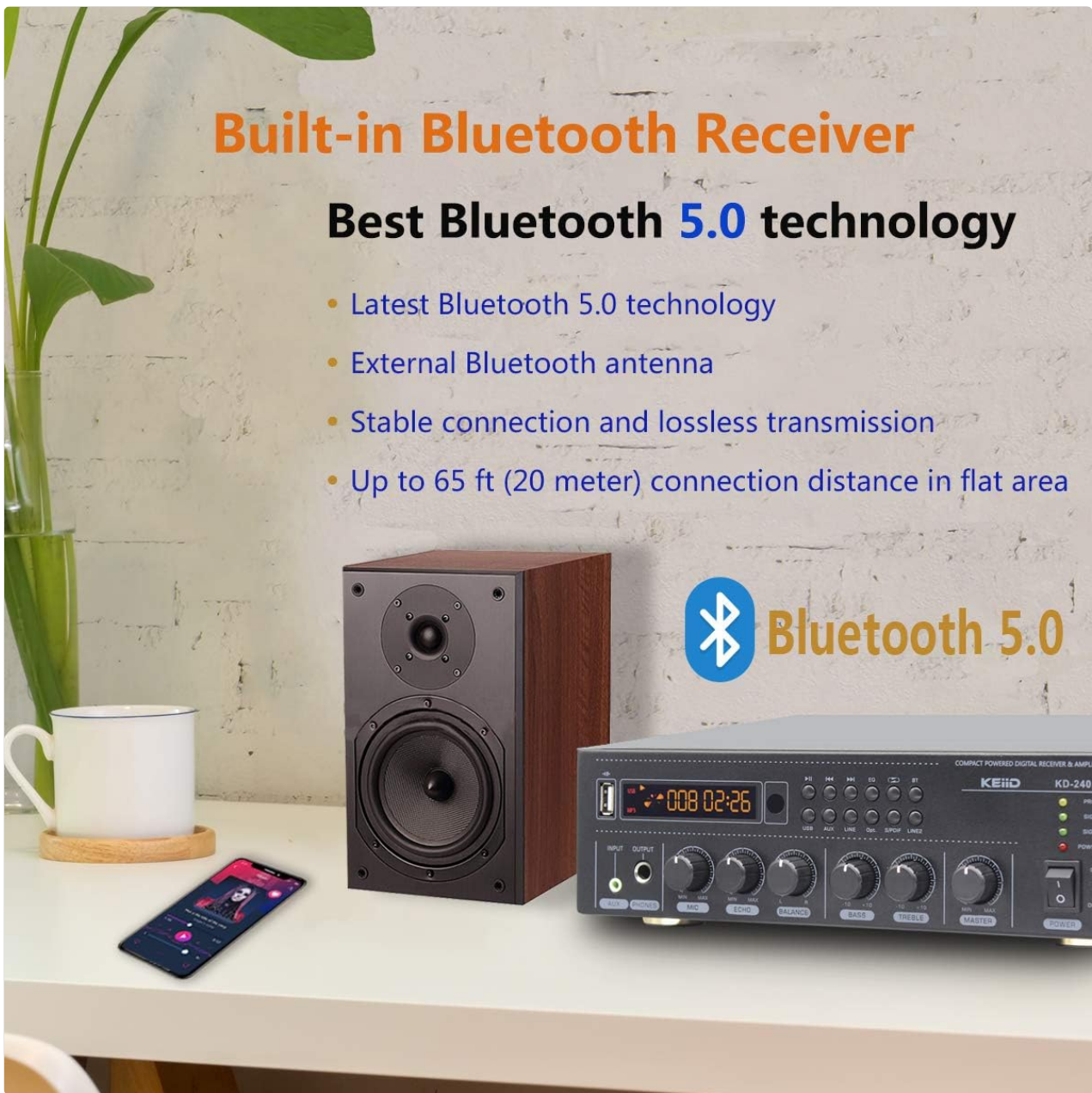
Figure 6.1: Bluetooth 5.0 Connectivity

This image emphasizes the Bluetooth 5.0 capability of the KEiID KD-240WF amplifier, showing a mobile phone connected wirelessly to the unit, indicating stable and lossless audio transmission.