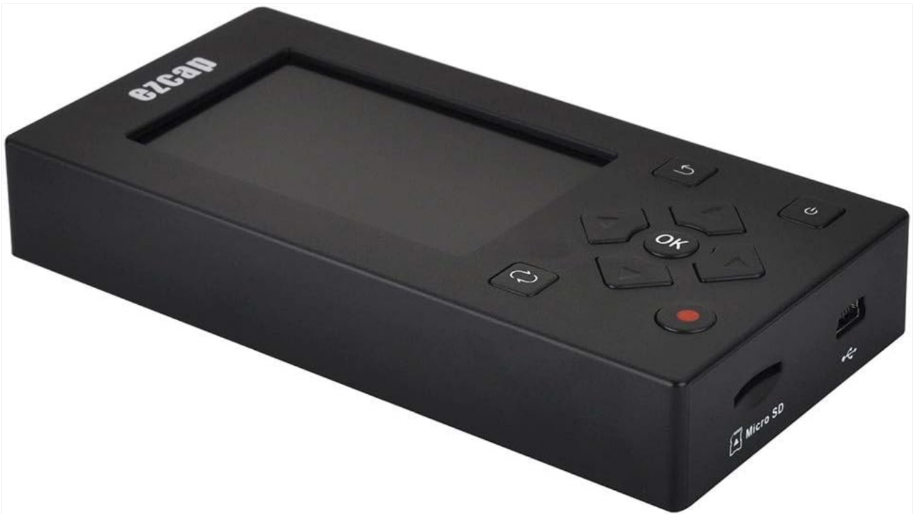
Image 5.1: Side view of the ezcap271 AV Recorder, illustrating the Micro SD card slot and the Mini USB port.