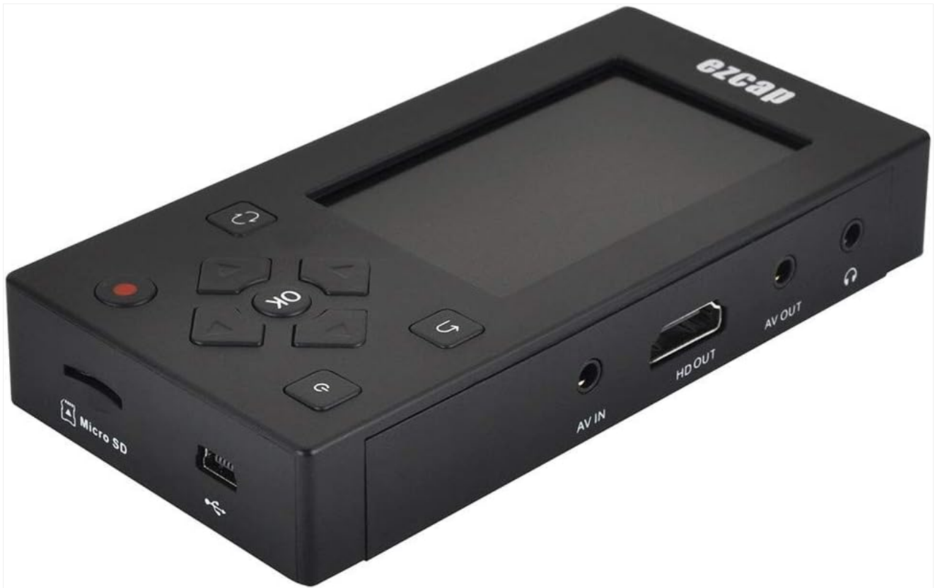
Image 6.1: Top view of the ezcap271 AV Recorder, clearly showing the 3-inch screen, directional pad with OK button, power button, return button, and record button.