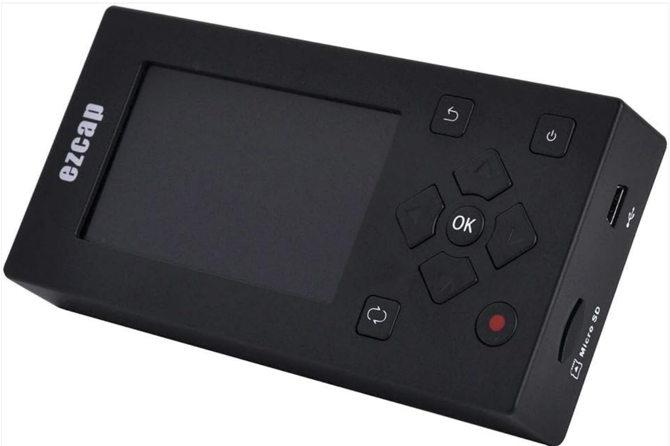
Image 1.1: Angled view of the ezcap271 AV Recorder, highlighting its 3-inch display and control buttons. The device is black with "ezcap" branding on the left side.

The ezcap271 AV Recorder is a standalone device designed to convert analog video and audio signals into digital format. It allows users to record content from various sources such as VHS tapes, camcorders, DVD players, DVRs, and gaming systems directly to an internal 8GB memory card or an external Micro SD card, without the need for a computer. It features a 3-inch screen for previewing recordings and playback, and can also convert old music to digital MP3 format.