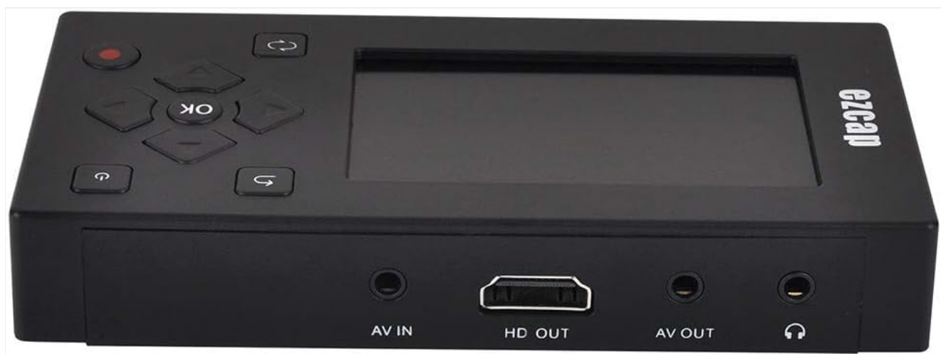
Image 4.1: Rear view of the ezcap271 AV Recorder, displaying the AV IN, HD OUT (HDMI), AV OUT, and Earphone ports.