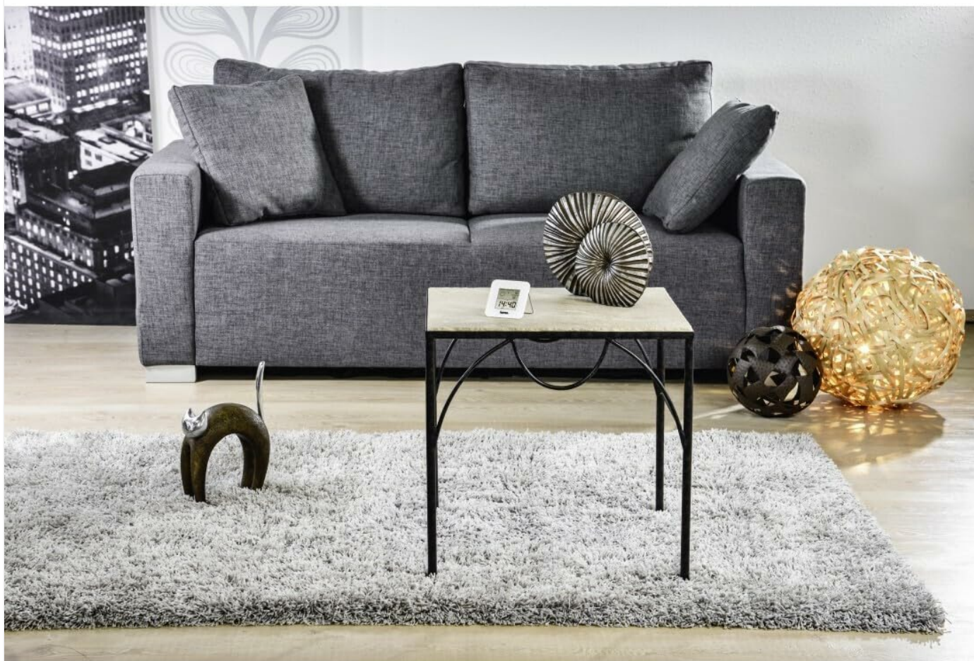
Image: The Hama TH50 Thermo/Hygrometer displayed on a small table in a modern living room setting, demonstrating typical placement.