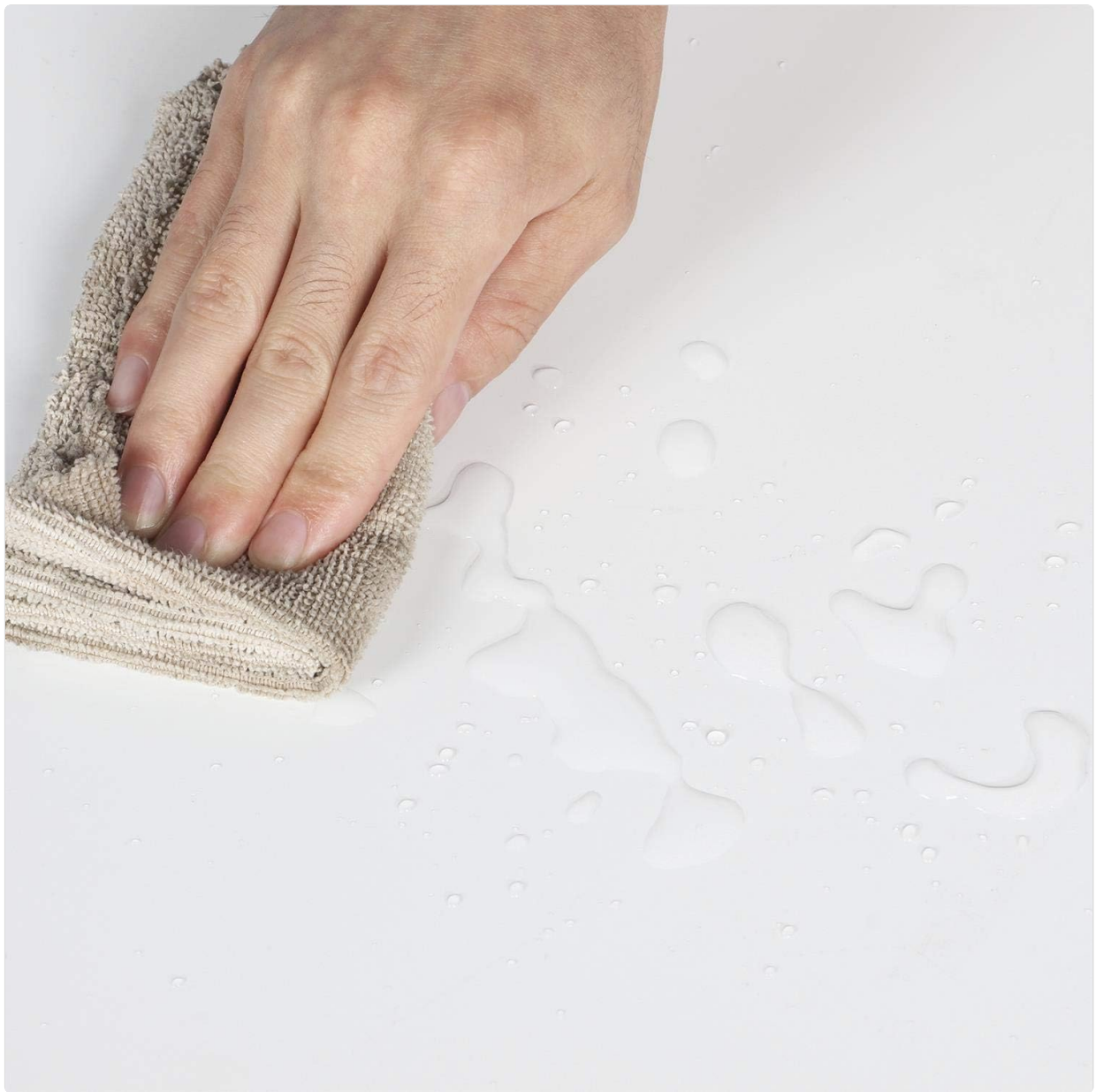
Figure 5: Easy Cleaning. The cabinet's white finish is designed for easy cleaning, allowing you to simply wipe away spills and dust with a damp cloth.