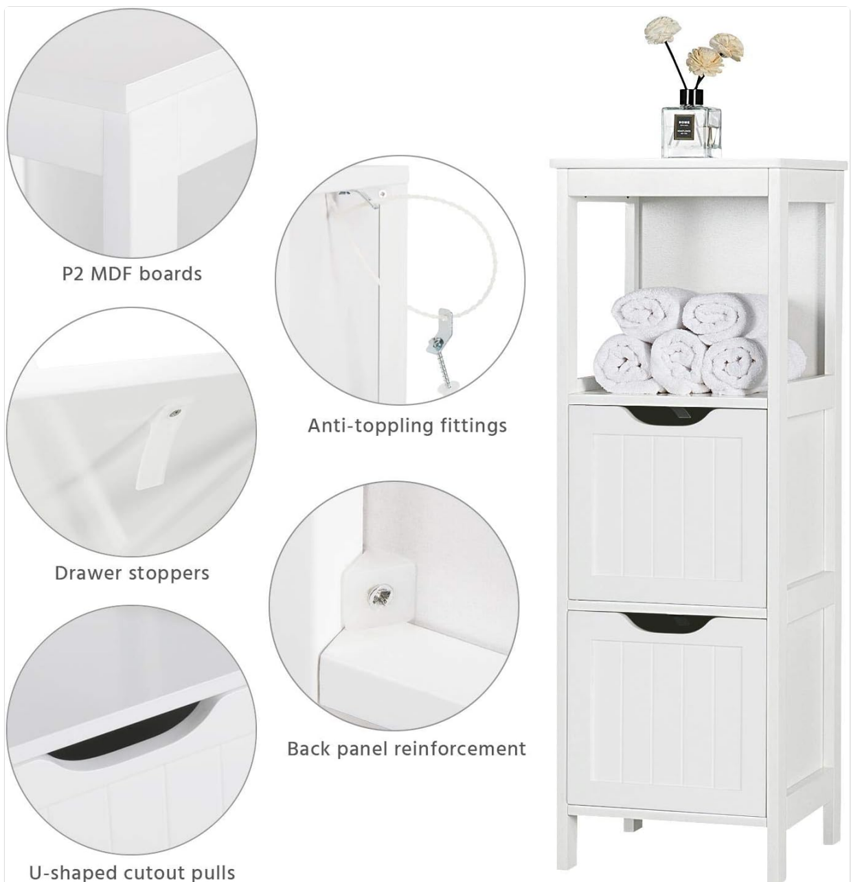
Figure 2: Key Features. This image highlights the P2 MDF boards, anti-toppling fittings for wall security, drawer stoppers to prevent drawers from sliding out completely, back panel reinforcement for stability, and the convenient U-shaped cutout pulls on the drawers.