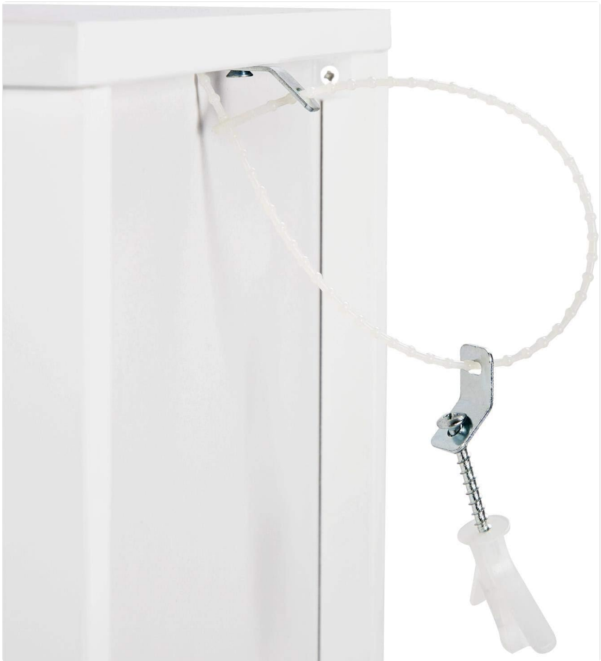
Figure 3: Anti-Toppling Device. This shows a close-up of the anti-toppling fitting, which should be securely attached to the wall to prevent the cabinet from tipping over, especially in households with children or pets.