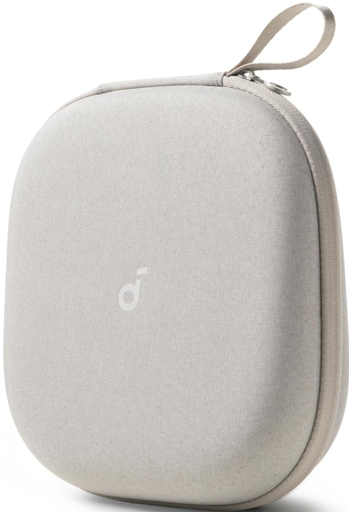
Image: The Soundcore Life Q10 headphones folded and stored within their included light grey carrying case, highlighting portability.