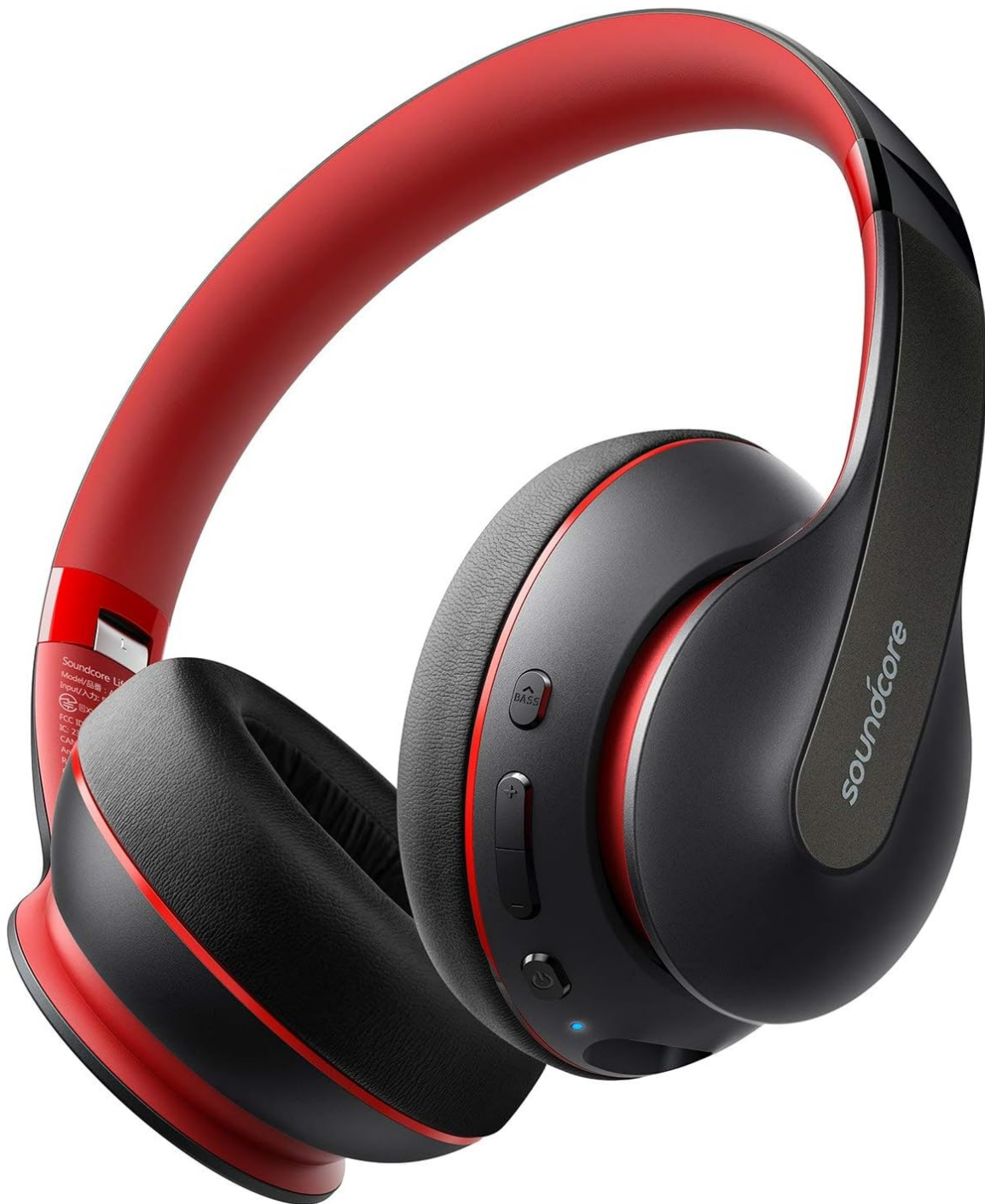
Image: Soundcore Anker Life Q10 Wireless Bluetooth Headphones, showcasing their black and red design.