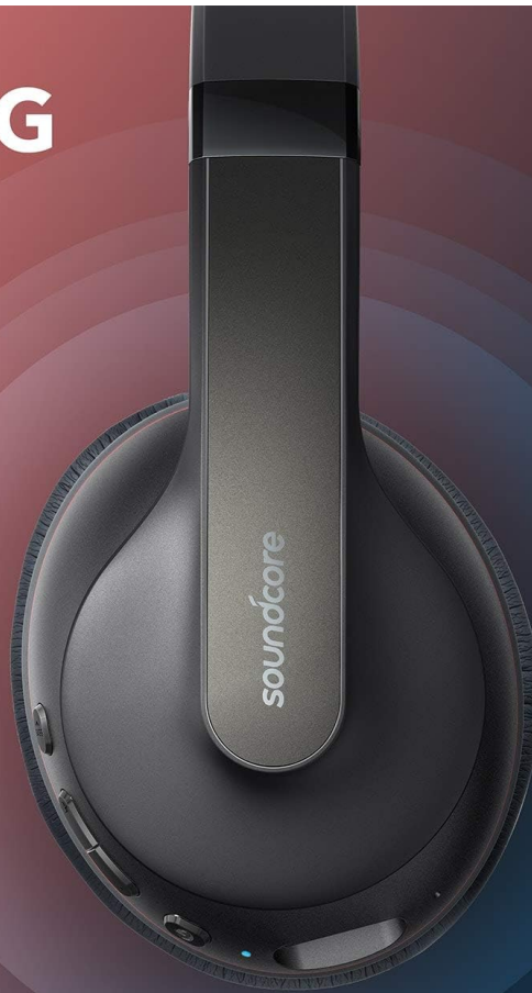
Image: A close-up view of a Soundcore Life Q10 earcup, illustrating the 'Thumping Bass' feature with a visual representation of sound waves.

BassUp technology paired with oversized 40mm drivers.