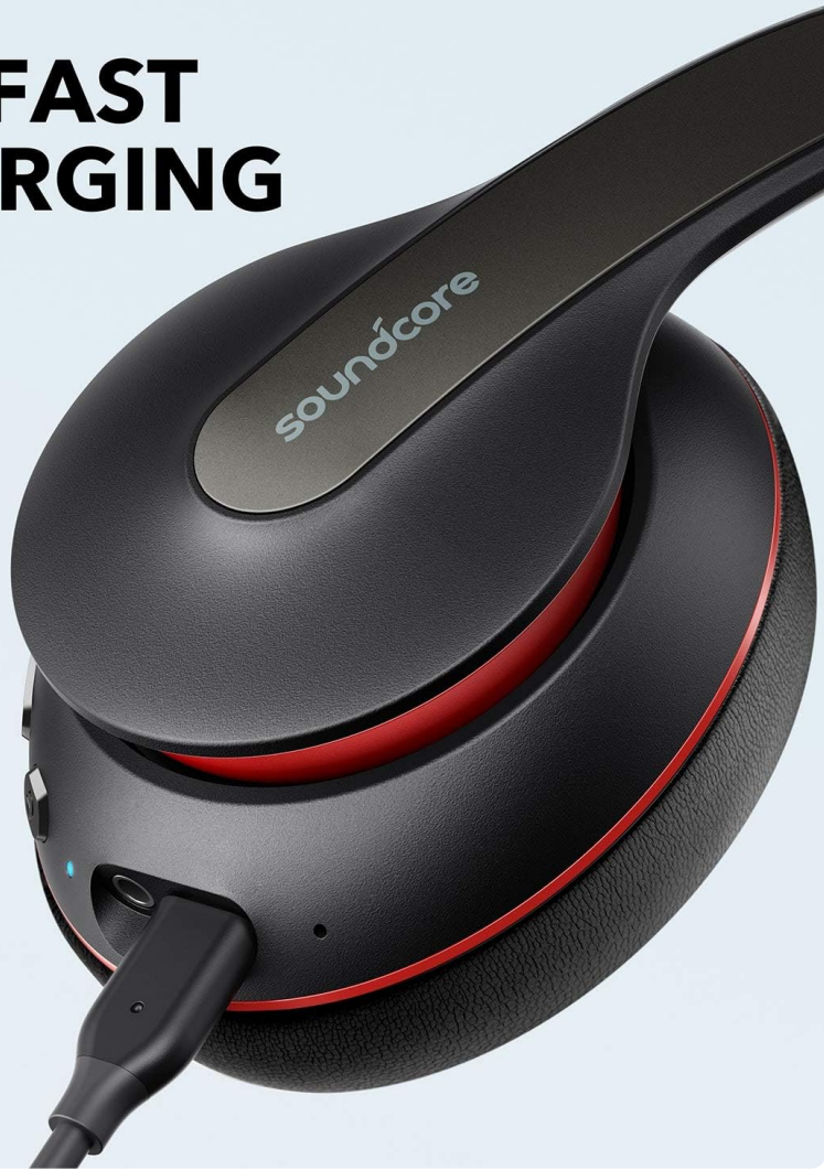
Image: A close-up of the USB-C charging port on the Soundcore Life Q10 headphones, detailing the 'USB-C Fast Charging' capability.