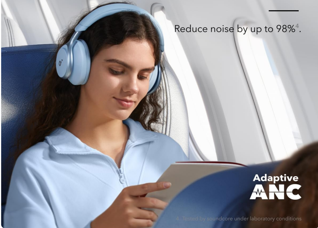
Image: A person wearing light blue headphones on an airplane, illustrating the noise-cancelling feature in a travel environment.