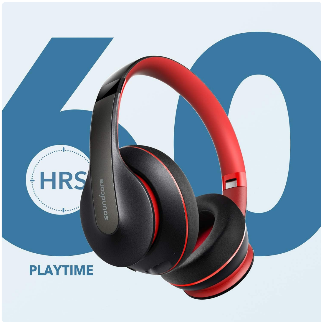
Image: The Soundcore Life Q10 headphones with a prominent '60 HRS Playtime' graphic, highlighting their long battery life.