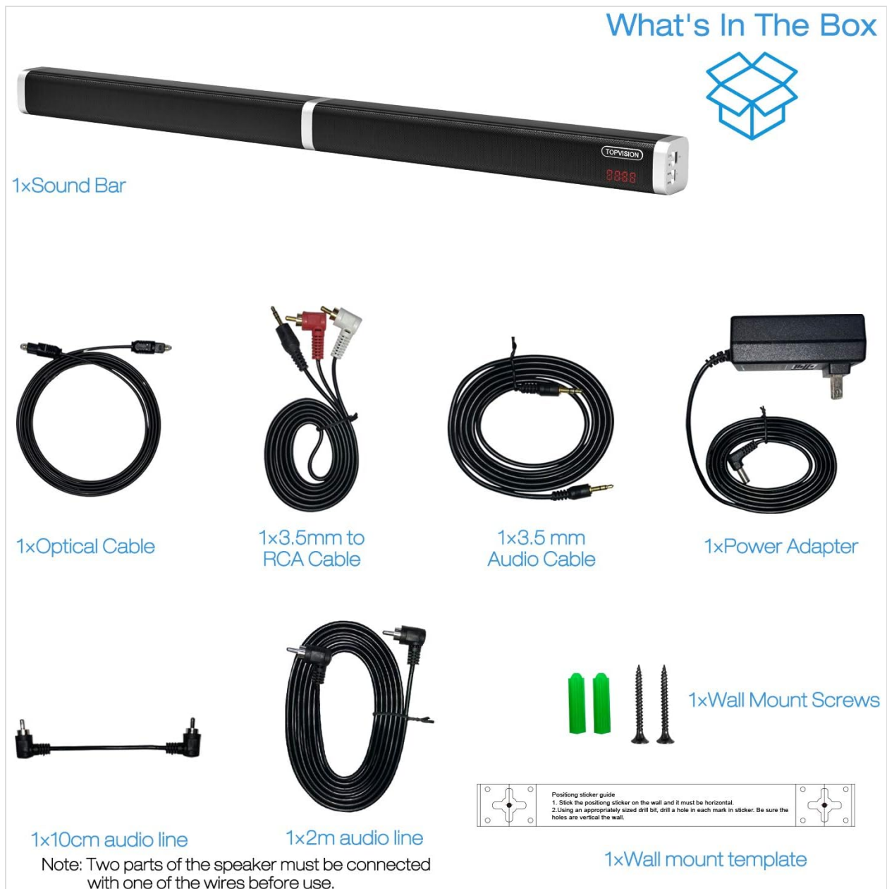
Image 2.1: All components included in the TOPVISION SD01 Soundbar package.