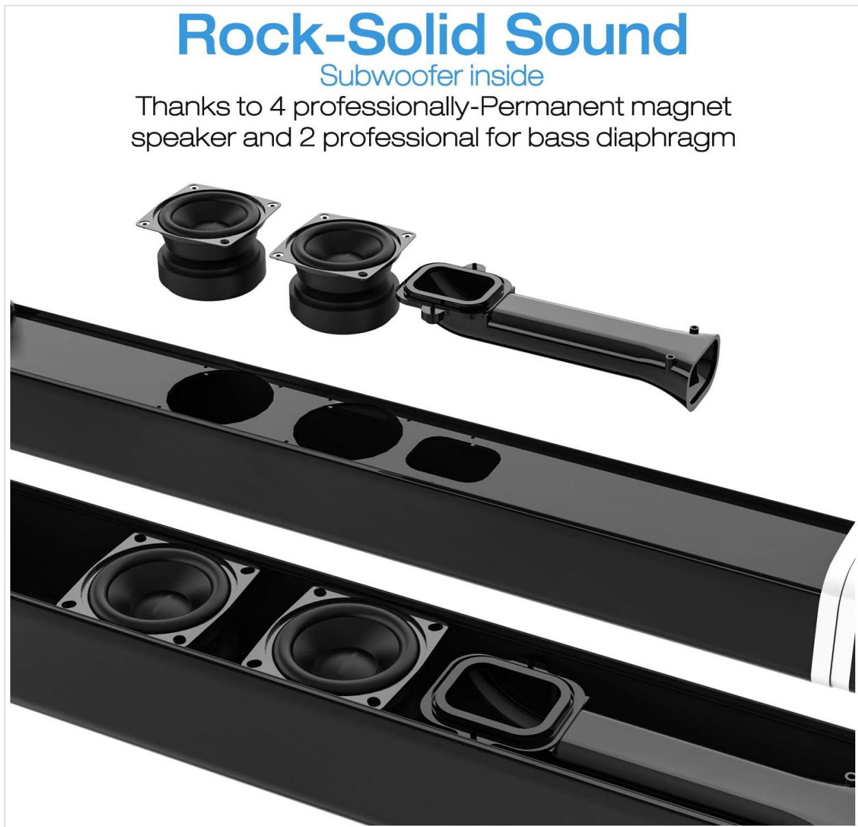
Image 3.1: Internal components of the soundbar, highlighting the speakers and bass diaphragms.