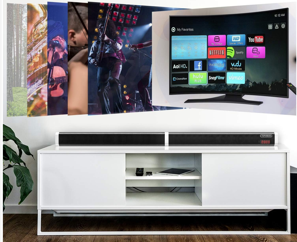
Image 3.2: Soundbar in use with a TV, demonstrating DSP sound modes.