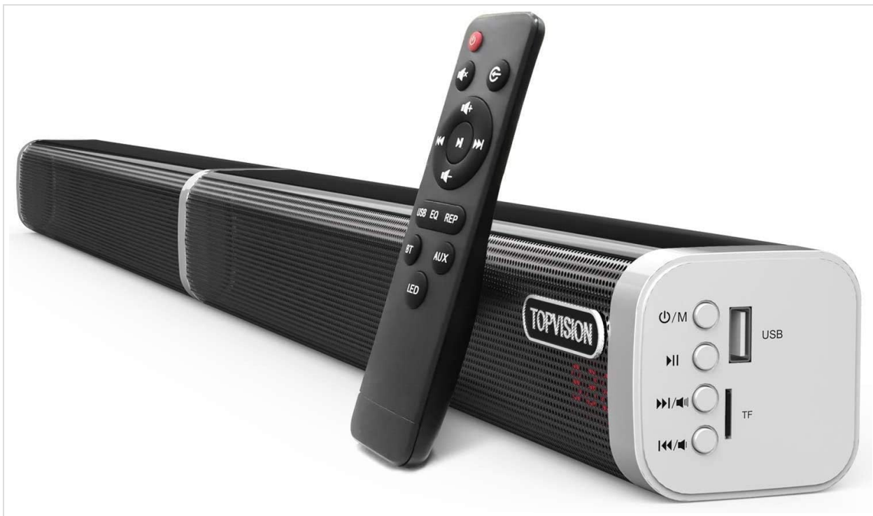
Image 1.1: TOPVISION SD01 Detachable Stereo Soundbar with included remote control.

This manual provides detailed instructions for the setup, operation, and maintenance of your TOPVISION SD01 Detachable Stereo Soundbar. Please read this manual thoroughly before using the product to ensure proper functionality and to maximize your audio experience. Keep this manual for future reference.