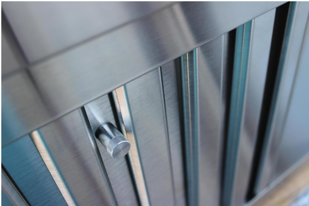
Image 3: Close-up view of a baffle filter, showing the knob for easy removal.