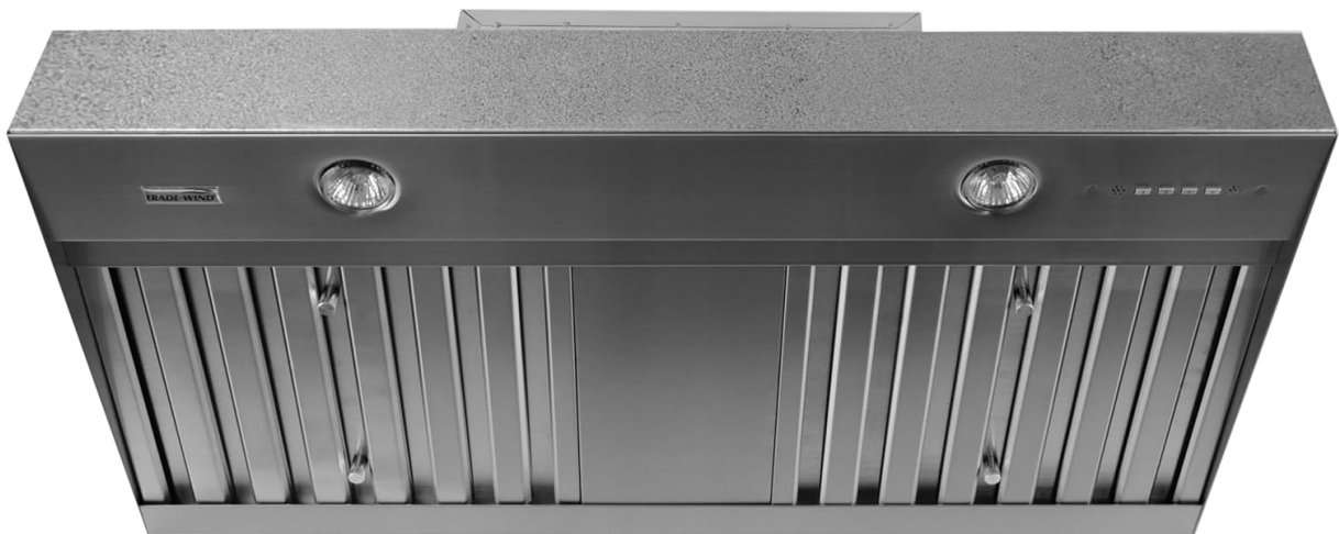
Image 1: Front view of the Trade-Wind VSL4303RC Range Hood Insert, showcasing its stainless steel finish, LED lights, and baffle filters.

This manual provides essential instructions for the installation, operation, and maintenance of your Trade-Wind VSL4303RC VSL400 Series 30-Inch Range Hood Insert. Please read all instructions carefully before installation and use to ensure proper function and safety.