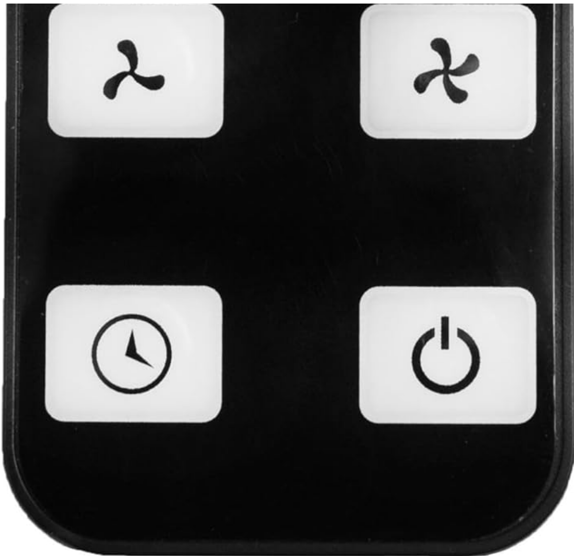
Image 2: The remote control for the Trade-Wind VSL4303RC, showing buttons for fan speed, light, and power.