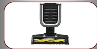
Image 1: Visual guide for filter compatibility, highlighting the correct dimensions for the NV350 series filters.

Shark ZU60, ZU62, ZU62C, NV150, NV151, NV255 Replaces Part # 1238FT60 & 1239FT60