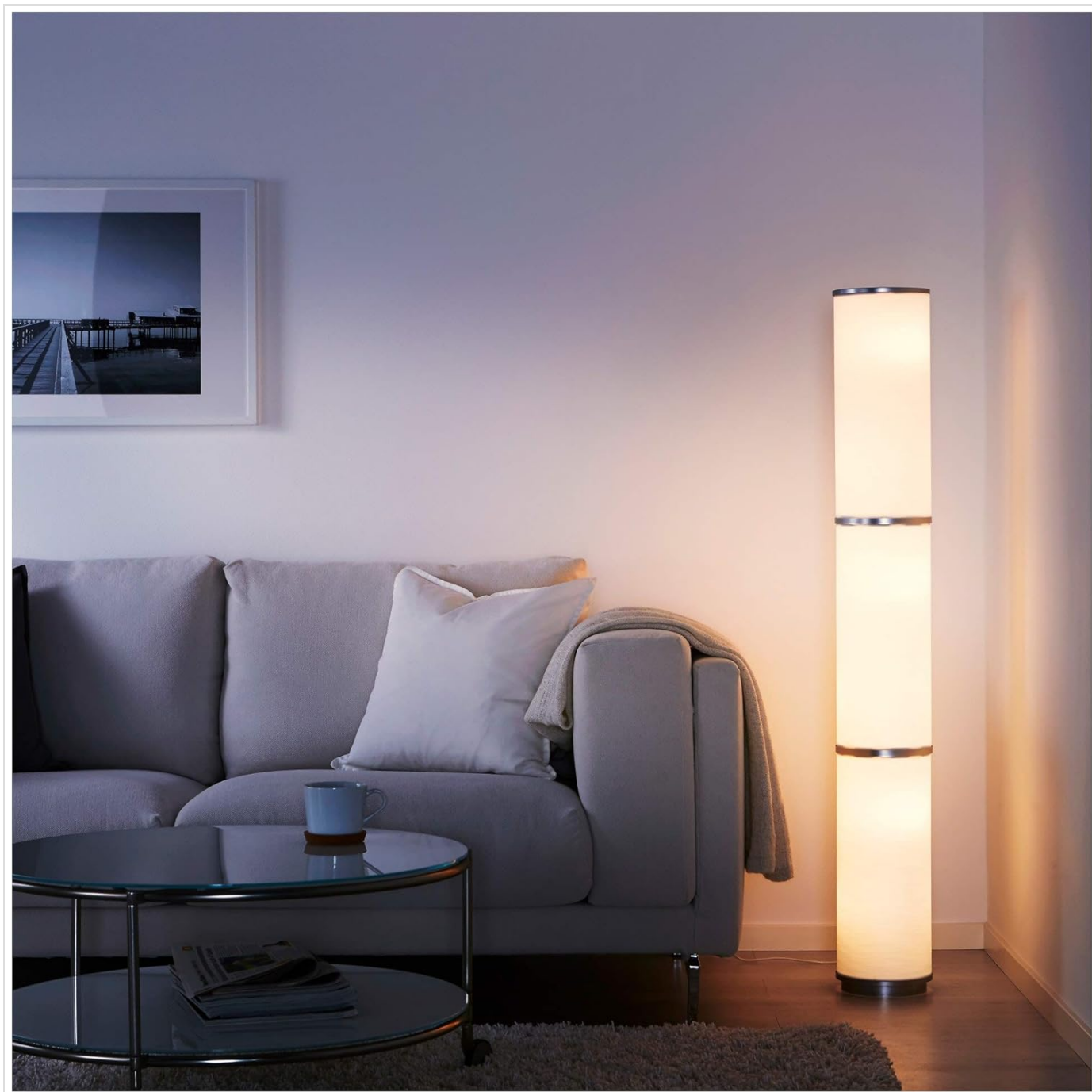
Image: The IKEA Vidja Standing Floor Lamp, fully assembled and illuminated, positioned next to a sofa in a living room, demonstrating its ambient light output.