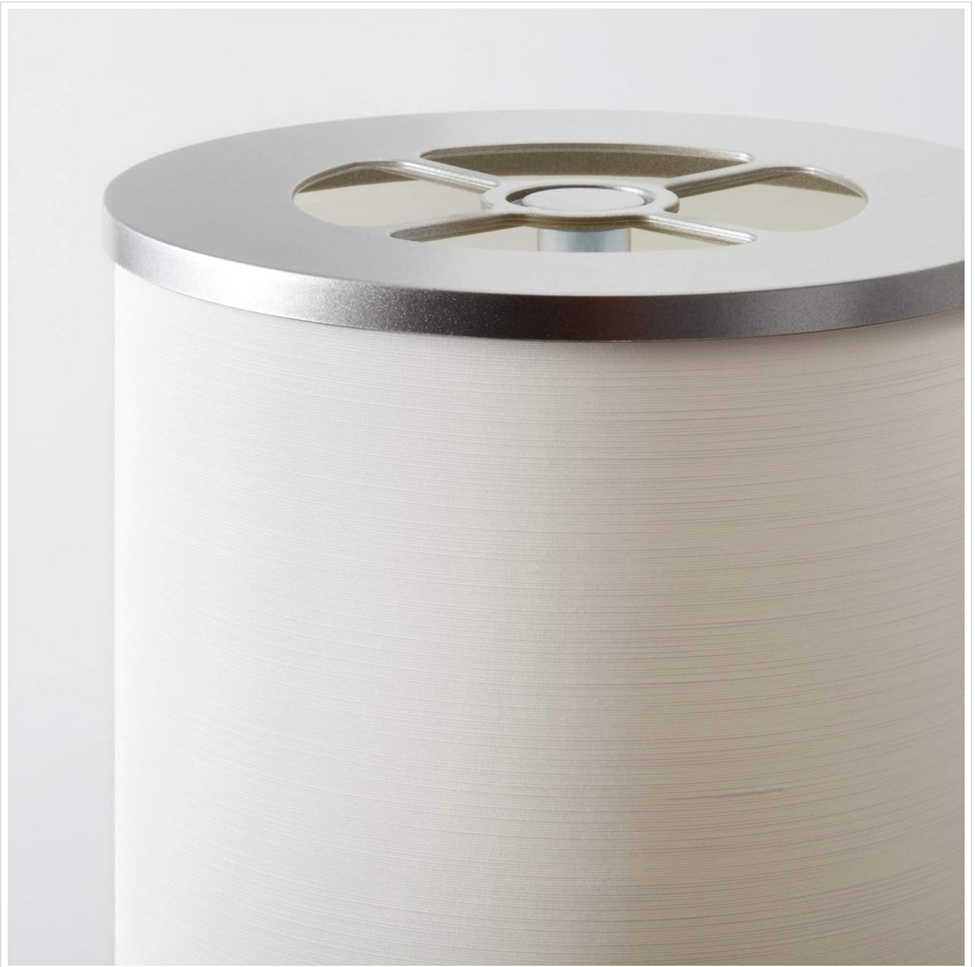
Image: A close-up view of the top section of the IKEA Vidja Standing Floor Lamp, highlighting the texture of the white fabric shade and the silver-colored metal ring.