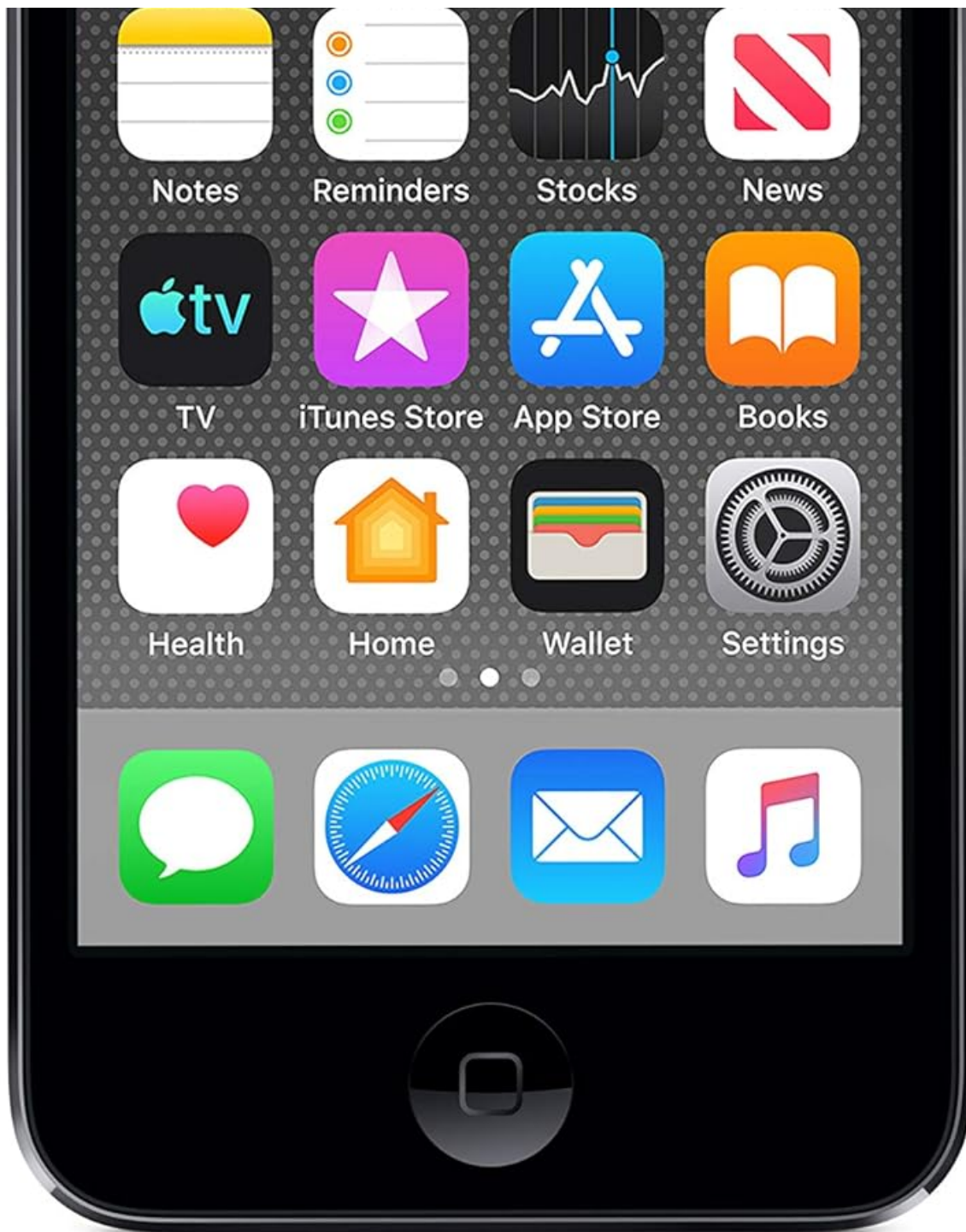
Figure 1.1: Front view of the iPod Touch, showcasing its Retina display and user interface.