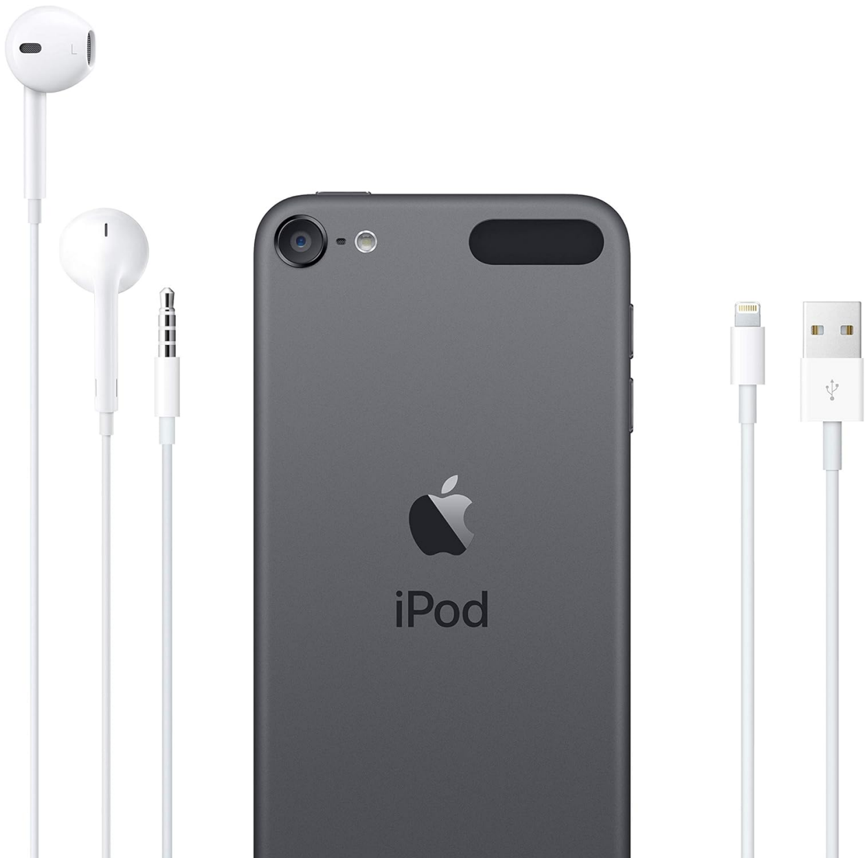
Figure 2.1: All components included with the iPod Touch: the device, EarPods, and charging cable.