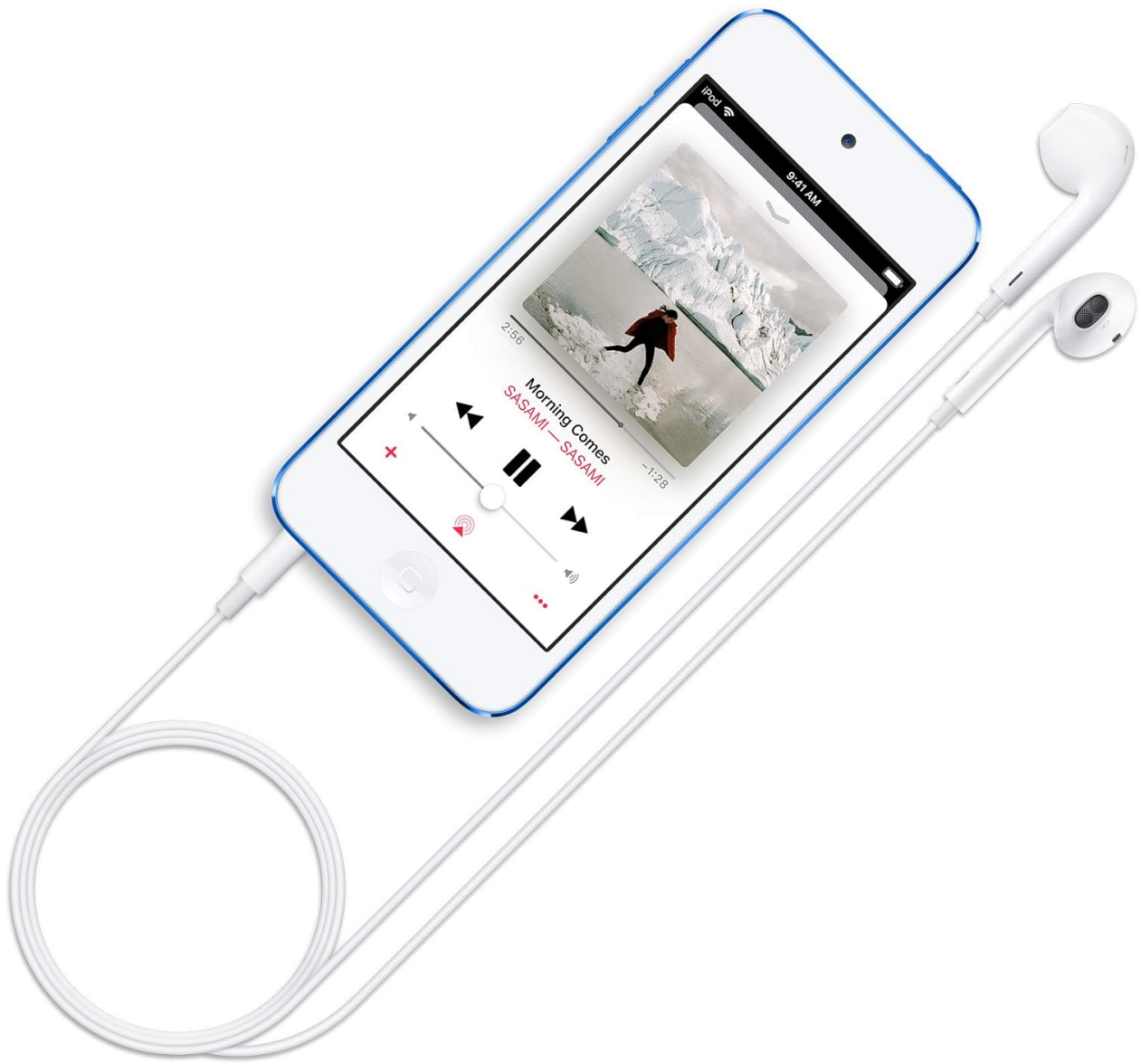
Figure 4.3: iPod Touch with EarPods connected, demonstrating audio connectivity.