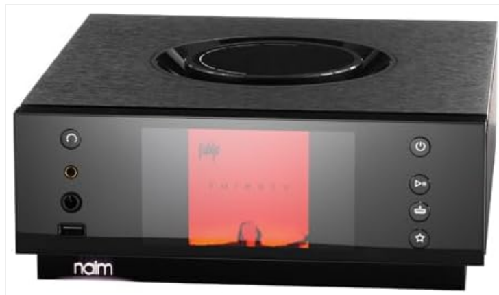
Figure 1: Front view of the Naim Uniti Atom Headphone Edition, displaying its screen and controls.

This manual provides comprehensive instructions for the Naim Uniti Atom Headphone Edition music streaming player. It covers setup, operation, maintenance, and troubleshooting to ensure optimal performance and user experience. Please read this manual thoroughly before using your device.