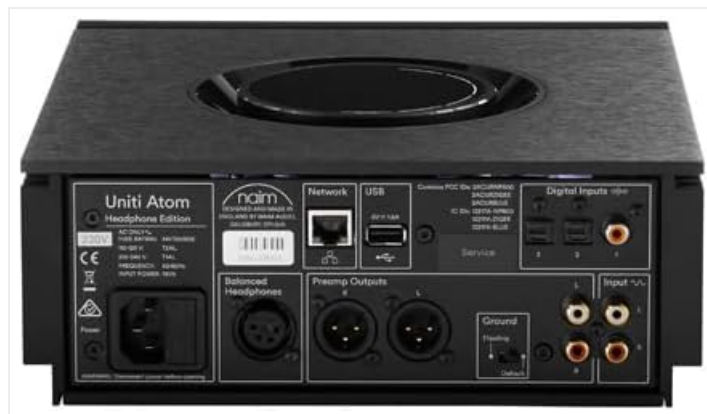
Figure 2: Rear panel showing network, USB, digital inputs, balanced headphone, and preamp outputs.

Connect your headphones to the desired output. Ensure the headphone impedance is compatible with the Uniti Atom's specifications for optimal performance.