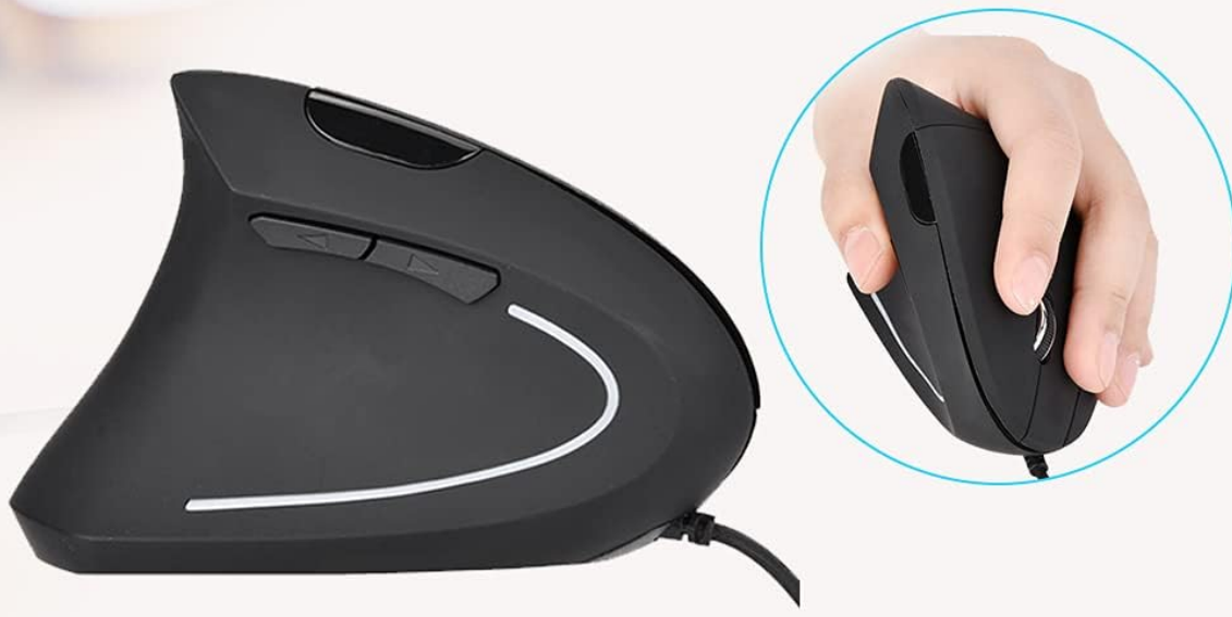
Image 1: The Wendry Ergonomic Vertical USB Wired Mouse, showcasing its design features including a skin-friendly surface, ergonomic shape, 3 adjustable DPI settings, and dedicated forward/back keys.