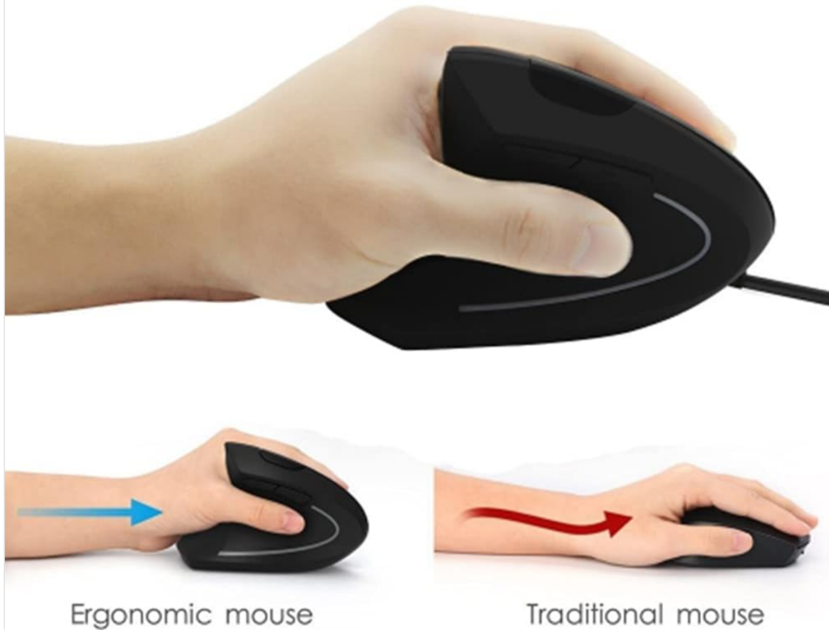
Image 2: A visual comparison demonstrating the ergonomic advantage of the vertical mouse, showing how it supports the palm and reduces wrist strain compared to a traditional horizontal mouse.

Supports palm and eliminates wrist strain