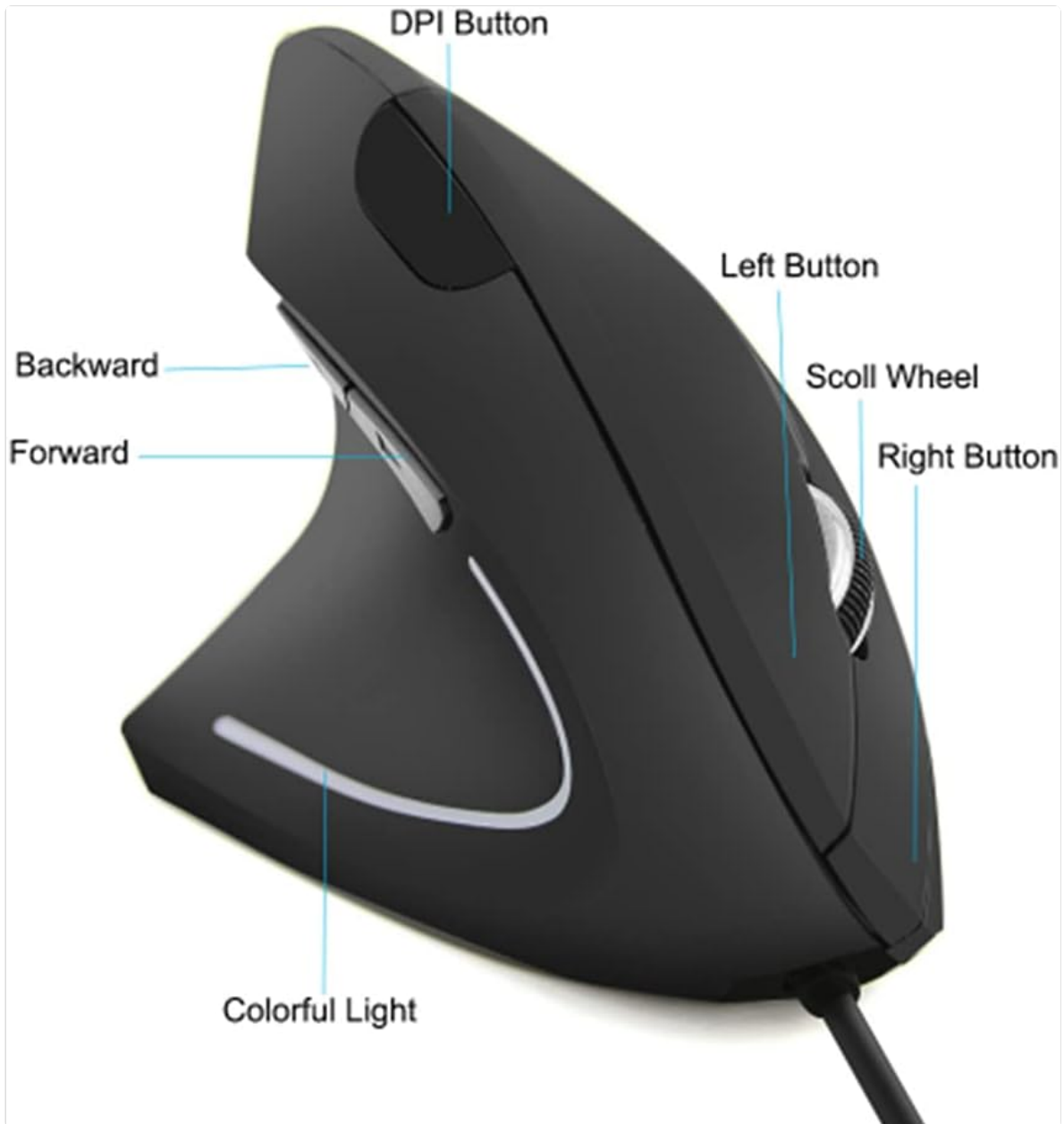
Image 4: An illustration detailing the location and labels of the six programmable buttons on the vertical mouse, including the DPI button, left/right click, scroll wheel, and forward/backward buttons.