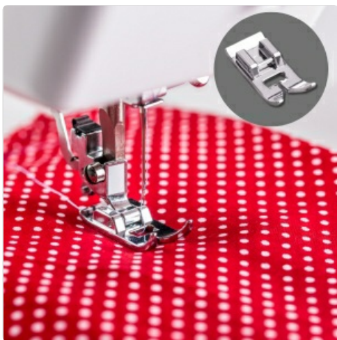
Figure 3: The presser foot in action, guiding fabric for precise stitching.