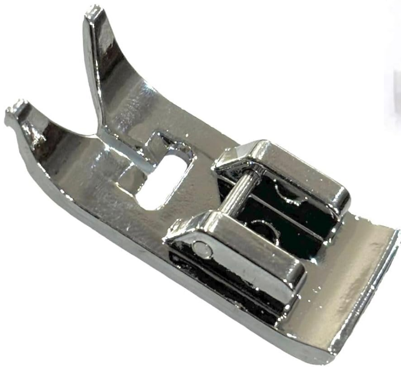
Figure 2: The Zenith Zig Zag Standard Presser Foot is compatible with all domestic automatic sewing machines.