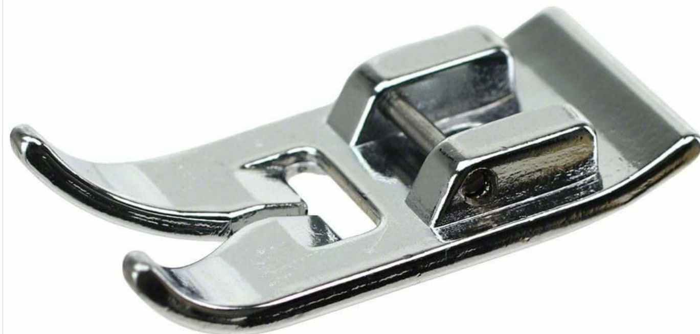
Figure 1: Zenith Zig Zag Standard Presser Foot, a versatile accessory for automatic sewing machines.