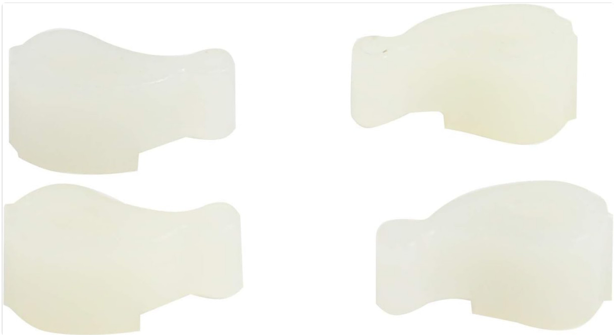
Figure 2: A close-up view of four individual 80040 Washer Agitator Dogs. These small, durable plastic components are designed for easy replacement within the washing machine agitator.