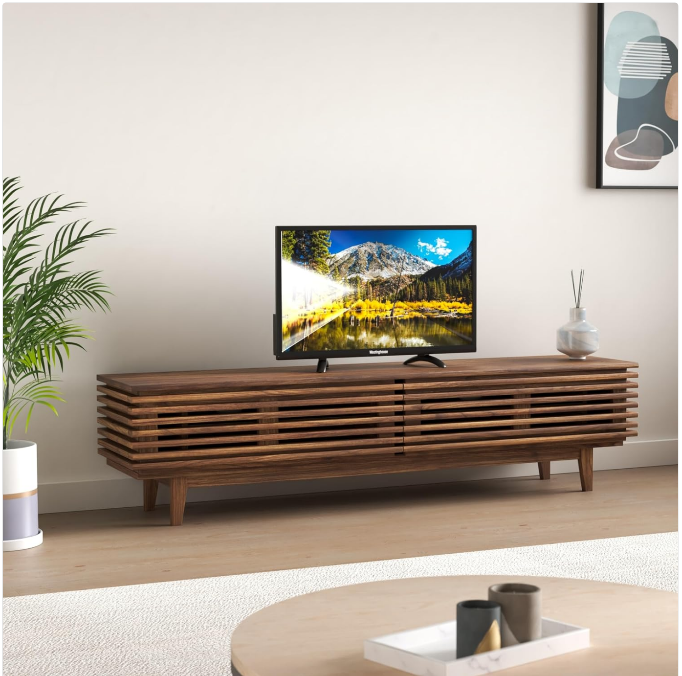
Image: Front view of the Westinghouse 32-inch LED HD DVD Combo TV, showcasing its design and display.