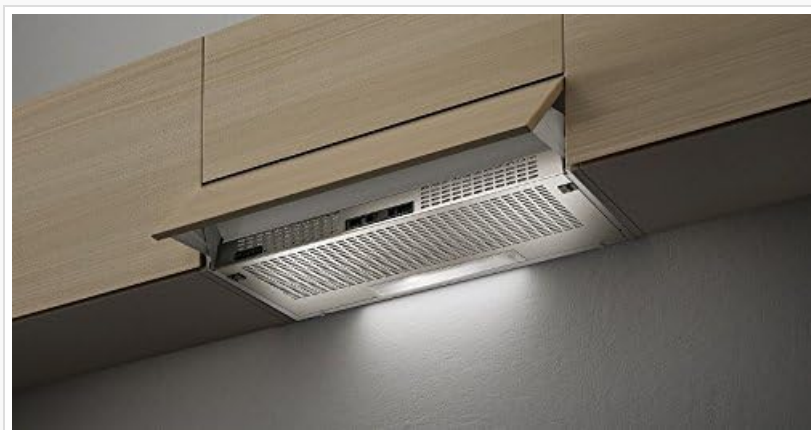
Image 2: The Faber 152 SRM LG A90 built-in hood shown installed under a kitchen cabinet. The image highlights its discreet design

The Faber 152 SRM LG A90 hood features electromechanical controls for easy operation of its functions.