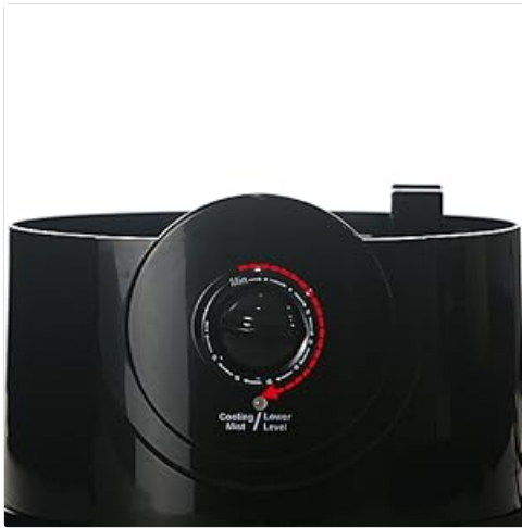
Image: A close-up view of the humidifier's rotary dial with 'Min' and 'Max' indicators, used to adjust the fog output.