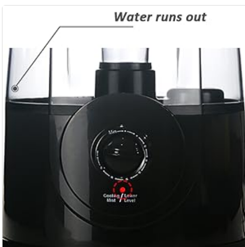
Image: A close-up of the humidifier base showing a red indicator light, signifying that the water tank is empty.

Solution: This indicates the dry-run protection has activated because the water tank is empty. Refill the water tank.