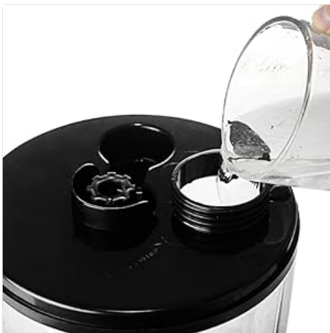
Image: A hand pouring water from a glass into the top opening of the humidifier, demonstrating the top-fill feature.