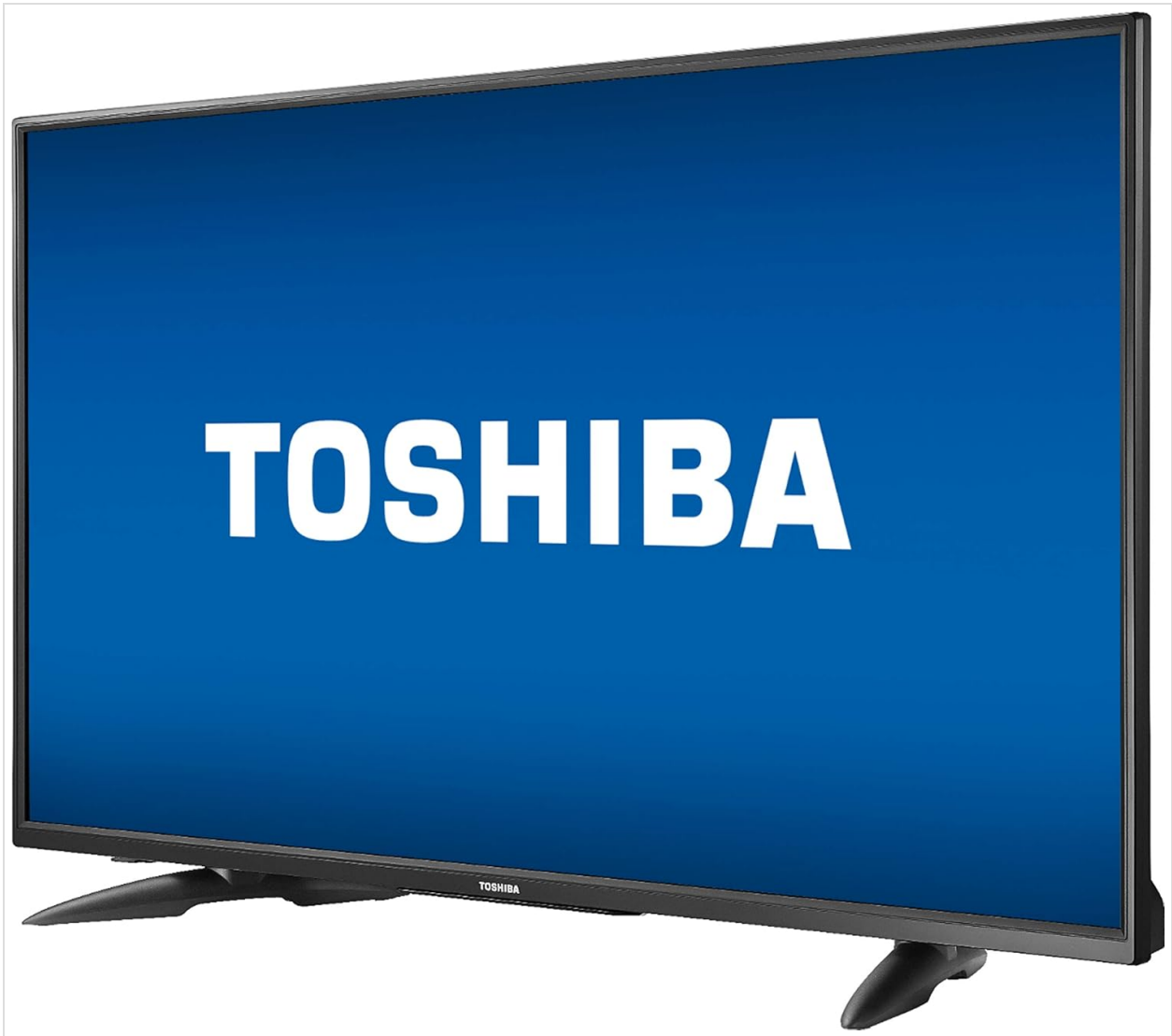
Image: Angled view of the TOSHIBA 43LF711U20 TV, showing the attached stand.