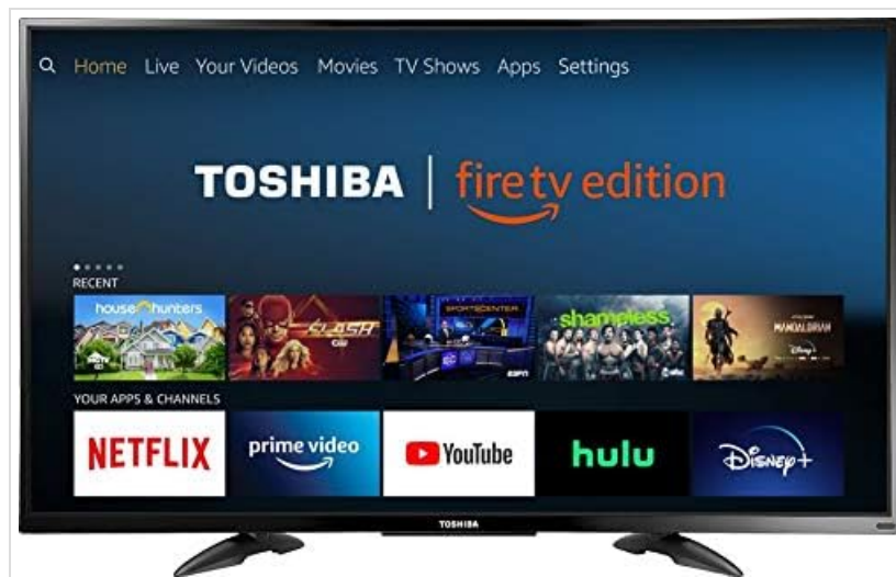
Image: Front view of the TOSHIBA 43LF711U20 43-inch Smart 4K UHD with Dolby Vision TV, displaying the Fire TV interface with various streaming app icons.

Welcome to the user manual for your new TOSHIBA 43LF711U20 43-inch Smart 4K UHD with Dolby Vision TV. This television features the Fire TV experience built-in, offering a seamless integration of live over-the-air TV and your favorite streaming content on the home screen. With true-to-life 4K Ultra HD picture quality and access to a vast library of movies and TV shows, Toshiba delivers a superior TV experience. The included Voice Remote with Alexa allows for easy navigation, app launching, title searching, music playback, input switching, and smart home device control using voice commands. This TV is designed for smart and simple operation; just plug it in, connect to Wi-Fi, and enjoy. Automatic over-the-air software updates ensure your TV continuously gets smarter with new Alexa skills and features.