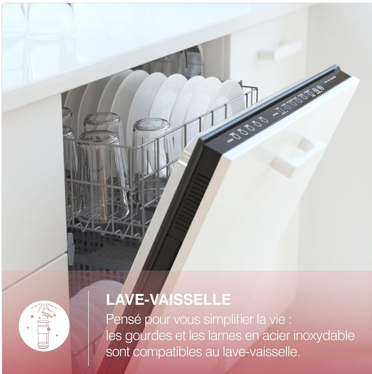
Image Description: This image shows the interior of an open dishwasher, with several plates, glasses, and two clear blending bottles and a blade assembly from the H.Koenig SMOO9 Mini Blender placed inside. This visually confirms that the bottles and blade assembly are safe for dishwasher cleaning, simplifying maintenance.