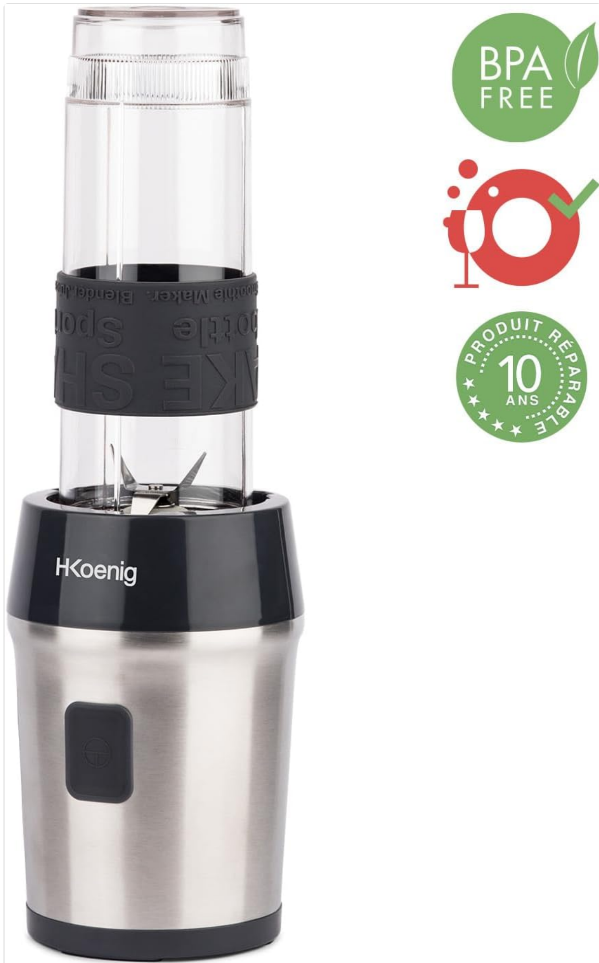
Image Description: This image features the H.Koenig SMOO9 Mini Blender, highlighting its key features with graphical icons. On the right side, there are two circular logos: one indicating "BPA FREE" with a leaf icon, and another stating "PRODUIT RÉPARABLE 10 ANS" (Product Repairable 10 Years) with a star icon, emphasizing the product's durability