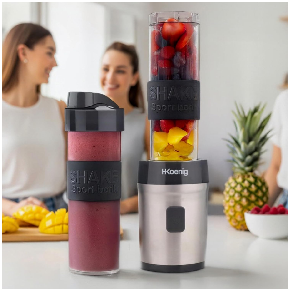
Image Description: This image shows the H.Koenig SMOO9 Mini Blender actively blending fruits in one of its clear bottles, which is attached to the stainless steel motor unit. Next to it, a second portable bottle contains a finished red smoothie, ready for consumption. The scene suggests ease of use and the convenience of preparing and transporting beverages.

6. Unplug: Always unplug the appliance from the power outlet after use.