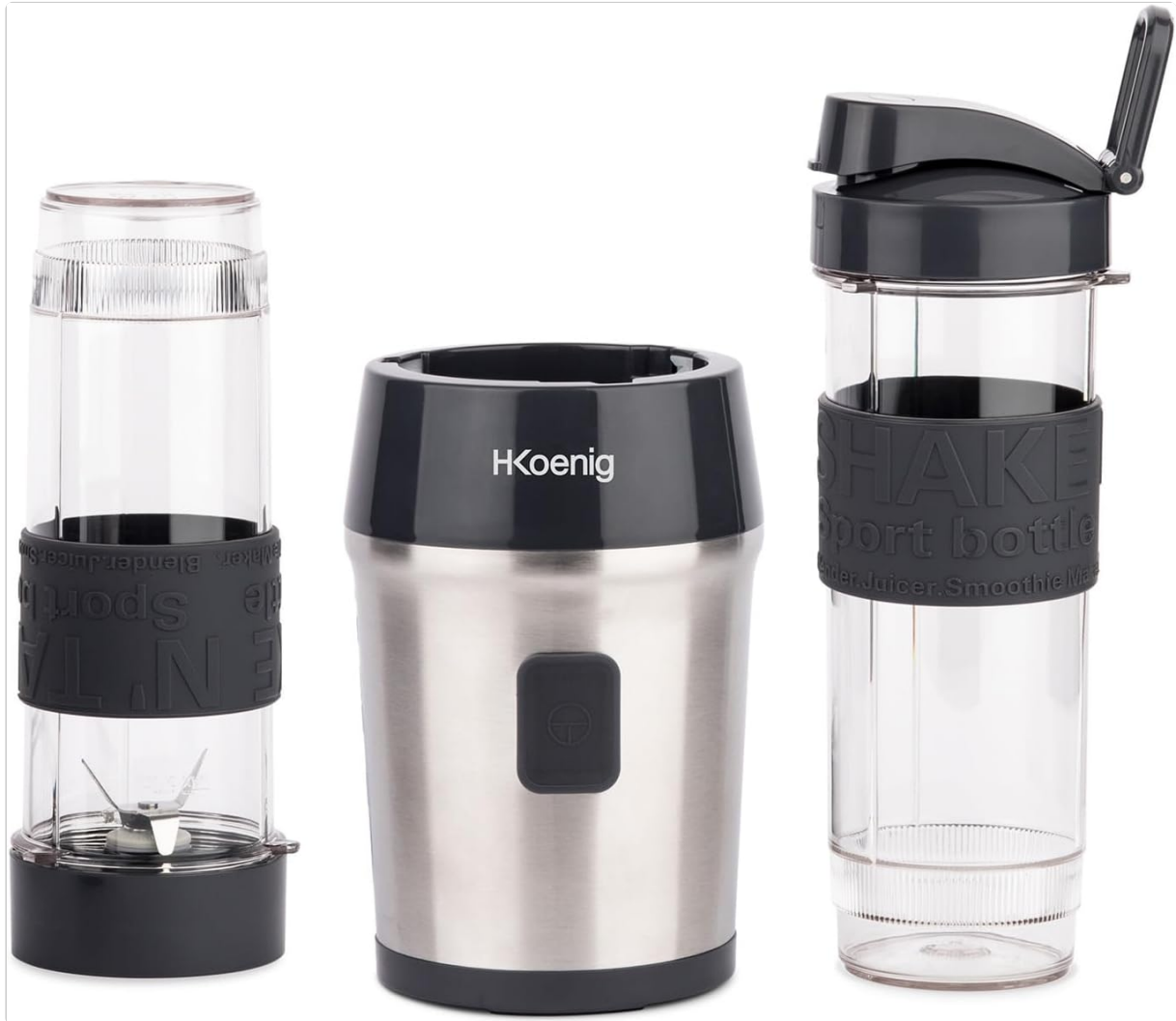
Image Description: This image displays the individual components of the H.Koenig SMOO9 Mini Blender. From left to right, it shows a clear blending bottle with the blade assembly attached, the stainless steel motor unit with the H.Koenig logo and power button, and a second clear blending bottle with a grey travel lid attached. This illustrates the complete set of parts included with the blender.