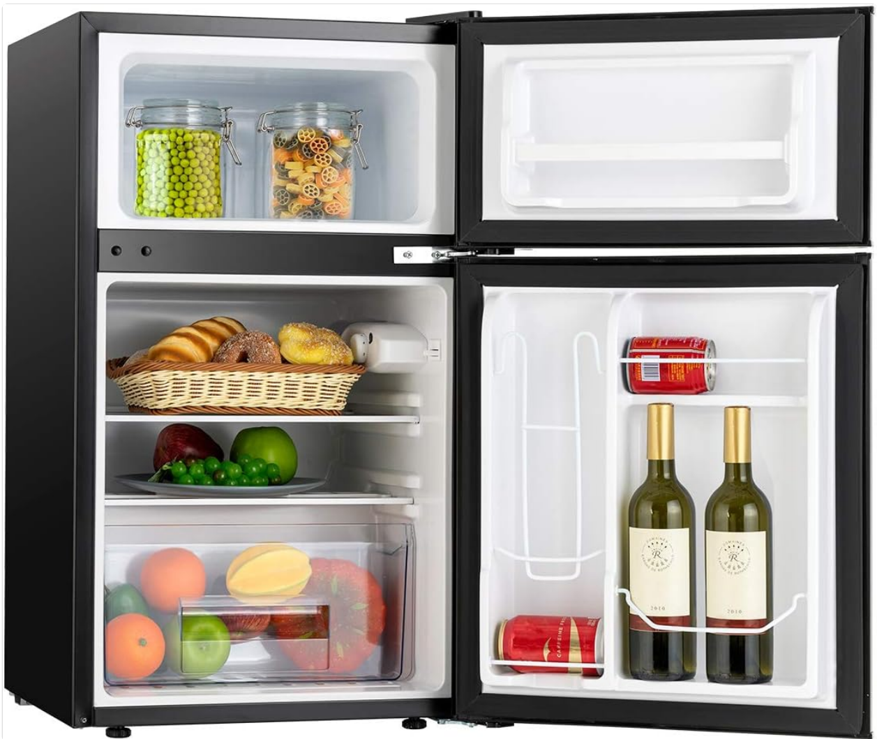
Interior view of the KUPPET Compact Refrigerator, demonstrating its storage capacity with various food items and beverages.