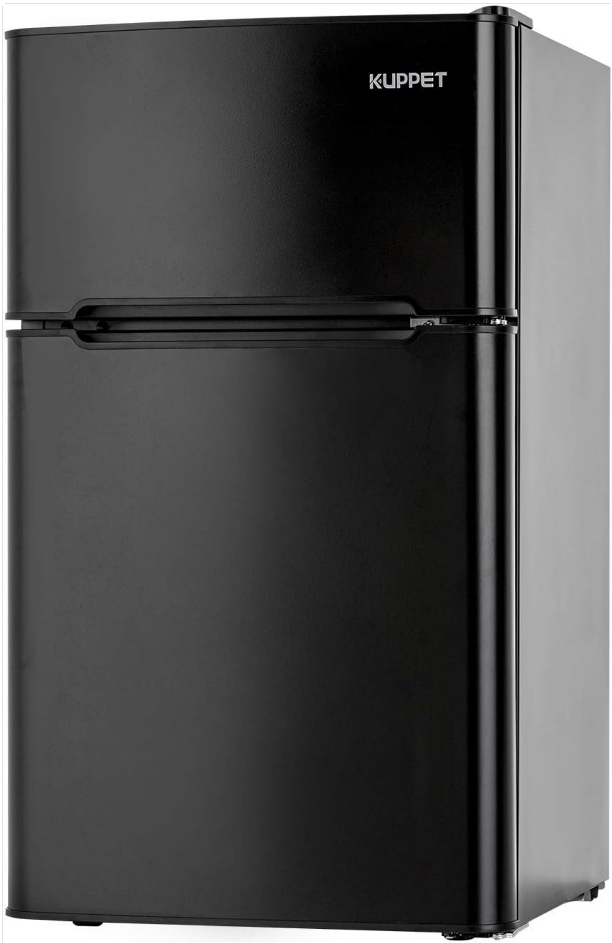
Front view of the KUPPET Compact Refrigerator, showcasing its sleek black finish and double-door design.