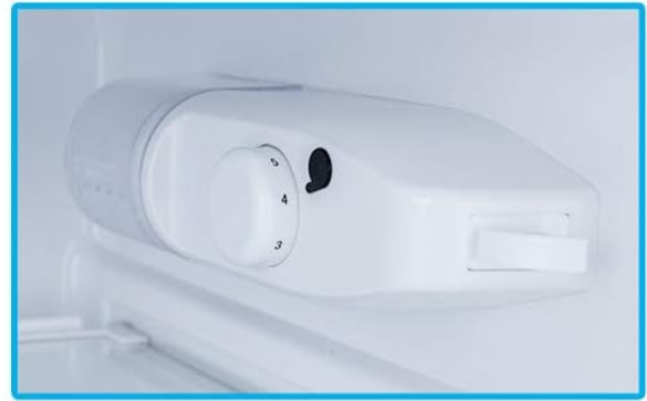
5 Level Temp Control