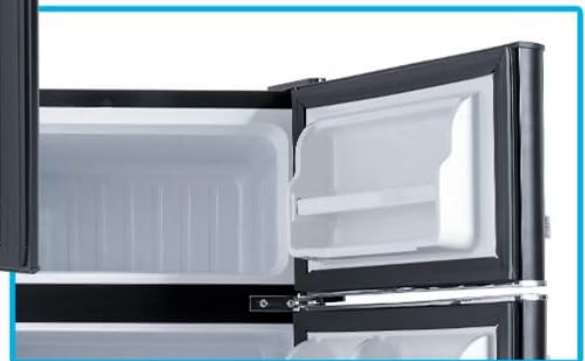
Fully Sealed Door

Close-up view of the interior, highlighting the 5-level temperature control dial, removable basket, and shelves, and the fully sealed door.