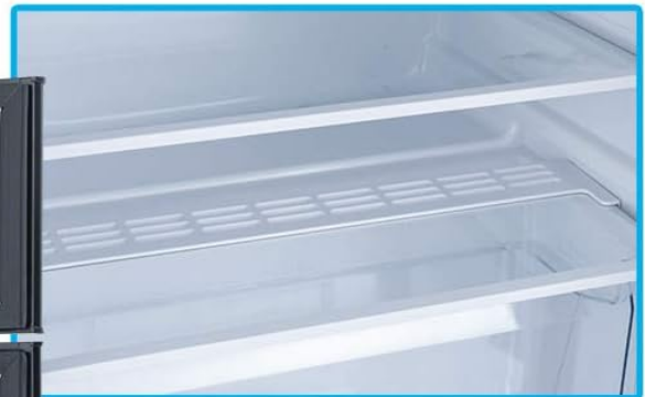
Removable Basket & Shelf