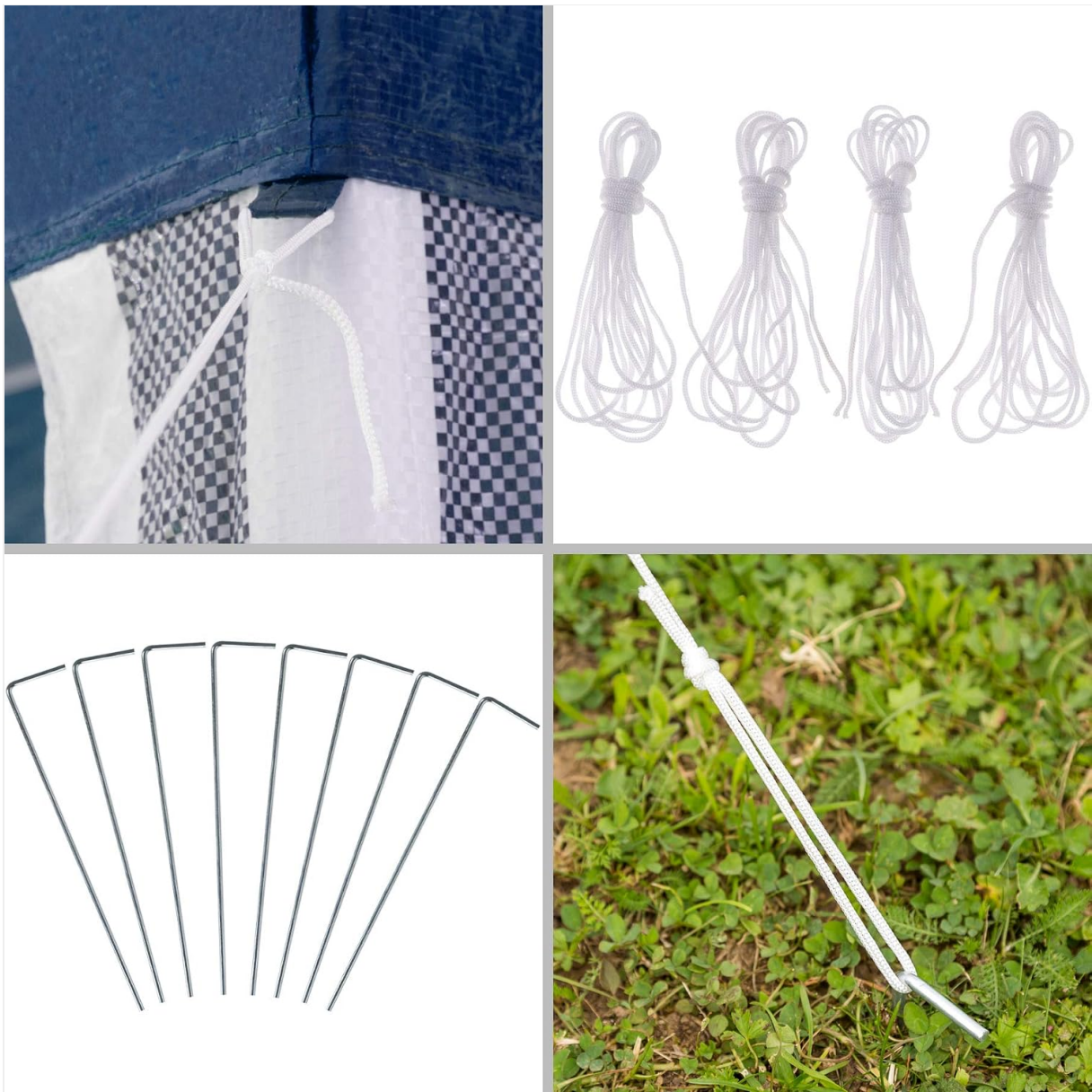
Image: White ropes for tensioning and metal ground pegs for securing the gazebo, with a close-up of a rope tied to a peg in the grass.