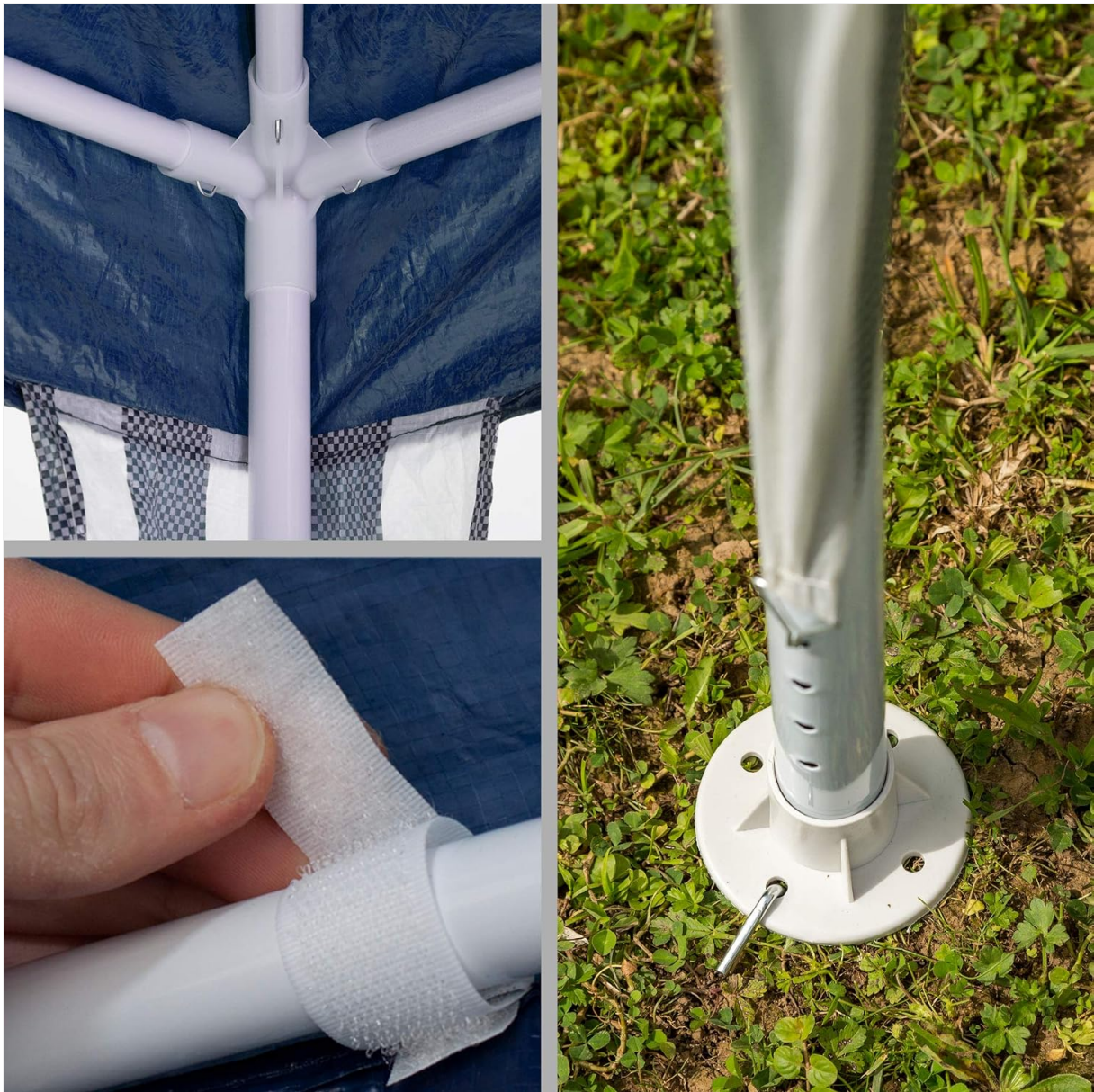
Image: Detailed view of the roof frame connector, a velcro strap securing the fabric to a pole, and a pole base with a ground anchor point.