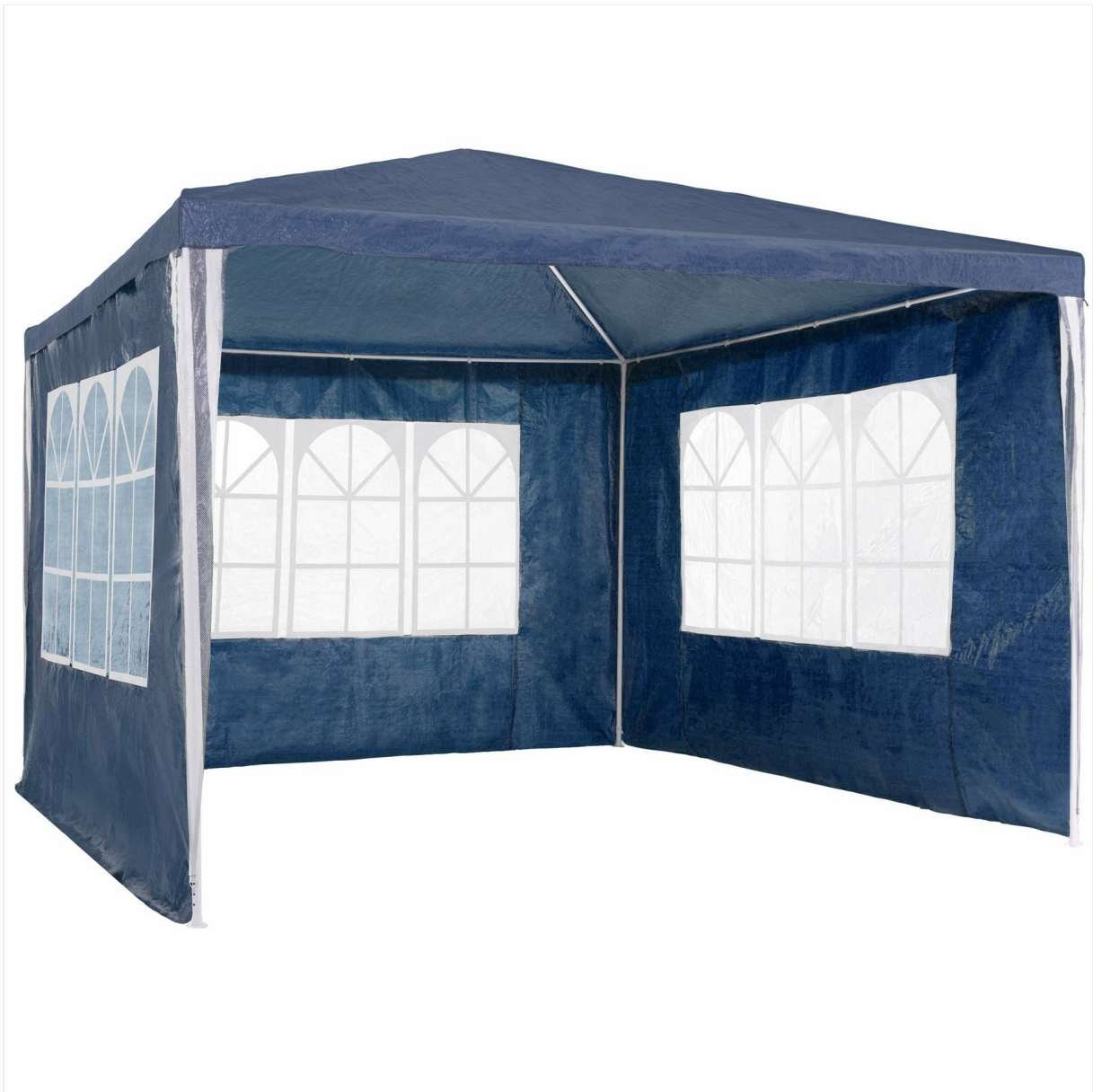
Image: Fully assembled TecTake 800105 garden gazebo tent in blue with three side panels featuring arched windows, set up on a green lawn.