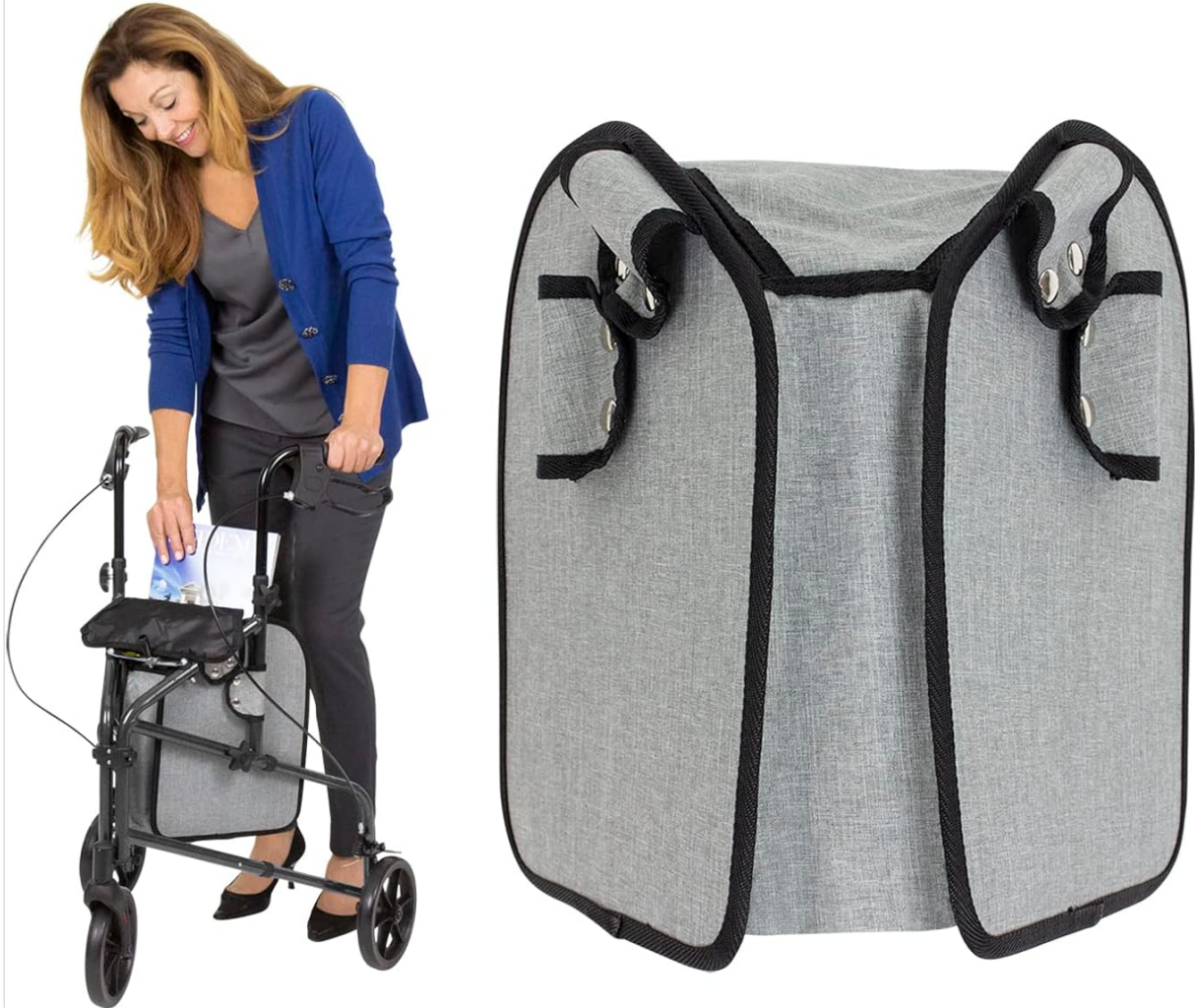
Figure 4.3: The included travel bag, showing its capacity and how it attaches to the walker for carrying essentials.

So you never have to leave your essentials behind