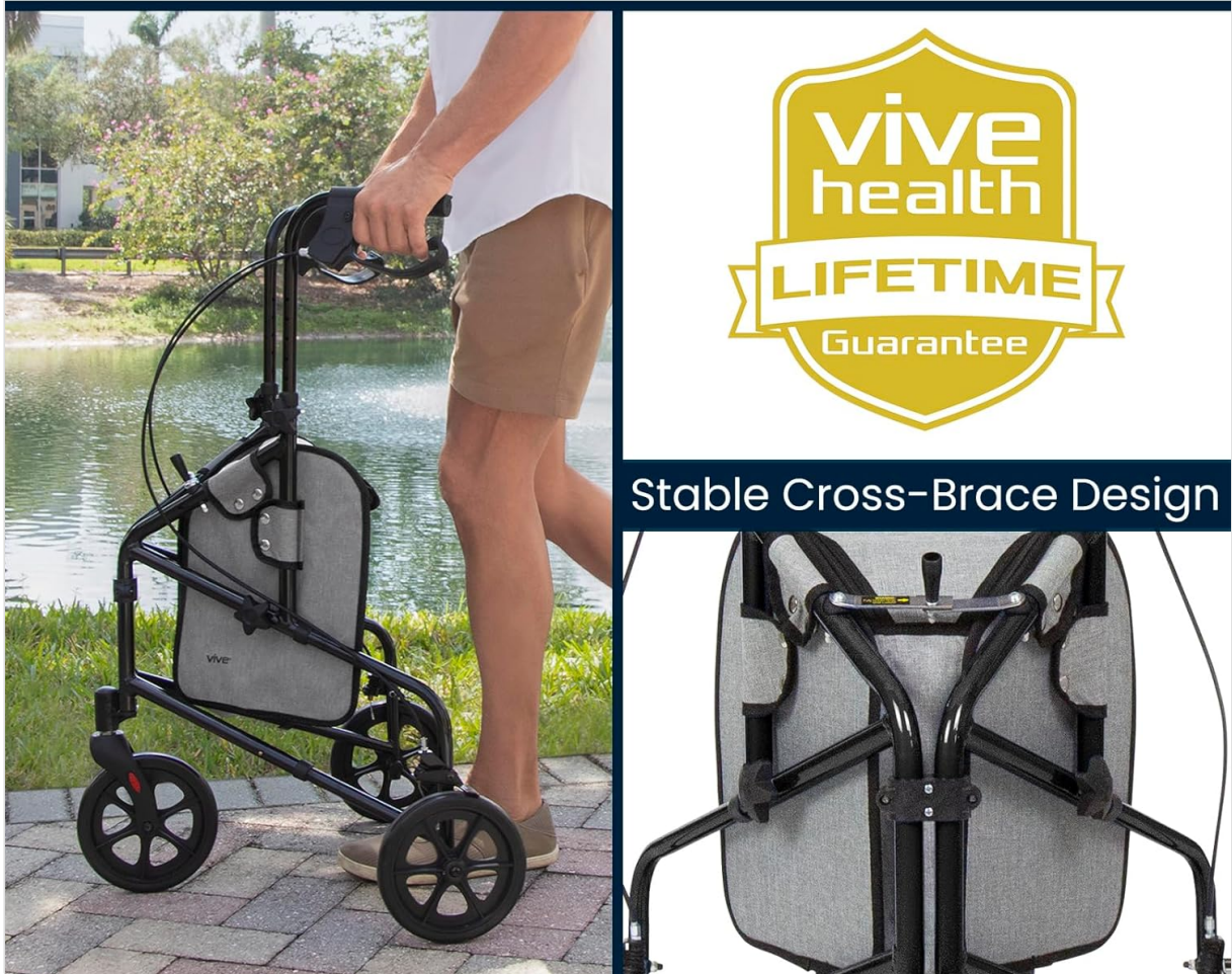
Figure 3.1: The Vive Mobility 3 Wheel Walker in use, highlighting its pre-assembled frame and adjustable handles for user comfort.