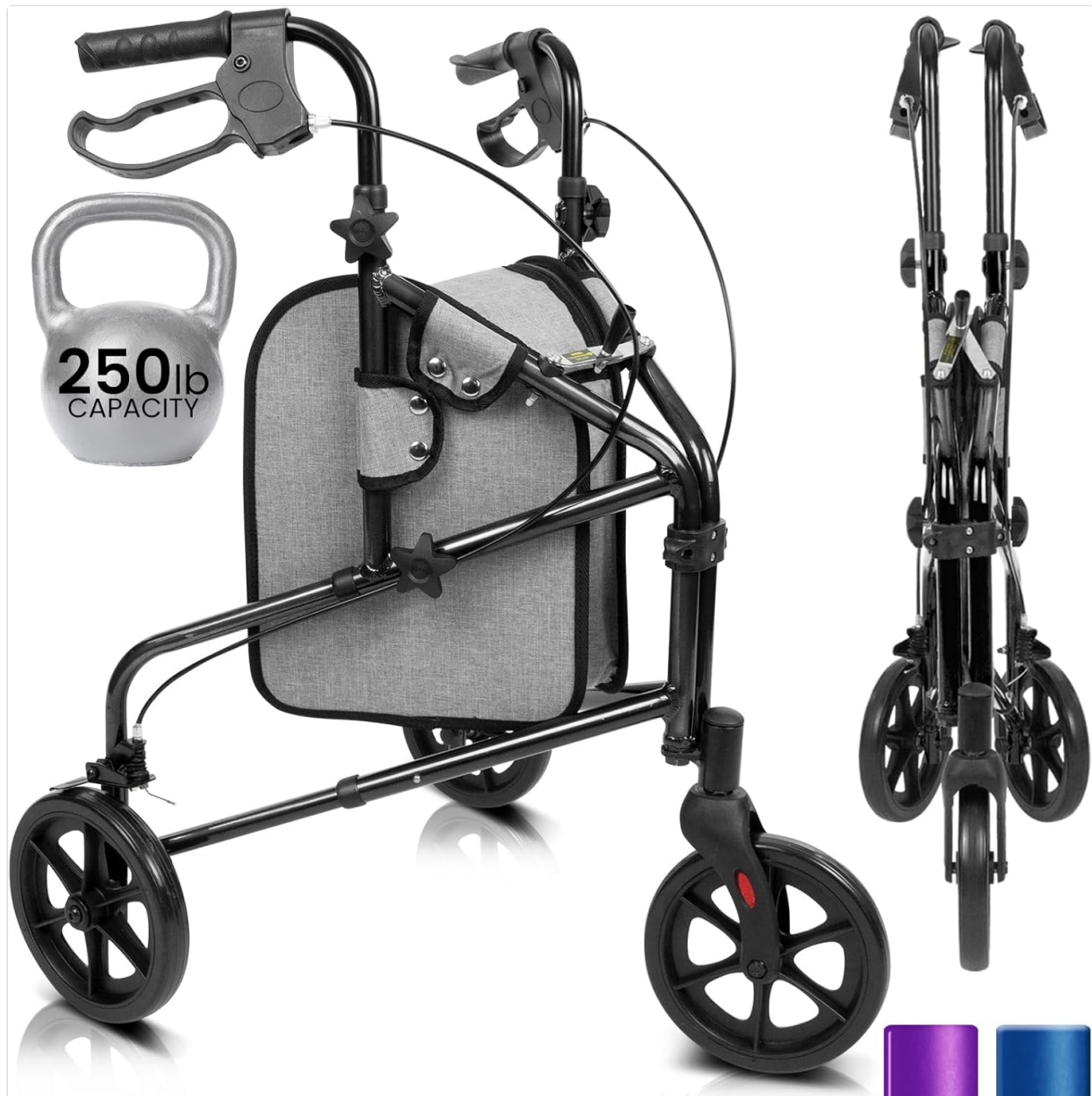
Figure 4.1: The Vive Mobility 3 Wheel Walker, illustrating its design and 250lb weight capacity.

folding mechanism instructions (typically involves pulling a strap or lever) to collapse the frame. Once folded, the walker is compact for storage or transportation.