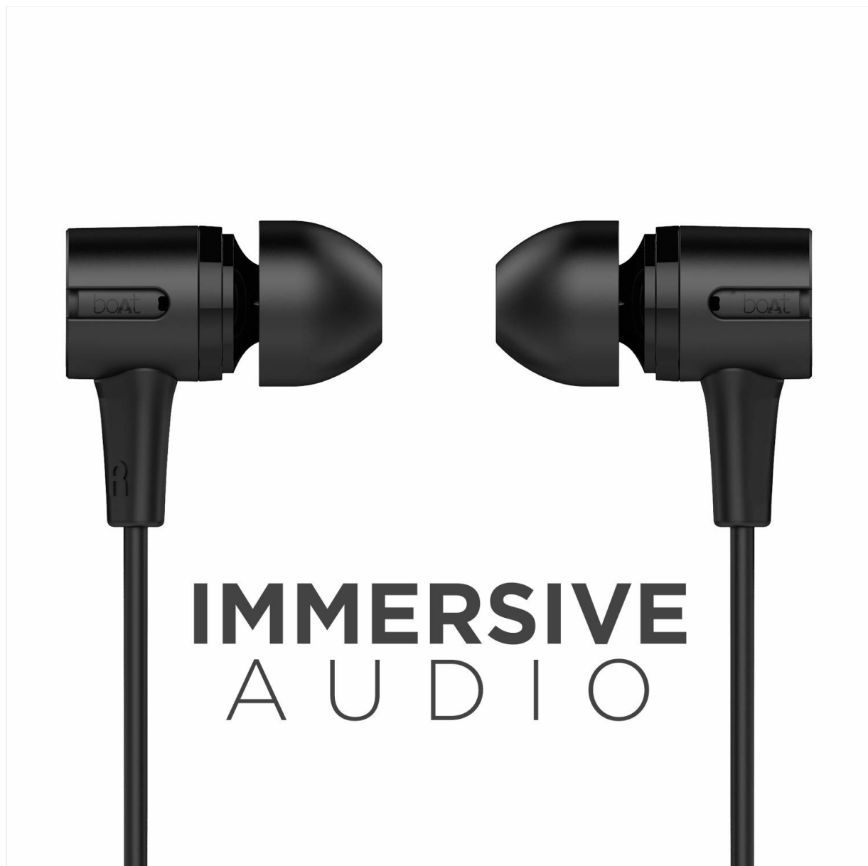
Figure 3: Immersive Audio Capability