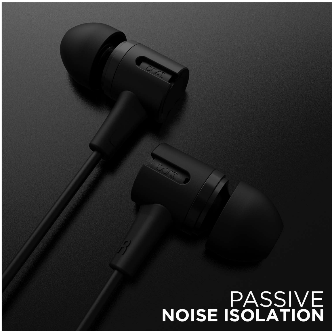
Figure 6: Passive Noise Isolation