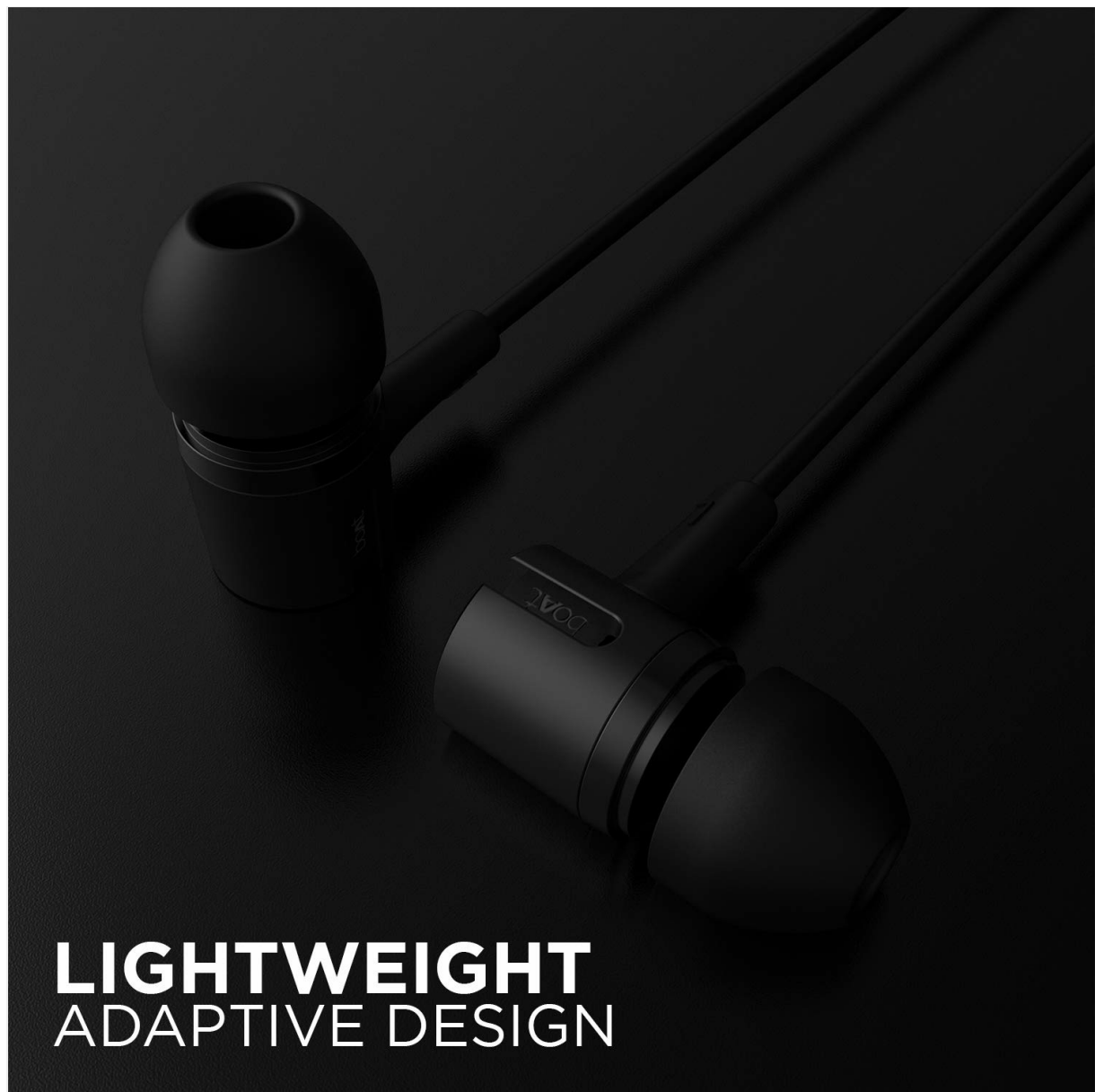
Figure 2: Lightweight Adaptive Design