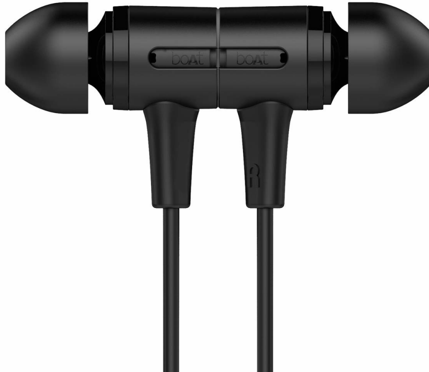
Figure 7: Magnetic Earbuds for Tangle-Free Storage