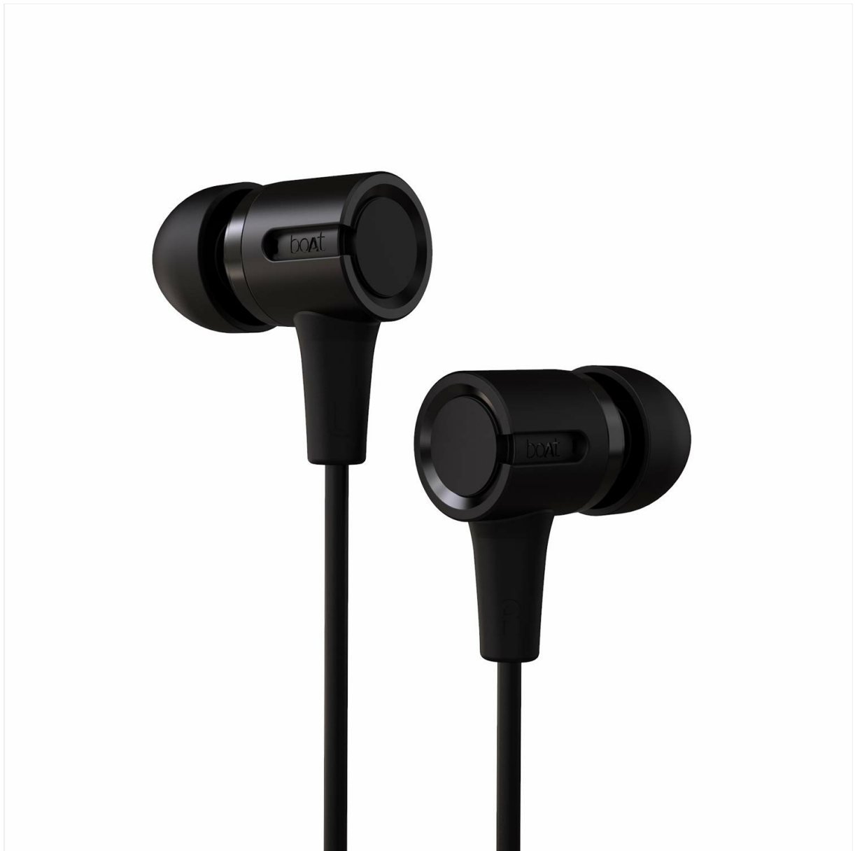
Figure 1: boAt Bassheads 102 In-Ear Wired Earphones