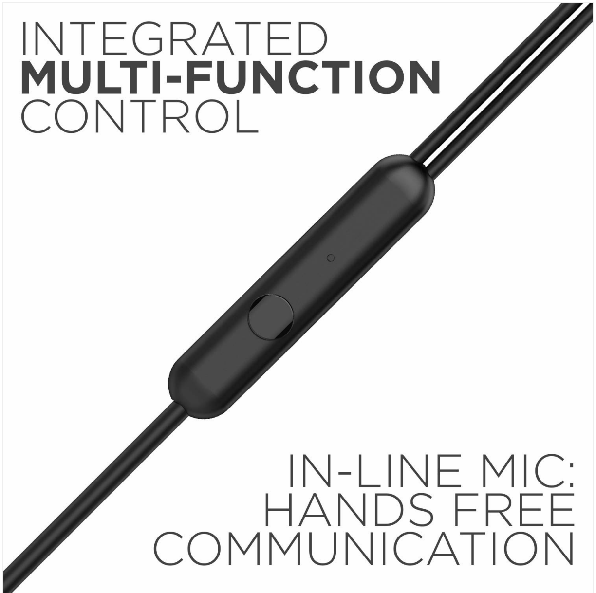
Figure 5: Integrated Multi-Function Control