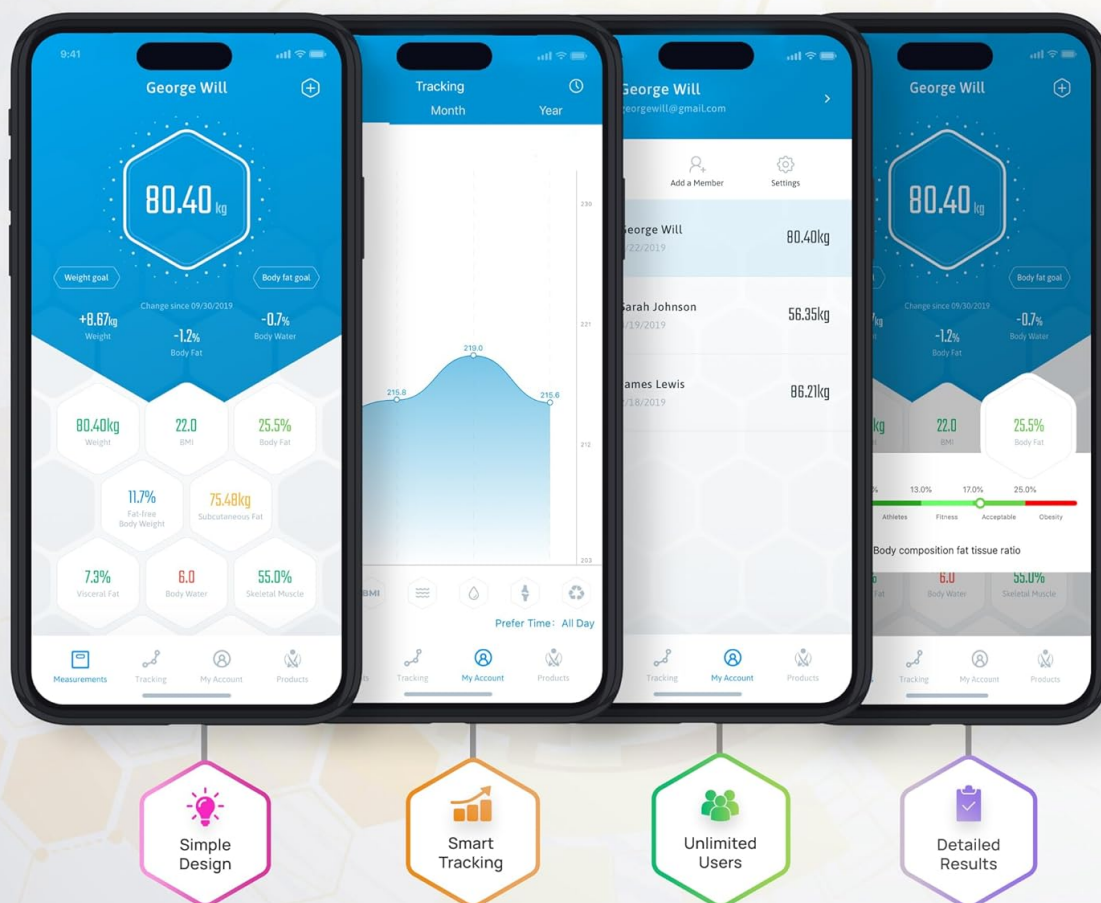
Figure 4: The INEVIFIT EROS scale offers convenient tracking by syncing with popular health apps like Google Fit, Apple Health, and Fitbit.