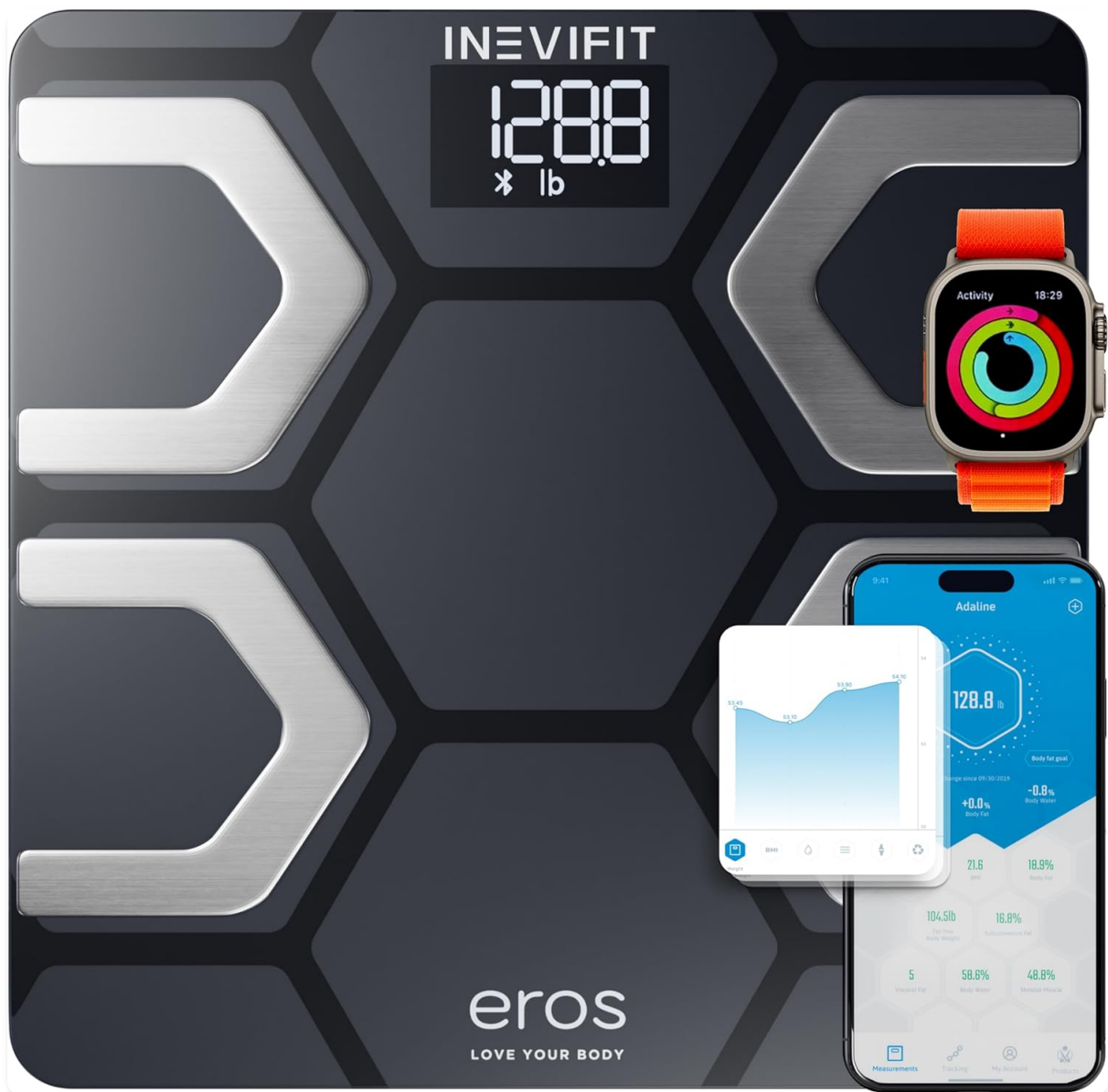
Figure 1: The INEVIFIT EROS Bluetooth Body Fat Scale, showcasing its sleek design and connectivity with a smartphone app for comprehensive data tracking.