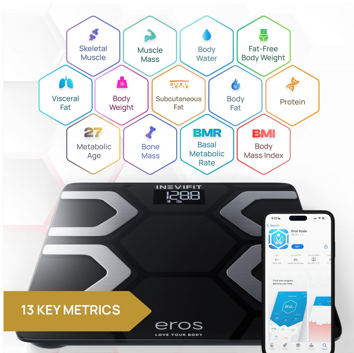
Figure 3: Visual representation of the 13 key metrics provided by the INEVIFIT EROS scale, offering a holistic view of body composition.

The Eros Scale app supports an unlimited number of user profiles, making it suitable for the whole family. It also seamlessly syncs with popular health apps and services such as Fitbit, Apple Health, and Google Fit, allowing you to track your fitness journey comprehensively.