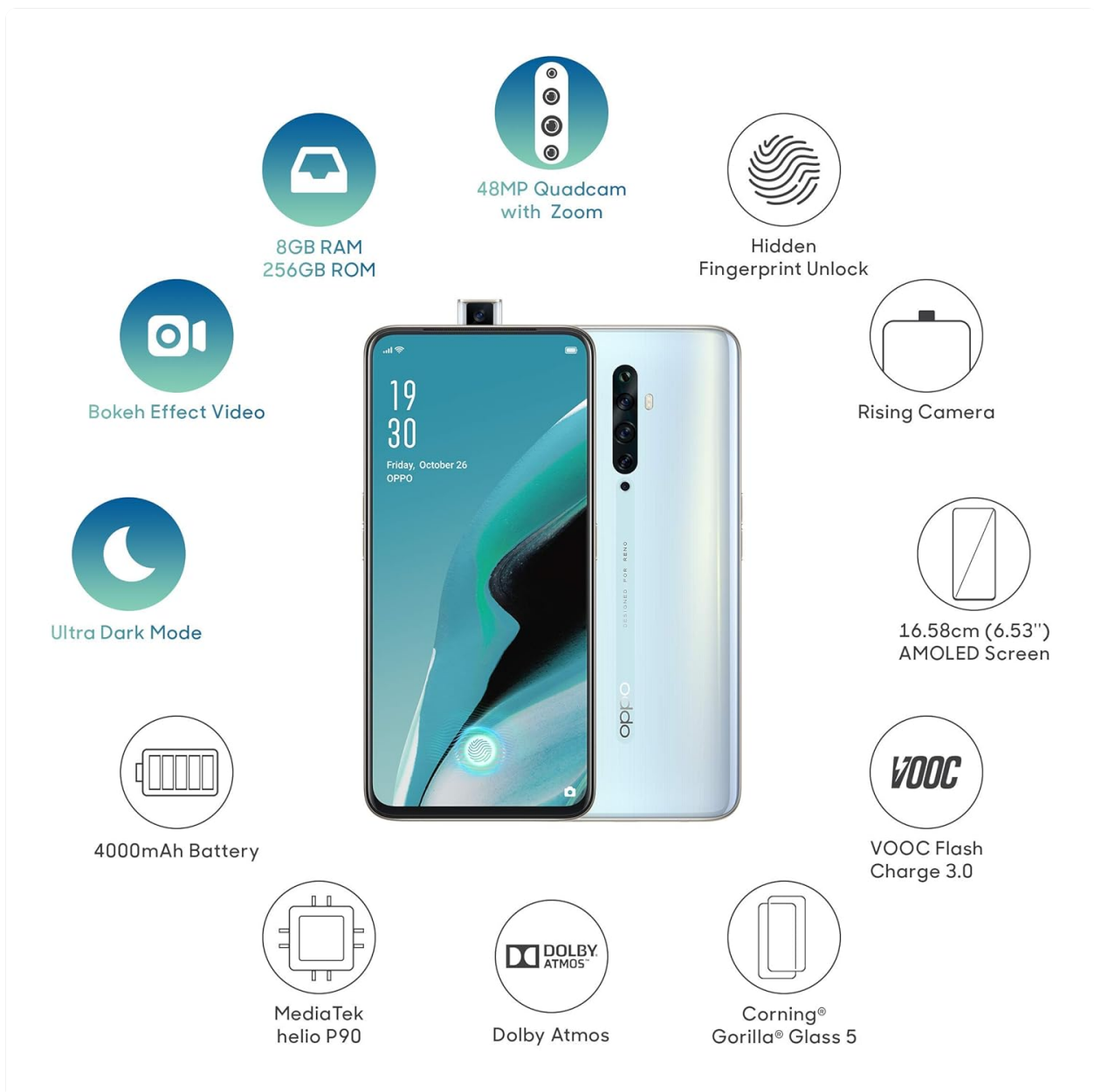
Figure 1.2: Overview of the OPPO Reno2 Z's primary features, including camera, display, battery, and processor.