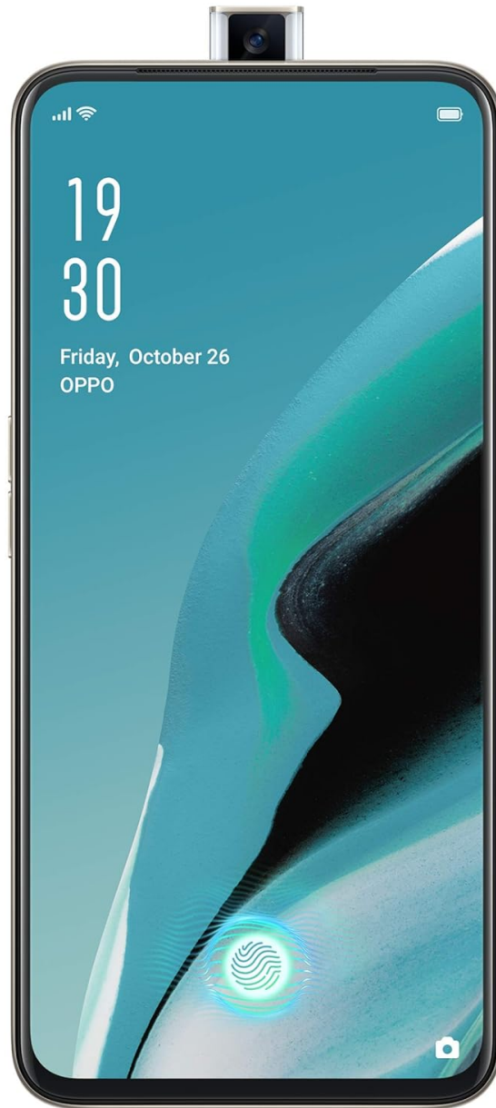
Figure 1.1: Front view of the OPPO Reno2 Z smartphone, showcasing its full-screen display and the rising front camera.