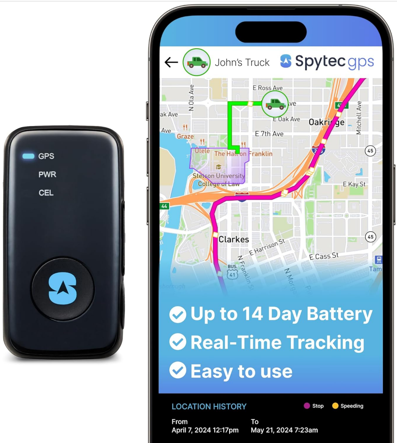
Figure 1.1: Spy Tec Mini GPS Smart Tracker and companion mobile application.