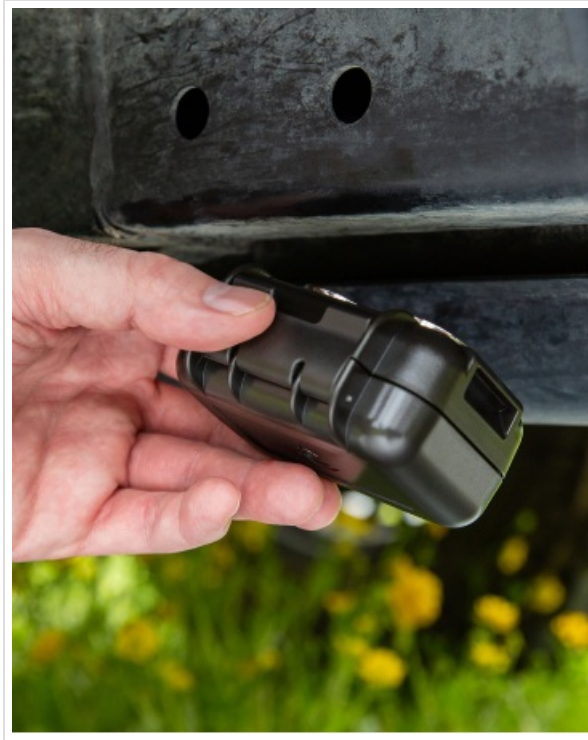
Figure 3.1: Proper installation of the tracker for optimal performance.