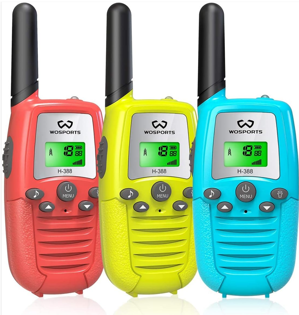
Image: A set of three WOSPORTS H-388 Kids Walkie Talkies, showcasing their distinct red, yellow, and blue colors. These compact devices are designed for easy handling by children.