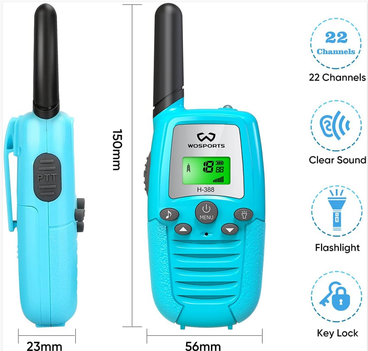
Image: A blue WOSPORTS H-388 walkie talkie is shown with its dimensions (150mm height, 56mm width, 23mm depth) and icons highlighting its features: 22 Channels, Clear Sound, Flashlight, and Key Lock.