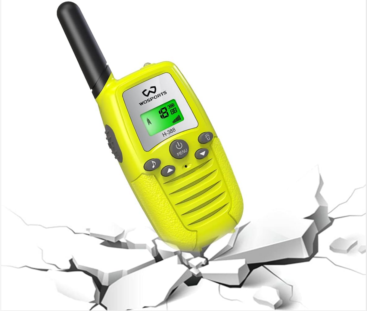
Image: A yellow WOSPORTS H-388 walkie talkie is depicted in a dynamic shot, emphasizing its drop-resistant design as it appears to bounce off a hard, cracked surface.