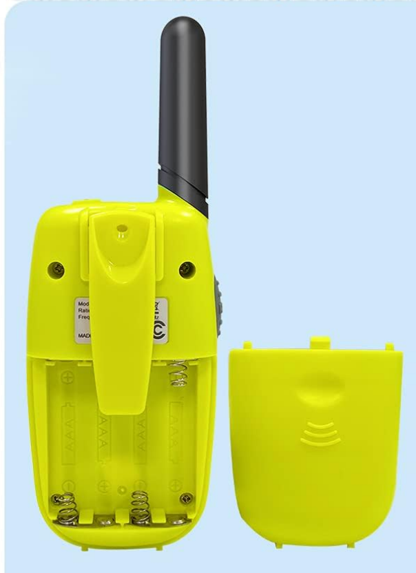
Image: A yellow WOSPORTS H-388 walkie talkie demonstrating its LED flashlight feature. Below, the open battery compartment is visible, indicating the use of AAA batteries (not included).

Rechargeable AAA ▶ Battery is Recommended (Battery not included)