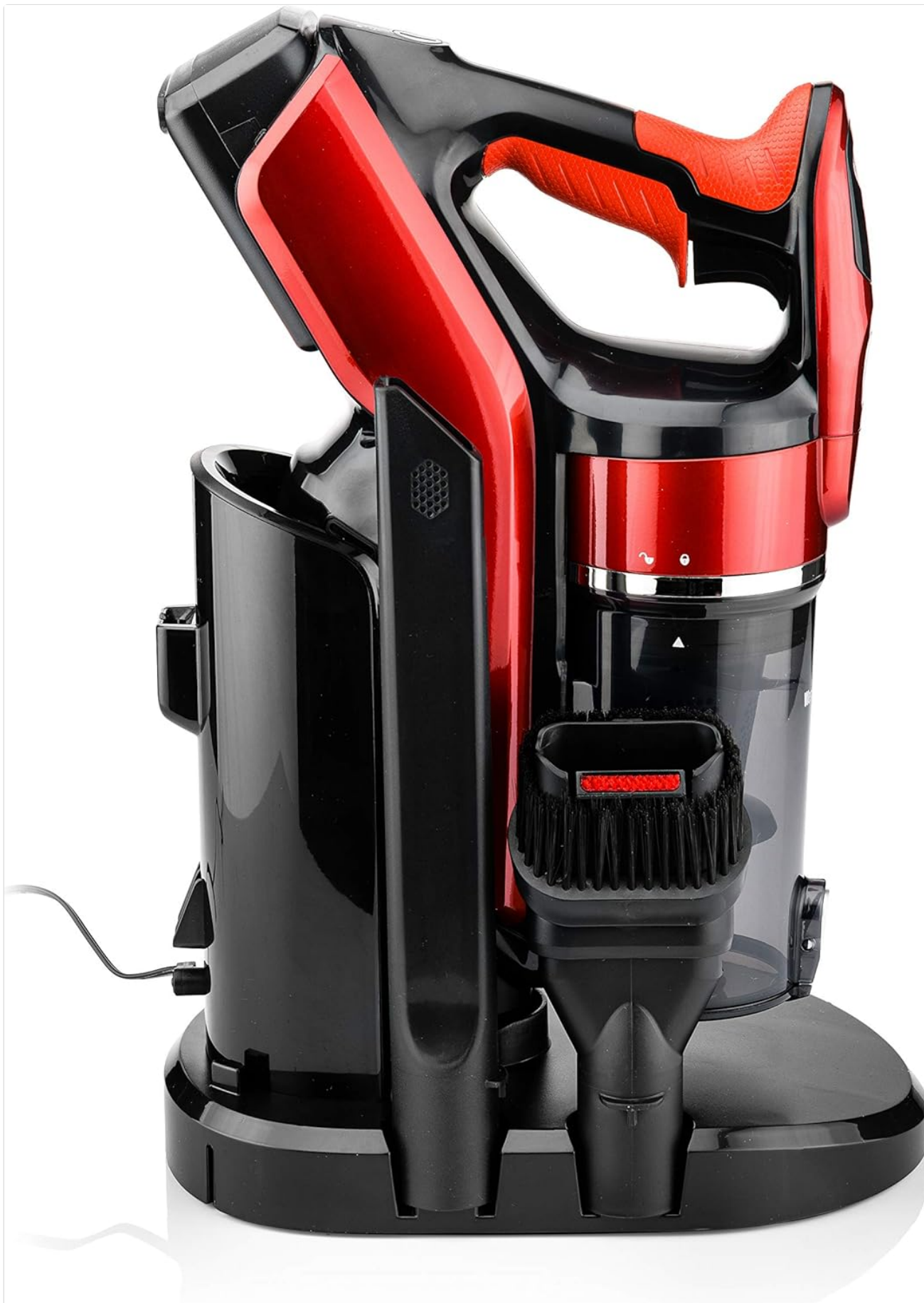
Image: The main vacuum unit placed in its charging station, with the 2-in-1 crevice tool and square nozzle attached to the station for storage.