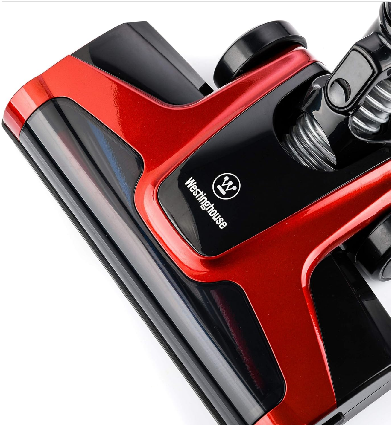
Image: A close-up view of the motorized floor brush, highlighting the brush roll and the Westinghouse logo on the red and black casing.