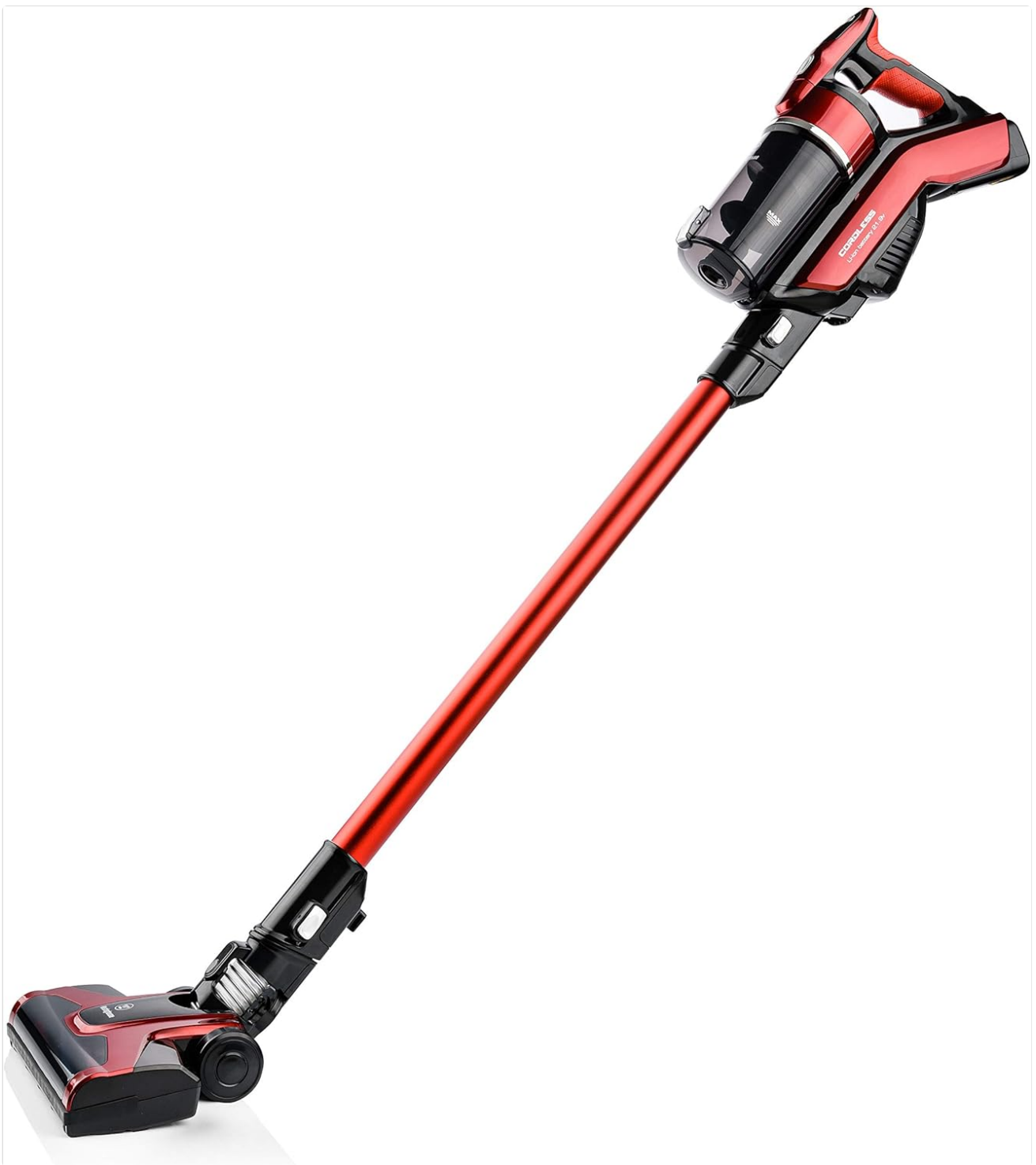
Image: The Westinghouse WEVC01 Cordless Vacuum Cleaner, fully assembled in its stick configuration, showcasing its red and black design.

Its lightweight design and cordless operation provide flexibility and ease of use for various cleaning tasks.