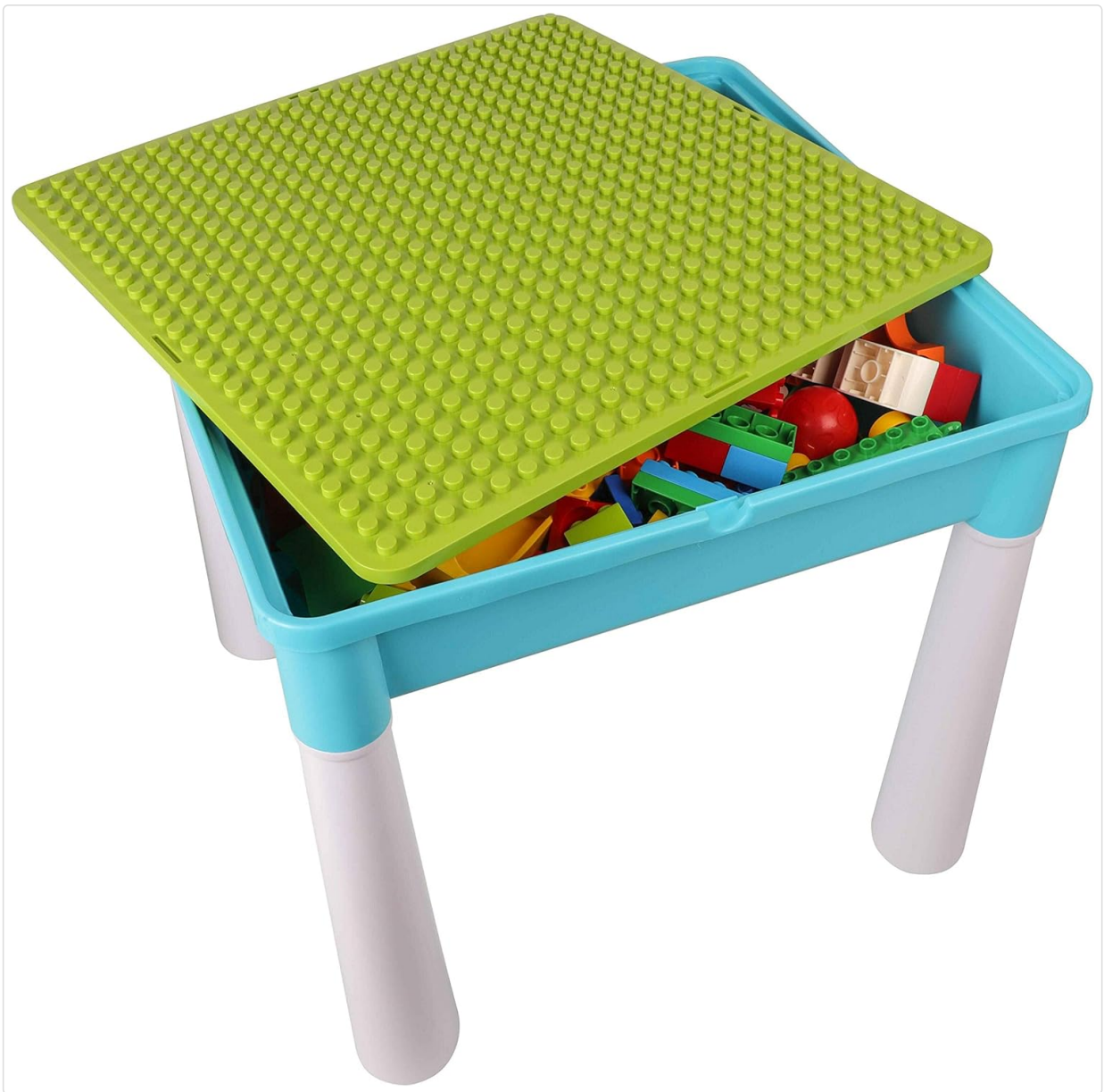
Image: The table with the playboard removed, revealing the internal storage compartment filled with blocks.