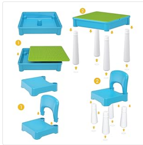
Image: Visual guide for the snap-together assembly of the table and chair legs.

Video: Demonstrating the unboxing and initial assembly of the Burgkidz activity table, highlighting the ease of putting components together.