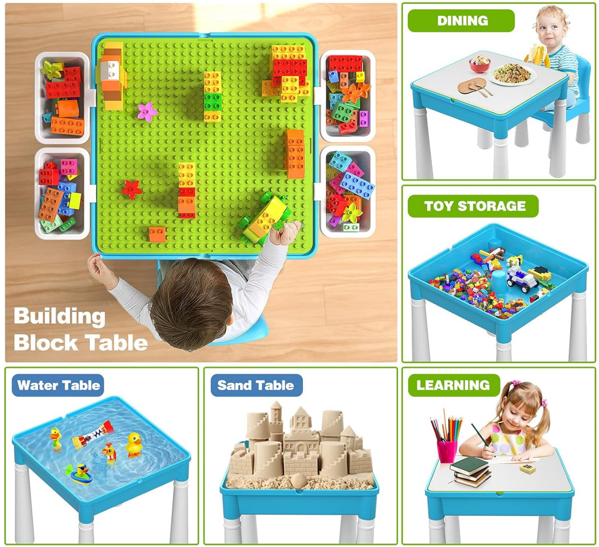
Image: Overhead view of the table in building block mode, showing blocks on the green studded surface and in side storage bins.

Video: Official product video showcasing the table's use as a building block play surface, demonstrating block compatibility and creative play.