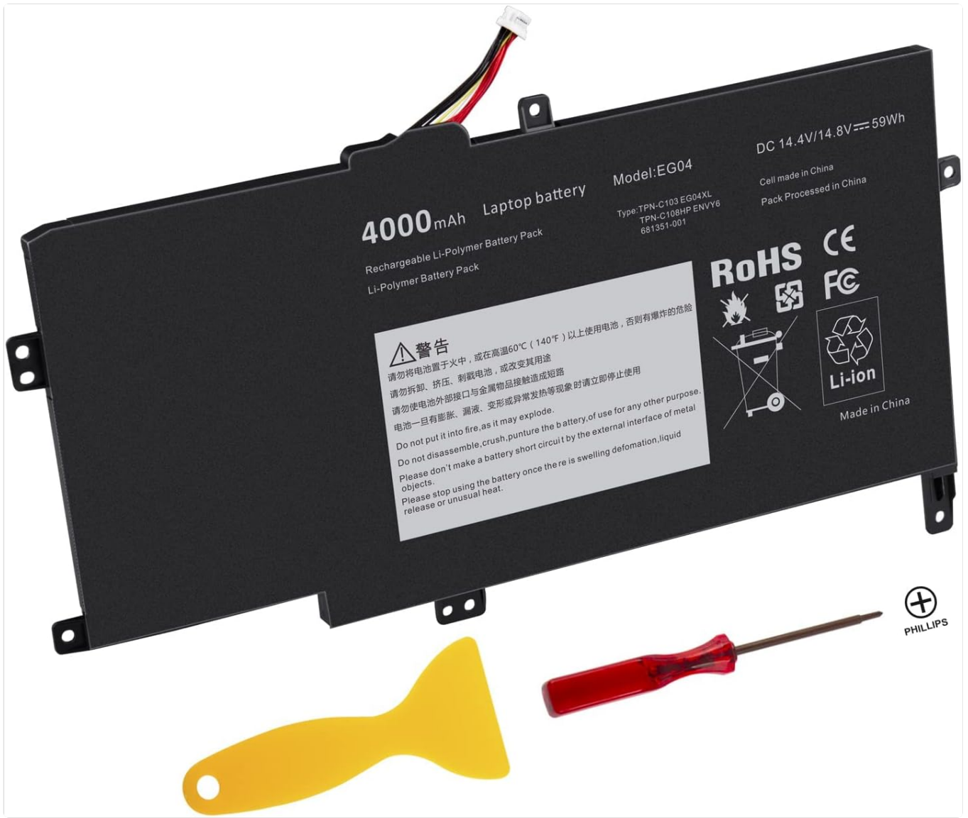
Image: The TREE.NB EG04XL battery shown alongside a yellow plastic pry tool and a red screwdriver, commonly used for laptop disassembly and battery replacement.