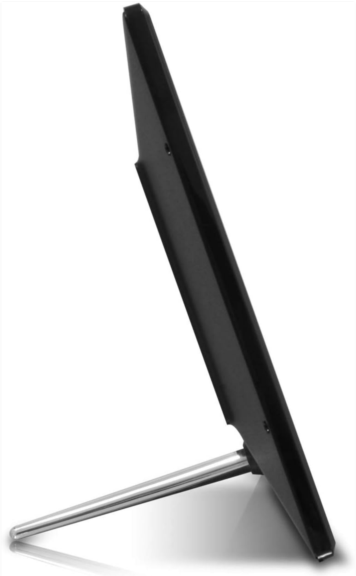
Side profile of the digital photo frame, illustrating its slim design and extended stand for tabletop use.