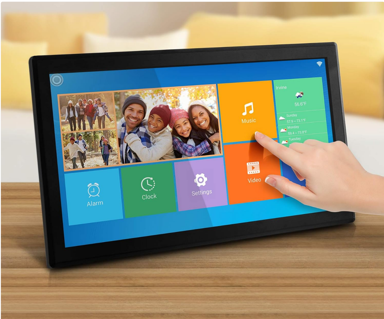
The digital photo frame showcasing a collage of family pictures on its vibrant display.