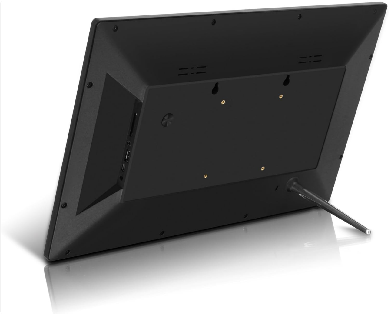
Rear view of the frame, highlighting the power input, USB port, SD card slot, and the integrated stand.