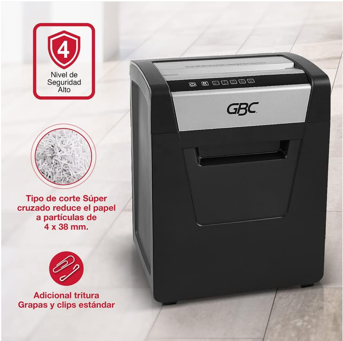
Image 6.1: This image shows the 23-liter capacity pull-out waste bin of the GBC ShredMaster SX15-06, demonstrating how easily it can be accessed and emptied when full.

Regular maintenance ensures optimal performance and extends the life of your shredder.