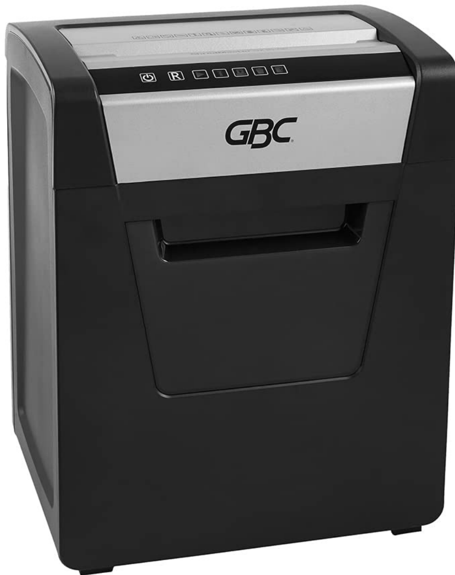
Image 1.1: Front view of the GBC ShredMaster SX15-06 Cross-Cut Paper Shredder. This image displays the shredder's overall design, including the paper entry slot, control panel, and the transparent window for viewing shredded waste in the bin.