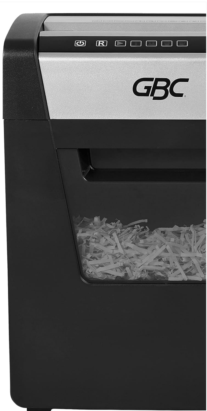
Image 3.1: Close-up of the GBC ShredMaster SX15-06 control panel. This image highlights the power button, reverse button, shredder in operation indicator, open door indicator, full bin indicator, overheating indicator, and automatic reverse indicator.