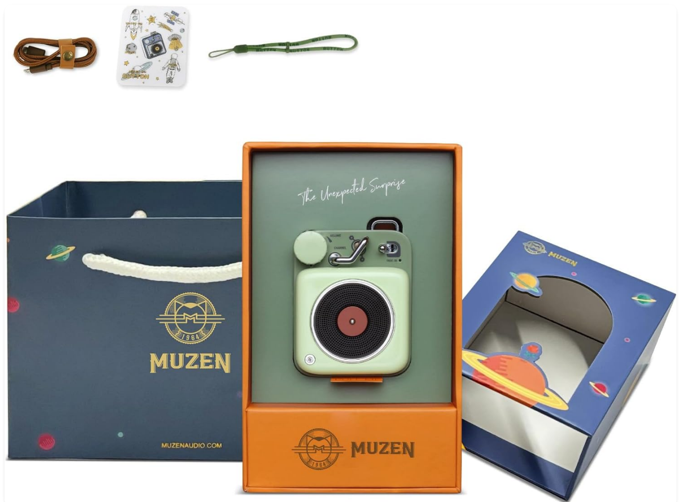
Image: The Muzen Mini Bluetooth Speaker, its charging cable, lanyard, stickers, and gift bag, all neatly arranged, showcasing the complete product package.

Thank you for choosing the Muzen Mini Bluetooth Speaker. This compact and stylish speaker delivers excellent sound quality in a portable design. Please read this manual carefully to ensure proper use and maintenance of your device.