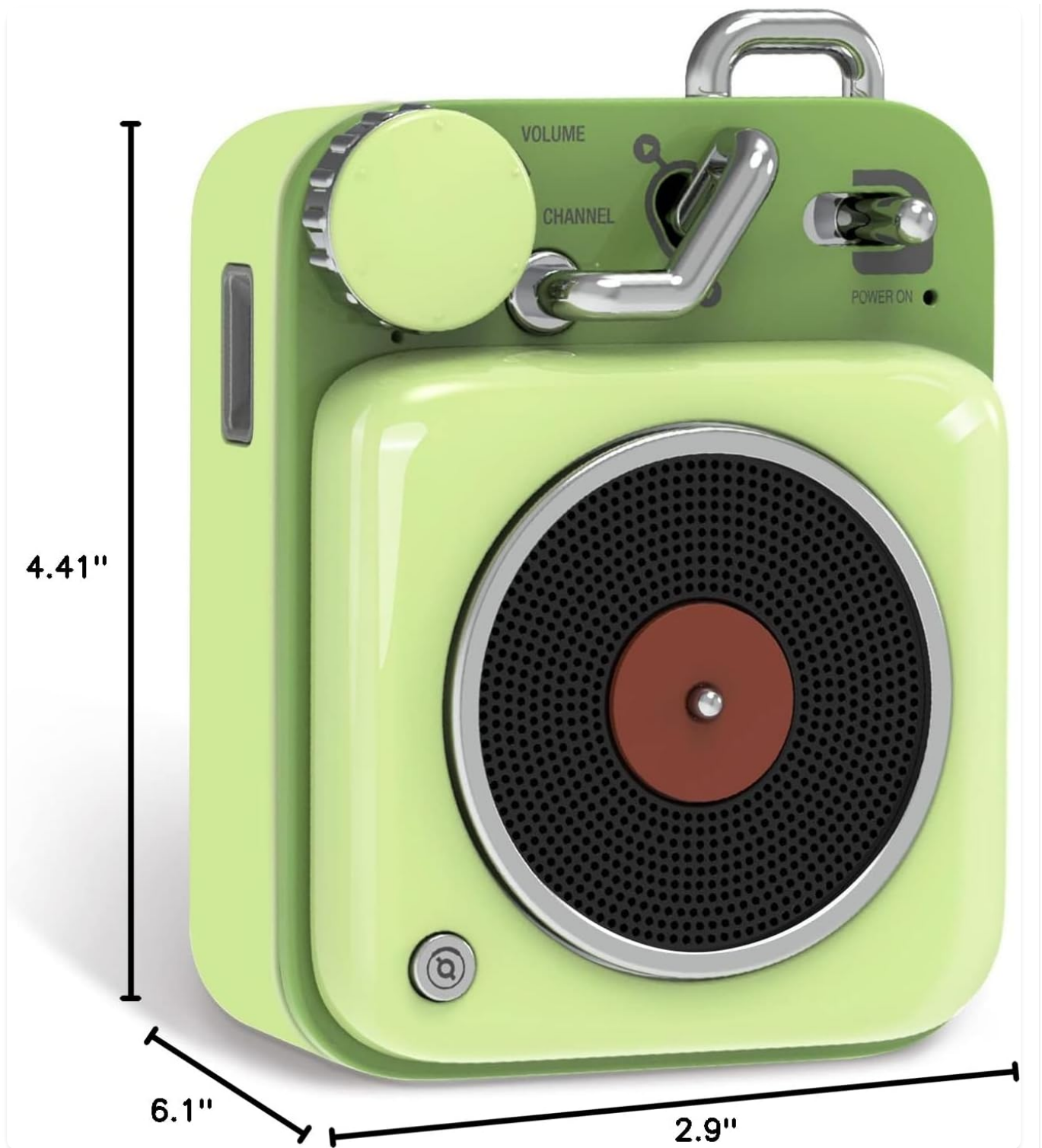
Image: The Muzen Mini Bluetooth Speaker shown with its precise dimensions (height, width, depth) indicated for reference.