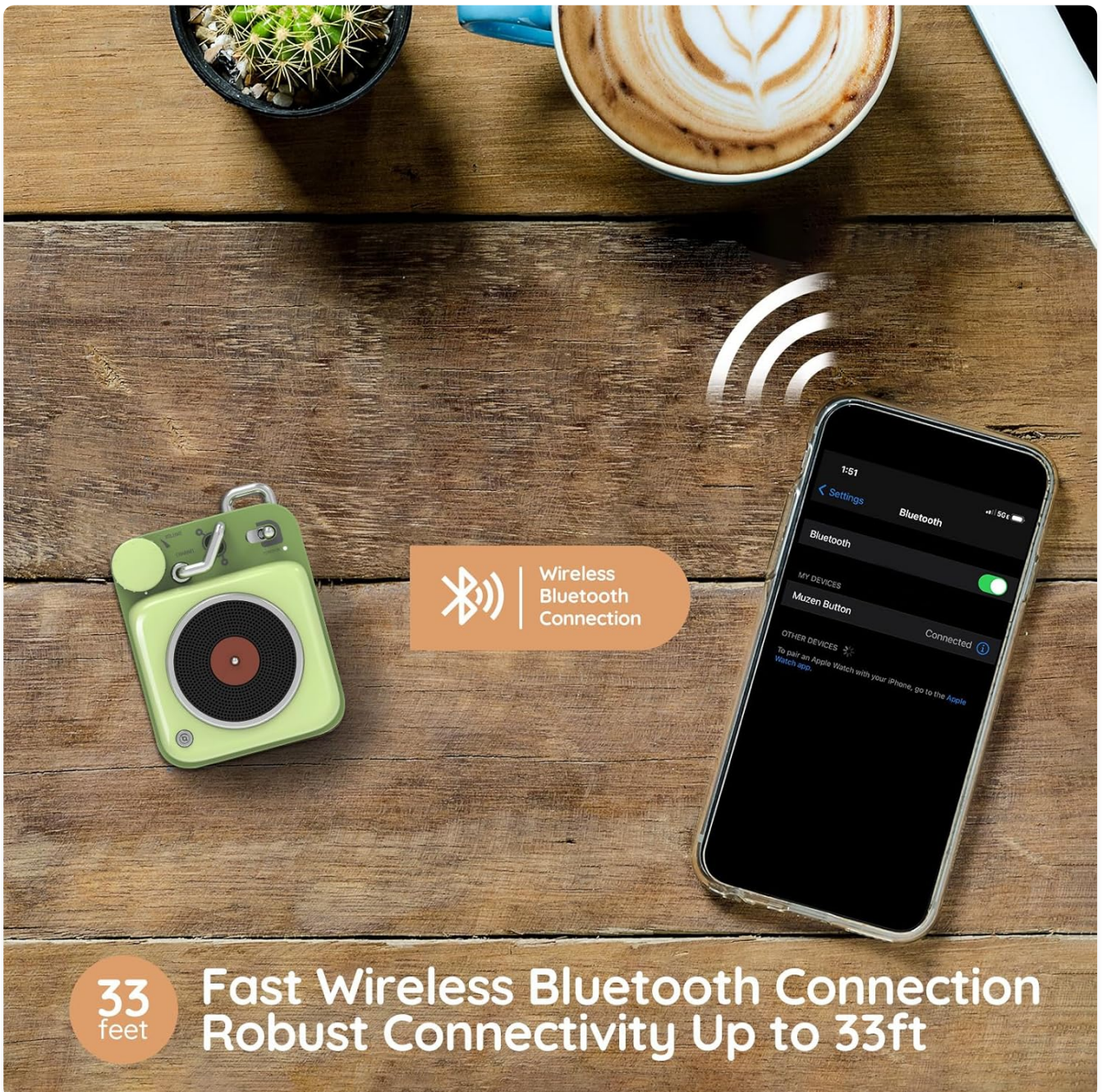
Image: The Muzen Mini Bluetooth Speaker positioned next to a smartphone, with the phone's screen displaying a successful Bluetooth connection to "Muzen