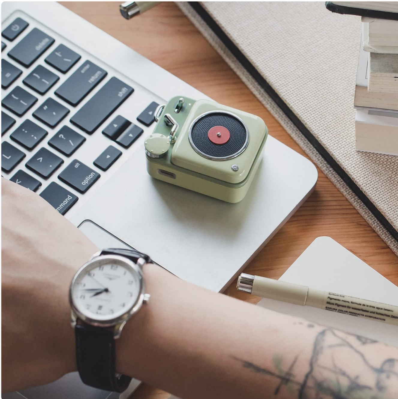
Image: The Muzen Mini Bluetooth Speaker resting on a laptop keyboard, demonstrating its compact size and compatibility with various devices.