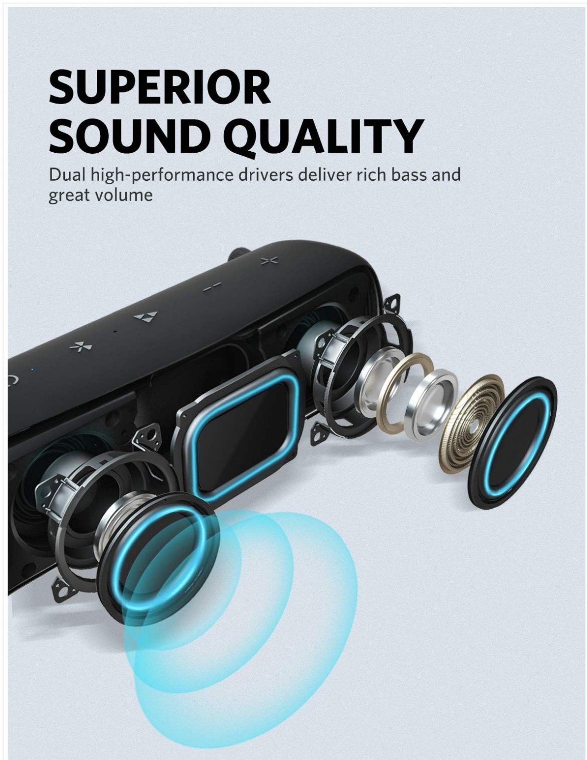
Figure 2.2: Internal view highlighting dual high-performance drivers.