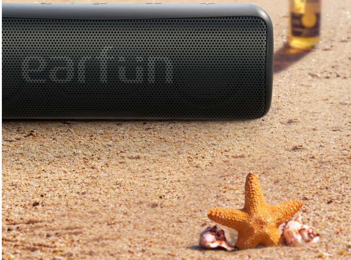
Figure 2.5: Enjoy music all day with 24-hour battery life.

Enjoy your favorite music all day, and all night too