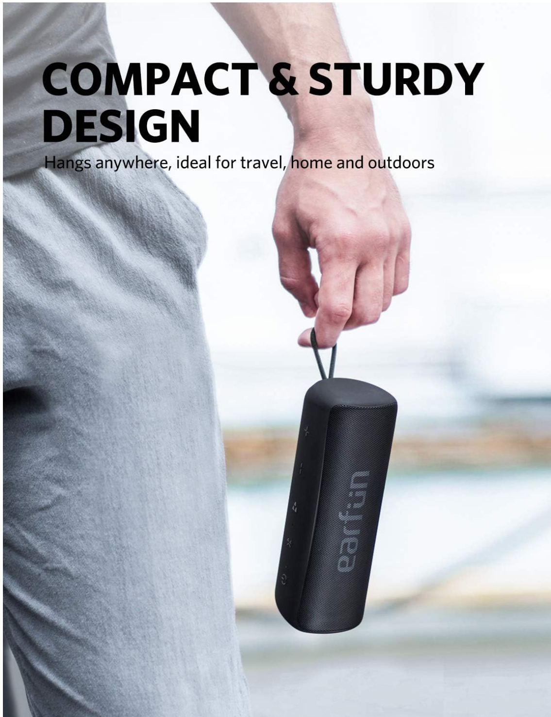
Figure 2.6: Compact design with a convenient hang strap.

Hangs anywhere, ideal for travel, home and outdoors