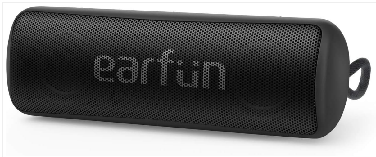
Figure 2.1: EarFun Go Portable Bluetooth Speaker (Front View)

The EarFun Go is a compact and robust portable Bluetooth speaker designed for high-quality audio on the go. It features advanced sound technology, durable construction, and versatile connectivity options.