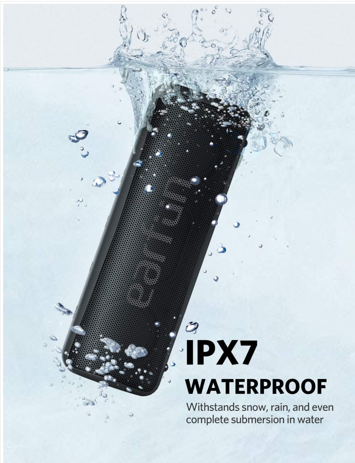
Figure 2.3: Speaker demonstrating IPX7 waterproof capability.