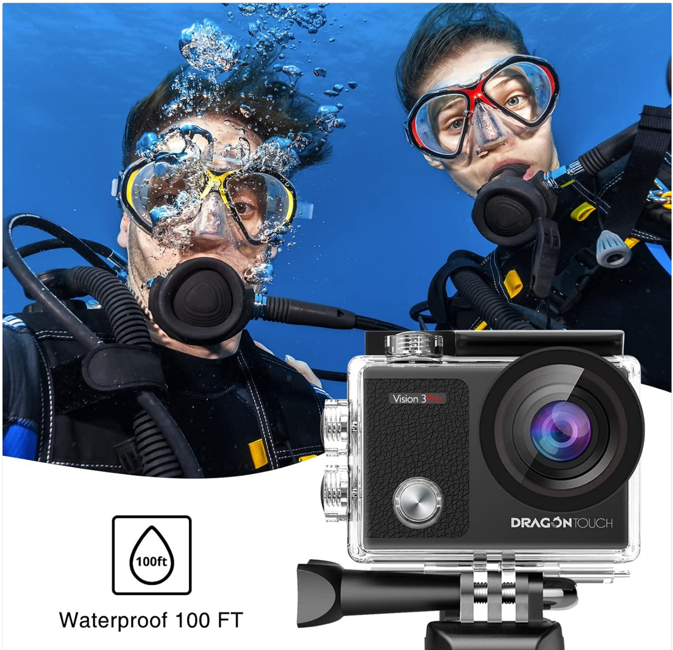
Figure 2: Camera in waterproof case for underwater use.

Securely fasten the case to ensure a watertight seal. The camera can be used as deep as 100 feet (30 meters) with the waterproof case.