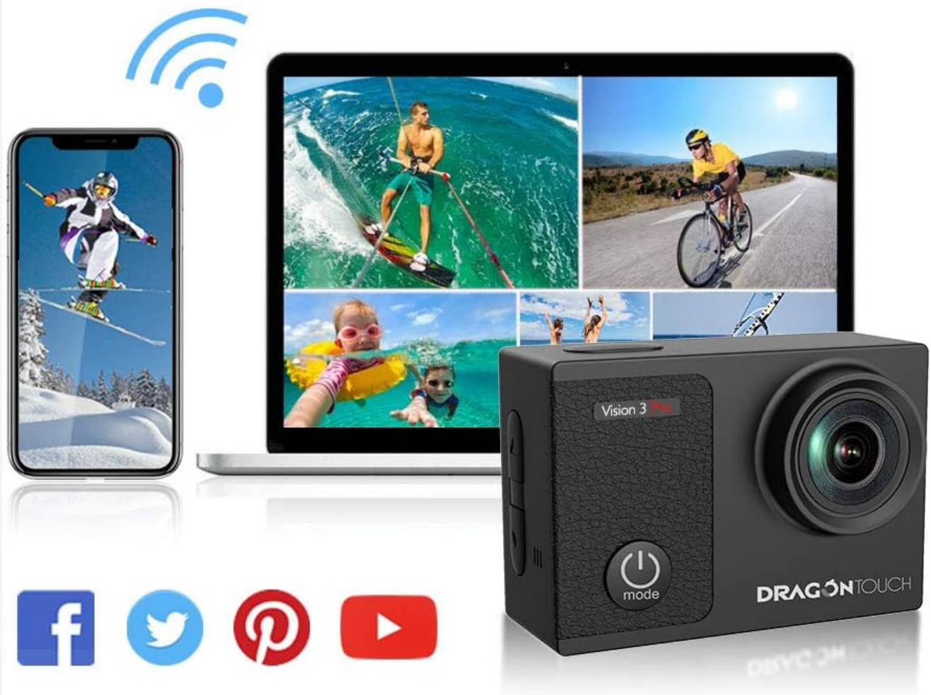
Figure 6: App connectivity for easy sharing.