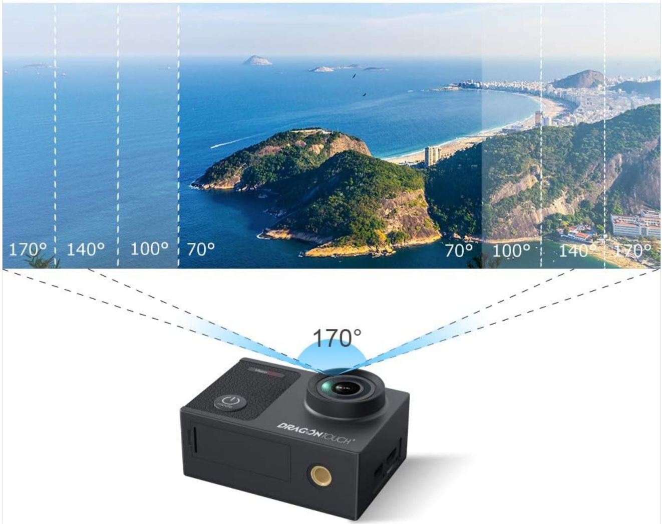
Figure 5: Demonstrating adjustable view angles.