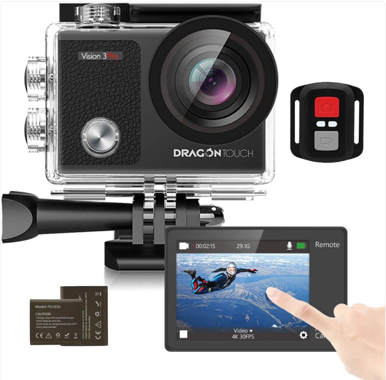
Figure 1: Dragon Touch Vision 3 Pro Action Camera and accessories.