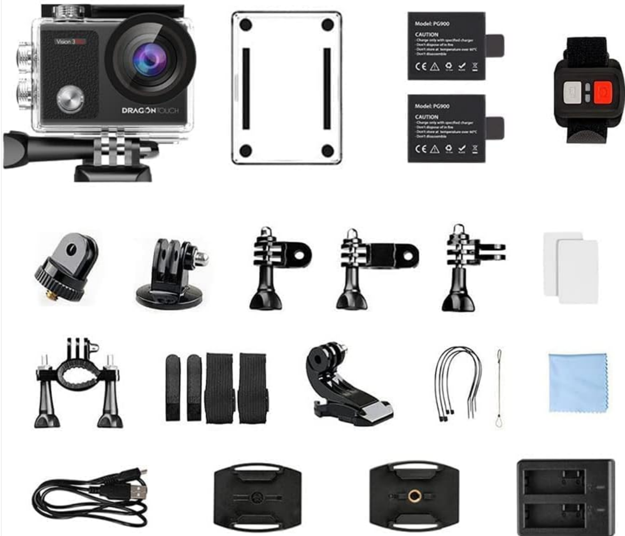
Figure 3: Package contents including camera, batteries, remote, and mounts.